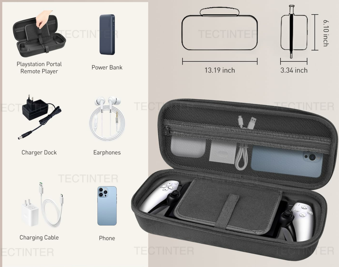
Image: An illustration showing the high capacity storage of the case, capable of holding the PlayStation Portal, power bank, charger dock, earphones, charging cable, and a phone.

Keep All Kind of Playstation Portal Remote Player Accessories in One Case