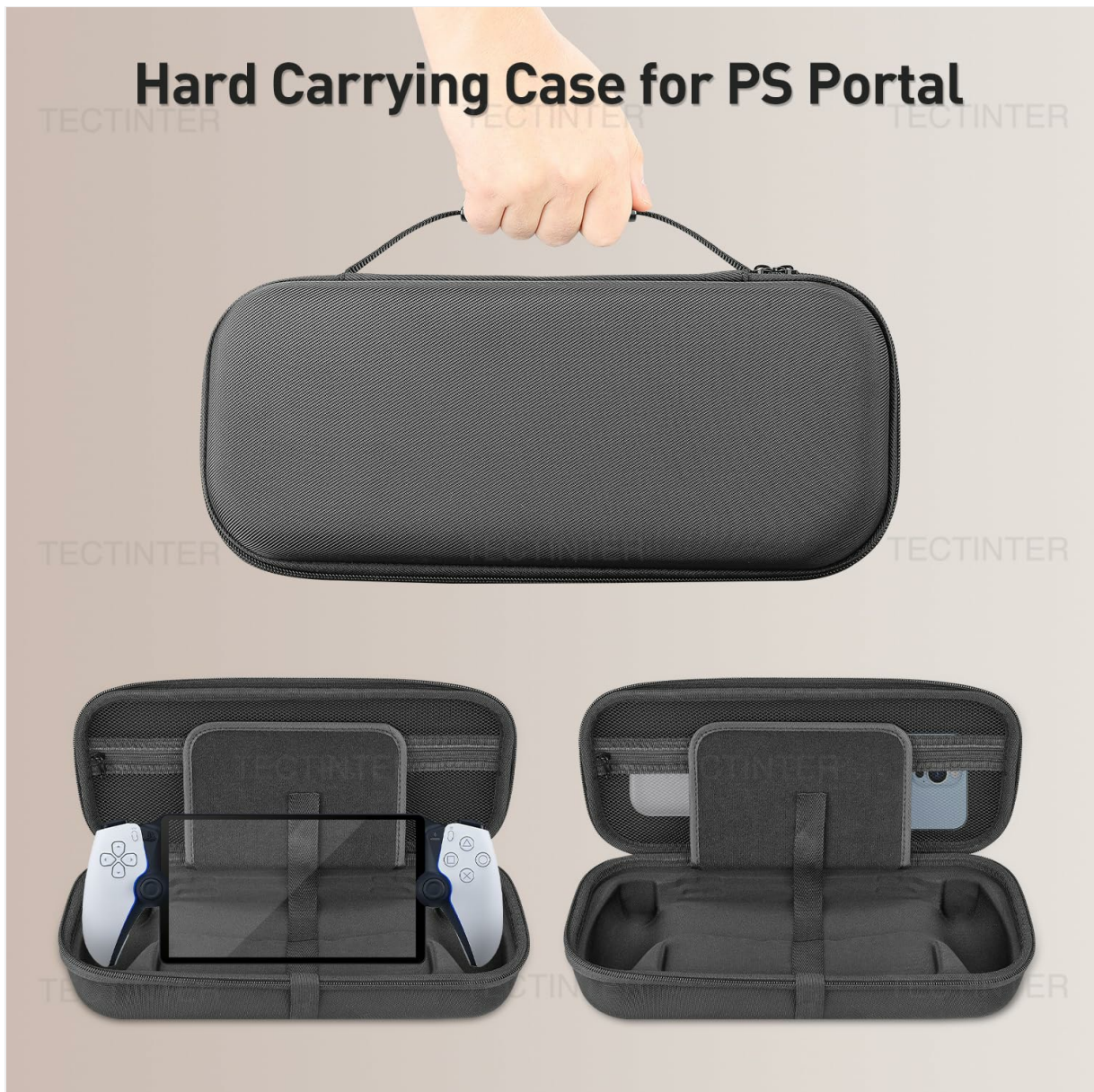
Image: The hard carrying case for PS Portal, shown both closed with a handle and open with a PlayStation Portal device securely placed inside.