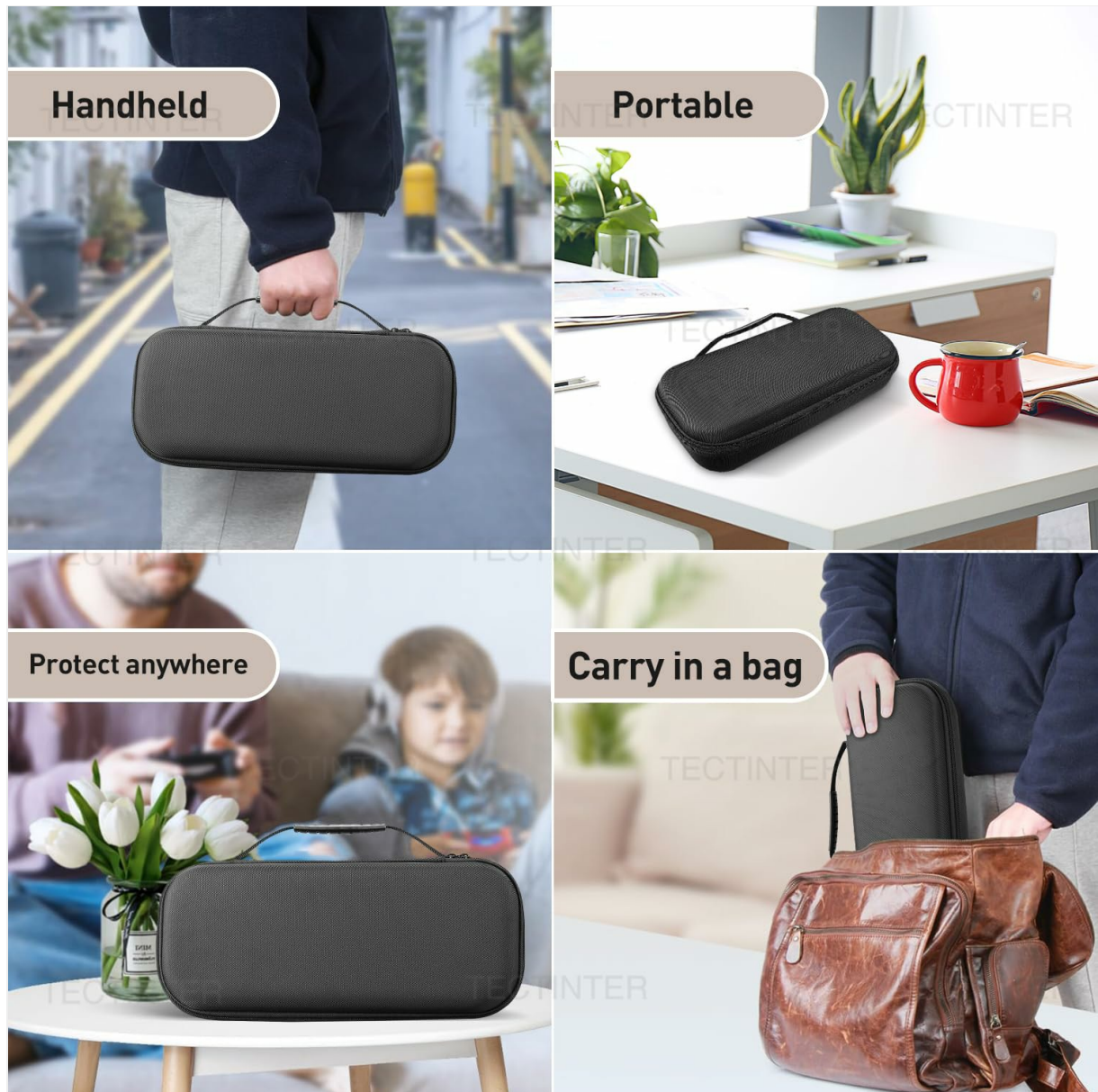
Image: Four panels demonstrating the portability of the case: handheld, placed on a table, used for protection anywhere, and carried inside a bag.