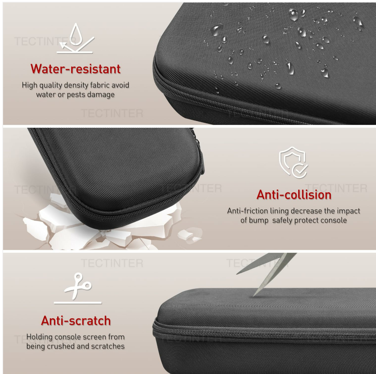
Image: Three panels illustrating the protective qualities of the case: water-resistant fabric, anti-collision lining, and anti-scratch design to protect the console screen.