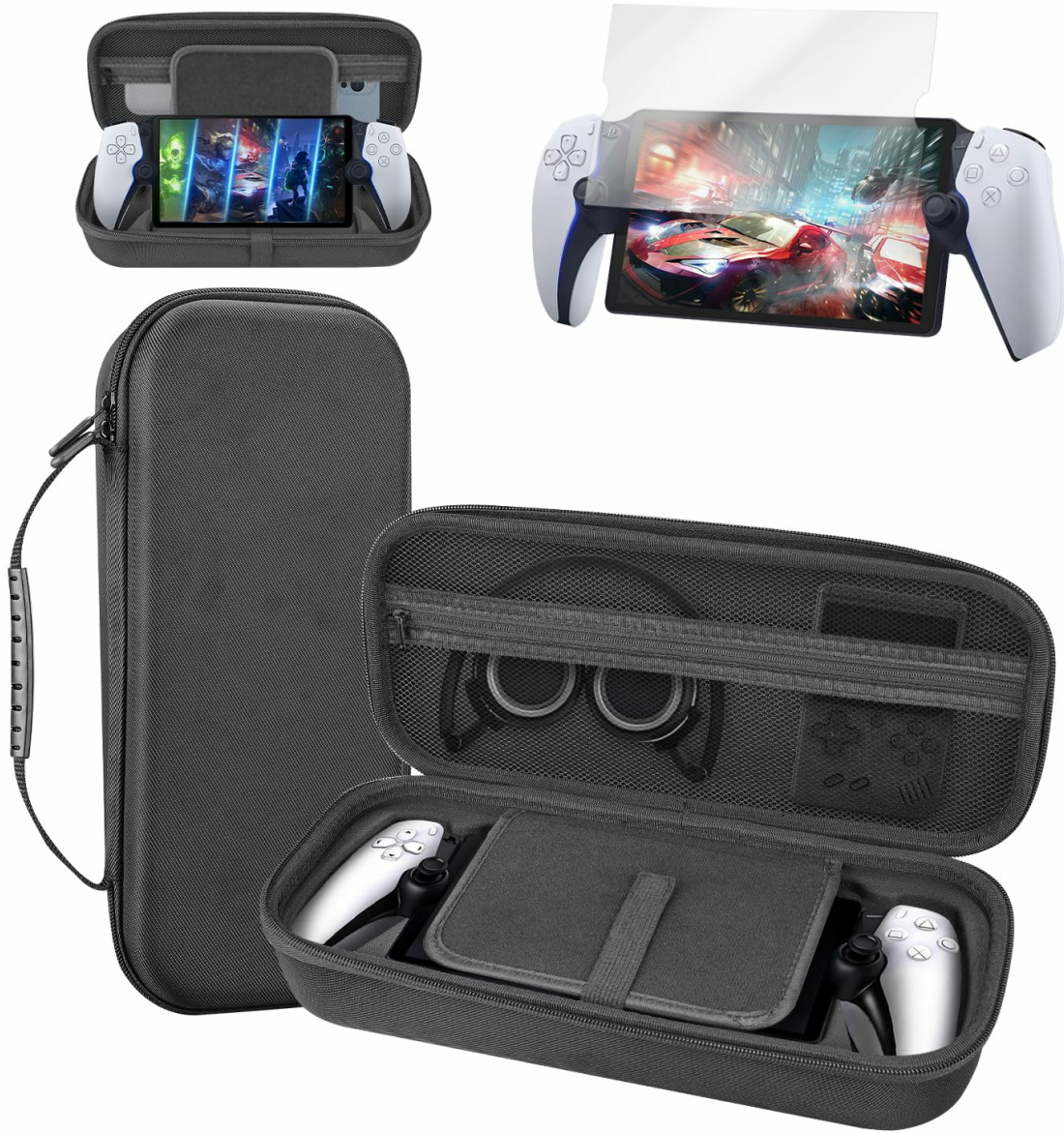
Image: Overview of the TECTINTER 3-in-1 PS Portal Case Kit, showing the EVA travel case, screen protector, and a PlayStation Portal device.