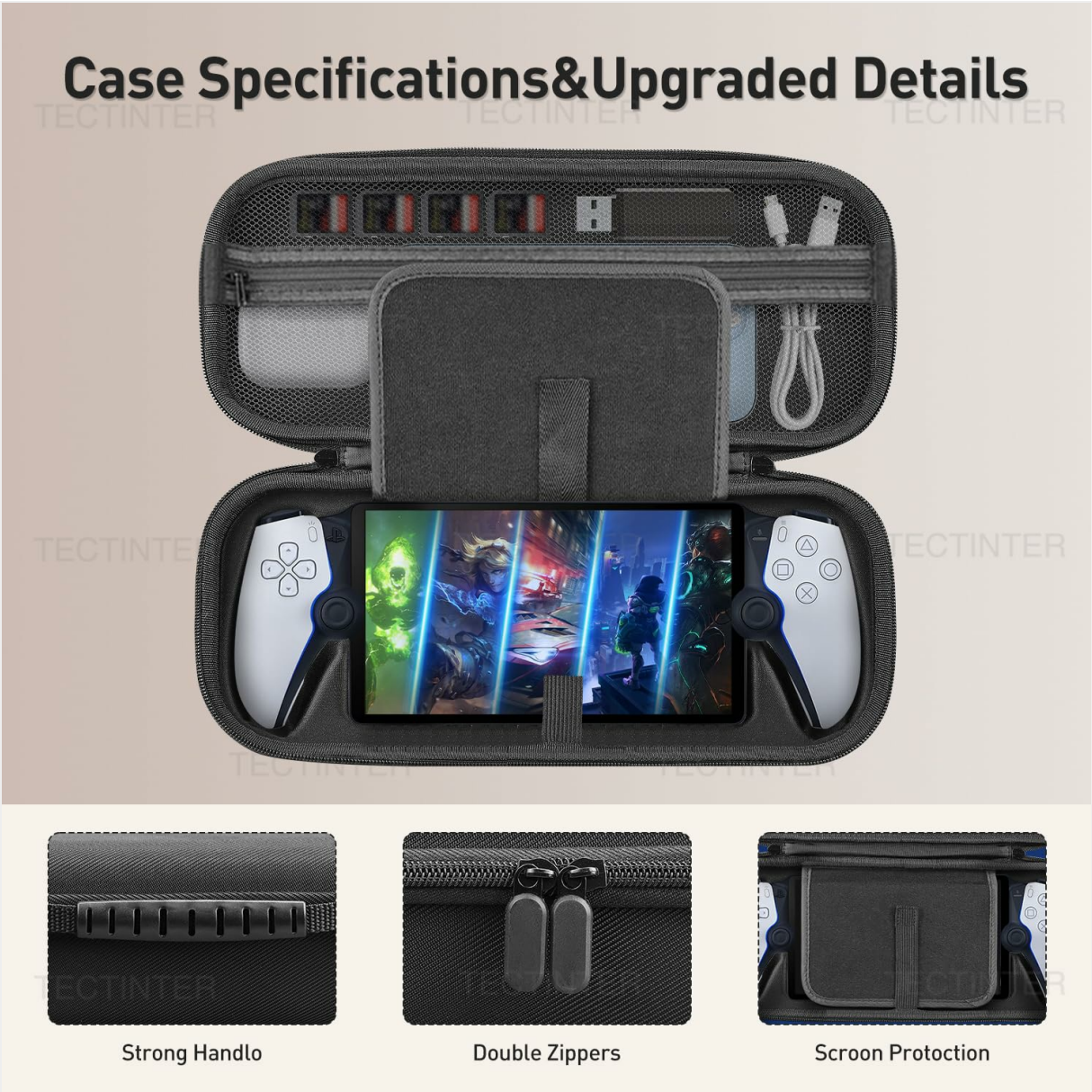
Image: Detailed view of the case's features, including a strong handle, double zippers, and screen protection design.