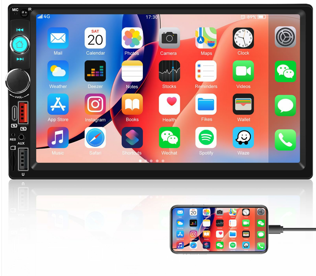
Image: Front view of the CAMECHO Double Din Car Stereo Radio with its 7-inch HD touch screen.