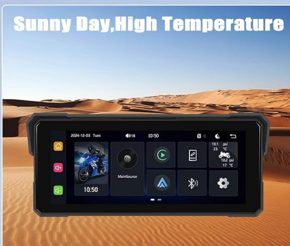
Image: The screen's durability in various riding environments.