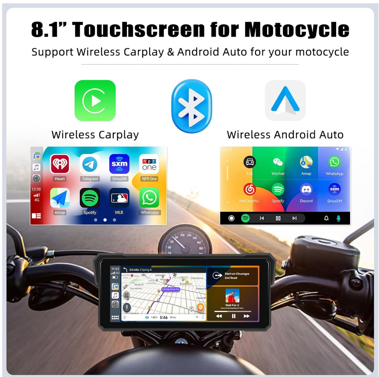
Image: Wireless CarPlay and Android Auto interfaces on the screen.