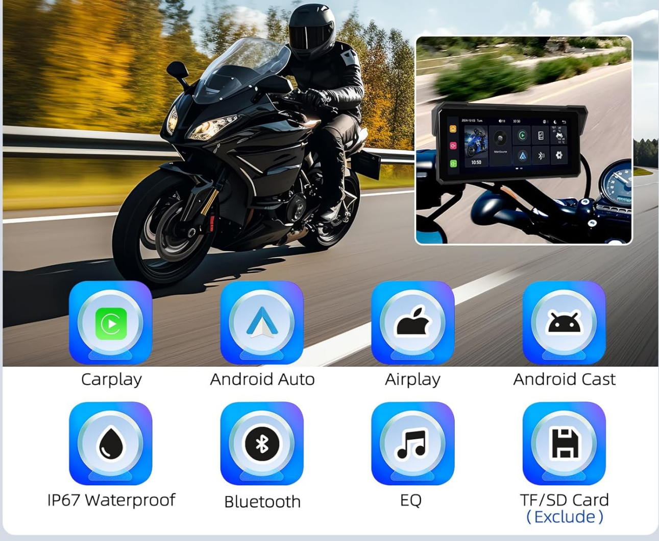
Image: Overview of the CAMECHO 8.1-inch Portable Motorcycle Screen highlighting key features.