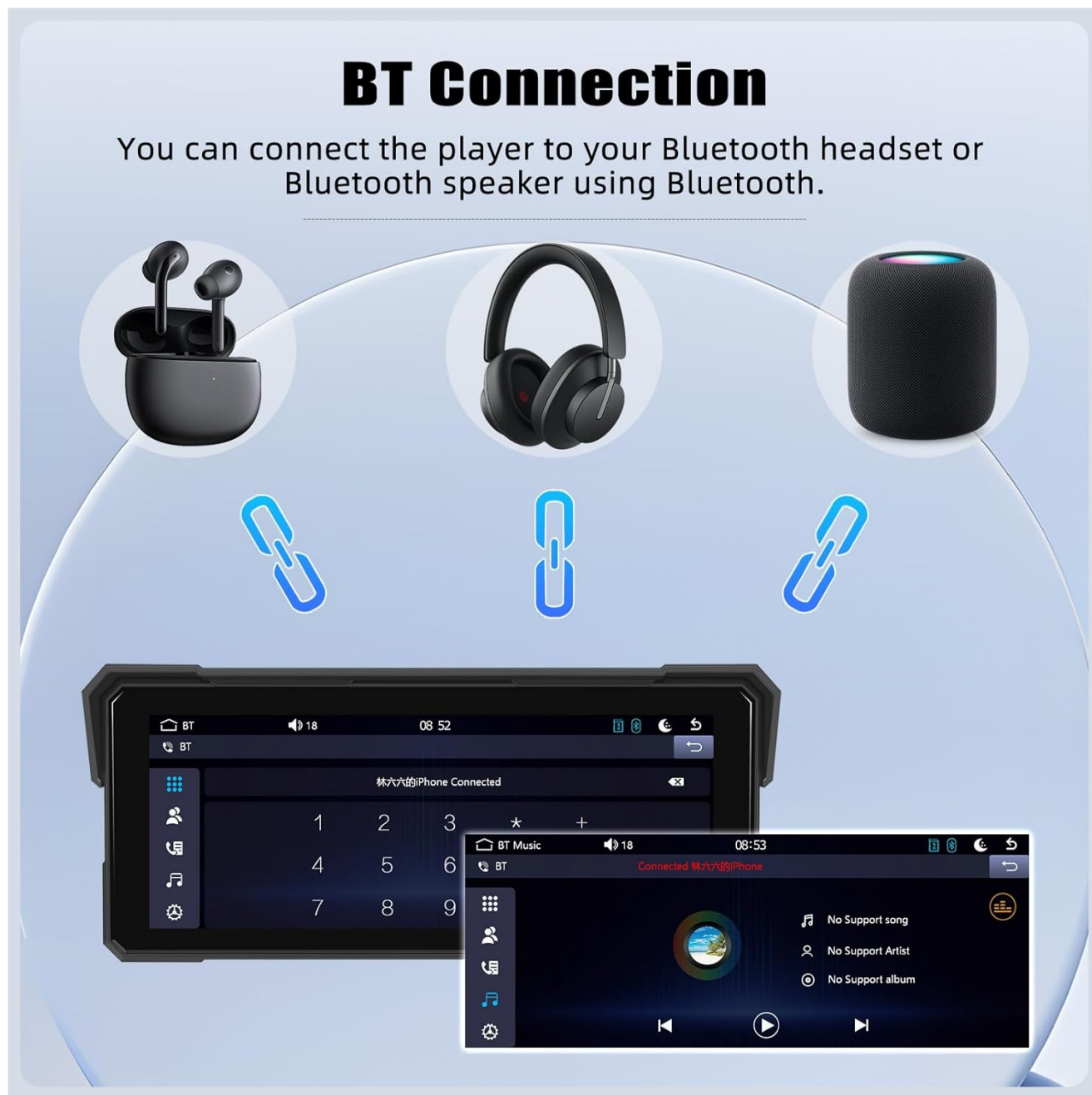
Image: Dual Bluetooth connectivity for phone and audio devices.