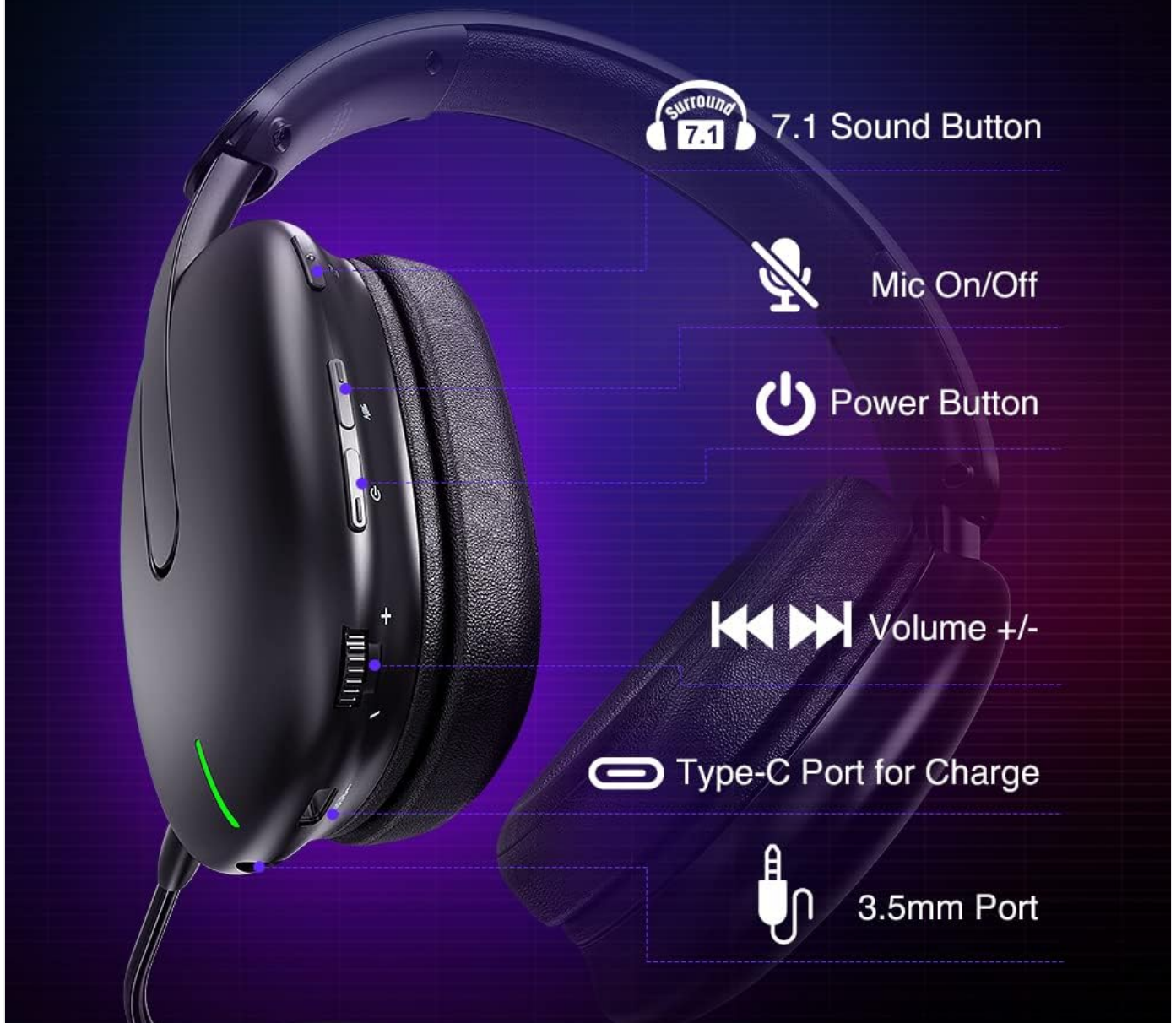
Image: A diagram highlighting the various control buttons and ports located on the earcup of the WolfLawS TA82 headset, including the 7.1 Sound Button, Mic On/Off, Power Button, Volume +/-, Type-C Port for Charge, and 3.5mm Port.