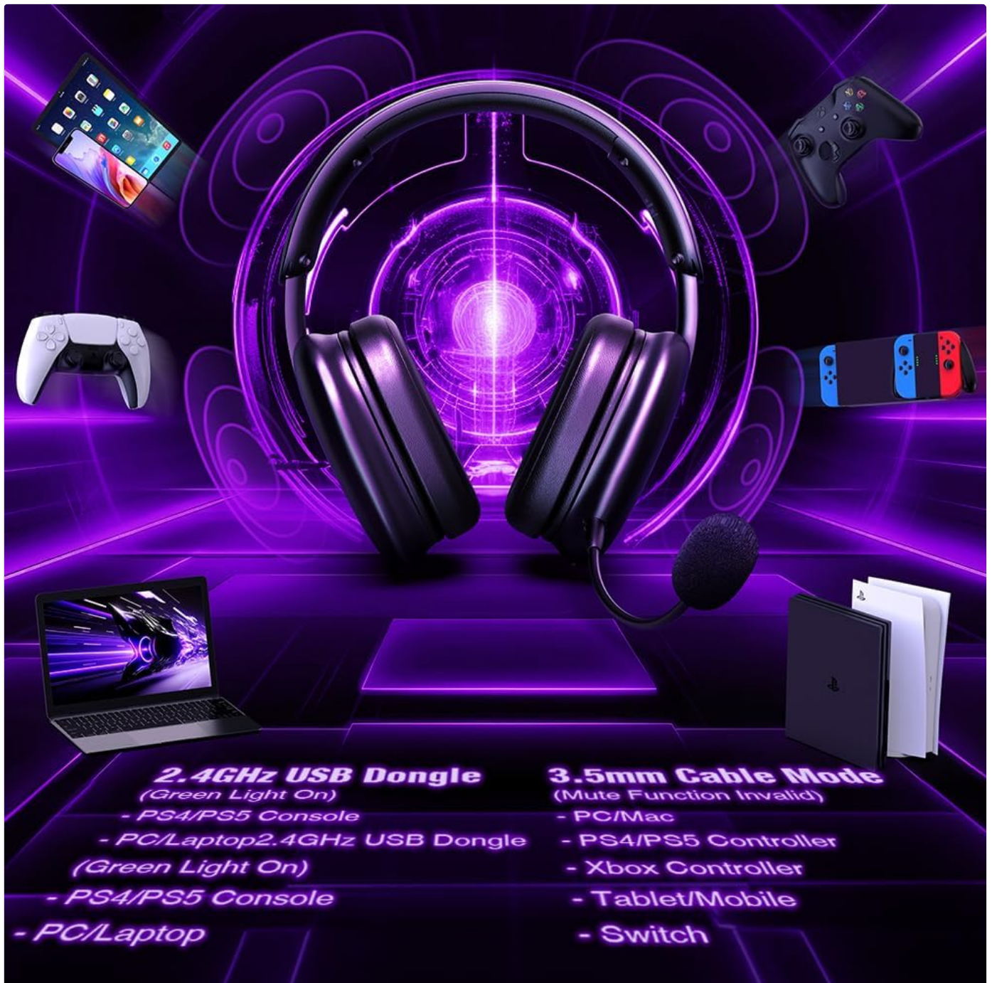
Image: A detailed chart outlining the compatibility of the WolfLawS TA82 headset in both wireless and wired modes across various devices like Desktop, Mac, Laptop, Switch, Xbox, PS4/PS5, Cell Phone, and Tablet.