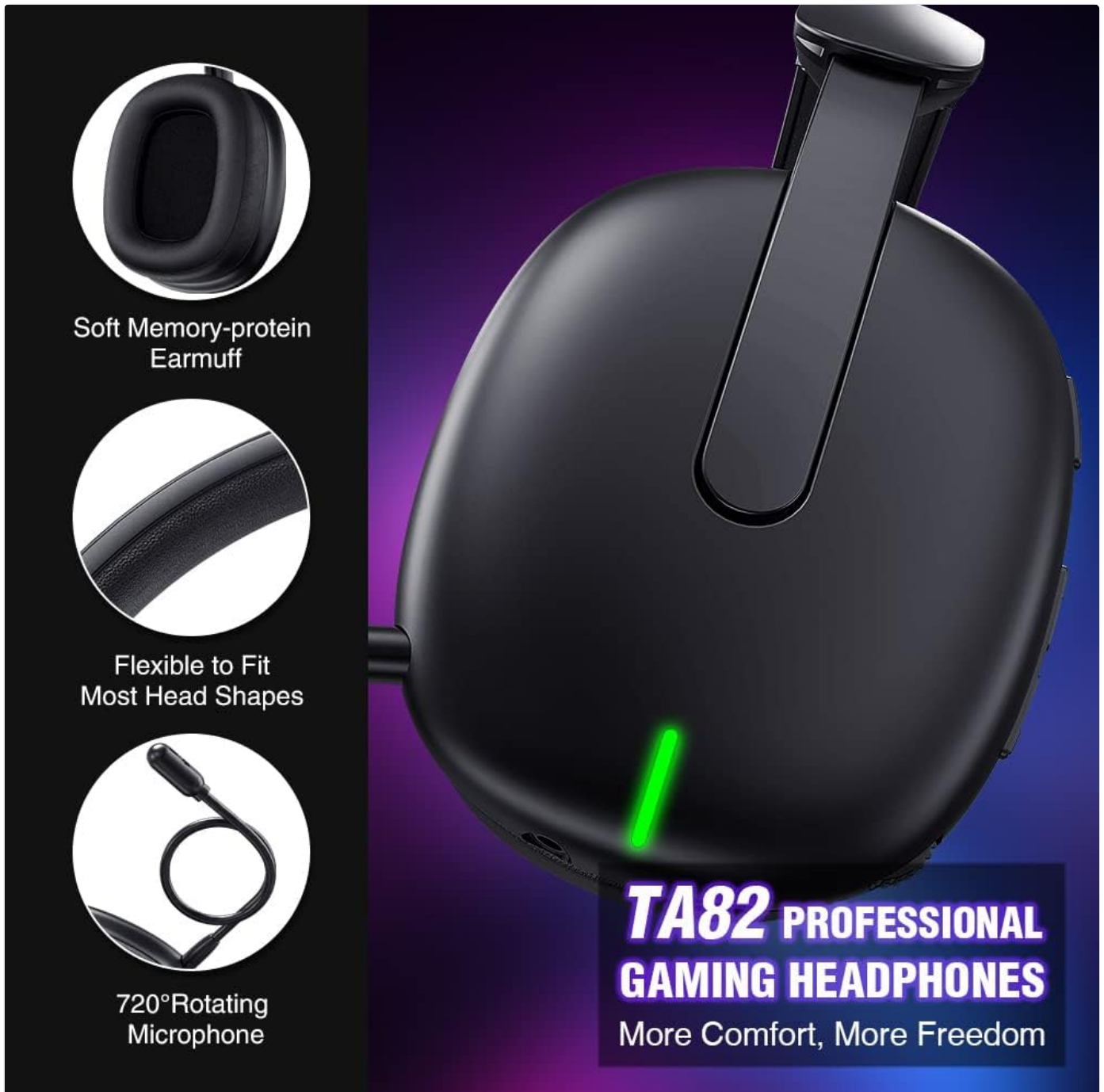
Image: A close-up view of the WolfLawS TA82 headset's soft memory-protein earmuffs and flexible headband, designed for comfort and adaptability to various head shapes.