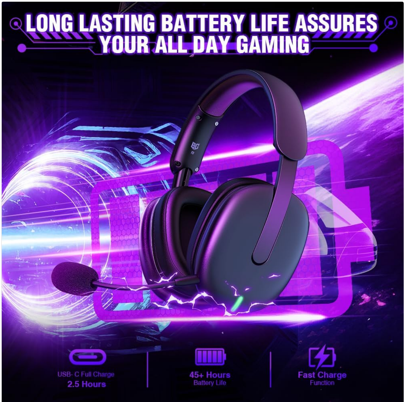
Image: An illustration depicting the WolfLawS TA82 headset being charged via its USB-C port, highlighting its 45+ hours of battery life and fast charge function.