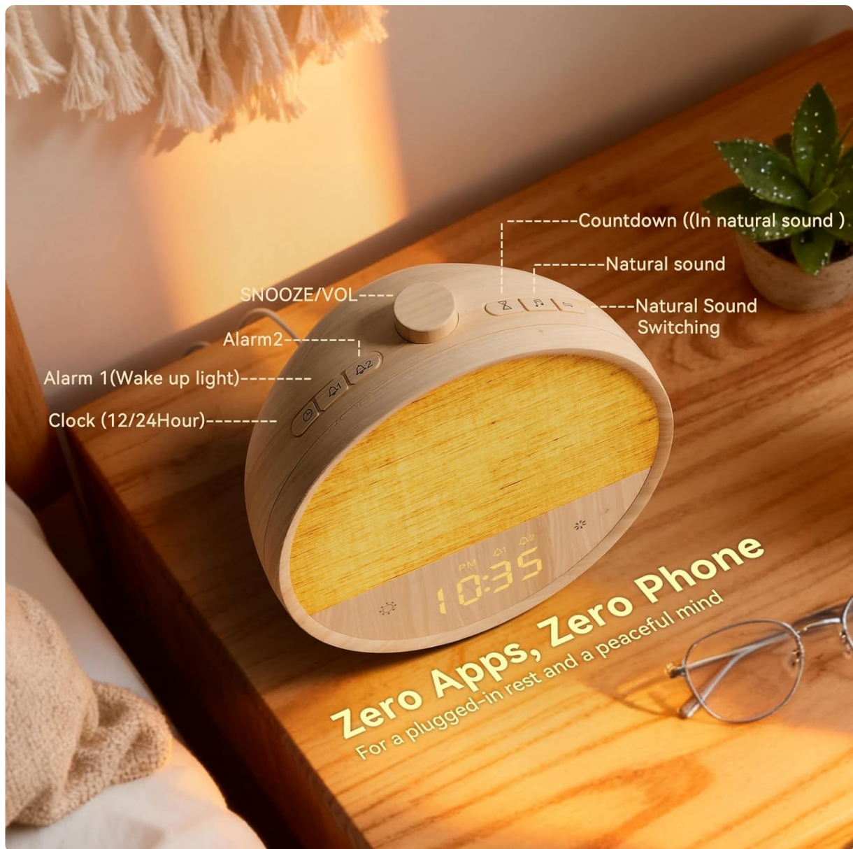
Image: A detailed view of the top control panel of the alarm clock, indicating buttons for clock settings, dual alarms, snooze/volume, countdown, natural sound selection, and natural sound switching.

The device features two independent alarms. To set Alarm 1 (Wake-up Light), press and hold the Alarm 1 button. Use the SNOOZE/VOL knob to set the desired wake-up time. Follow the on-screen prompts to select your preferred light intensity and sound. For a light-only wake-up, set the alarm volume to V00. Repeat this process for Alarm 2 if needed.