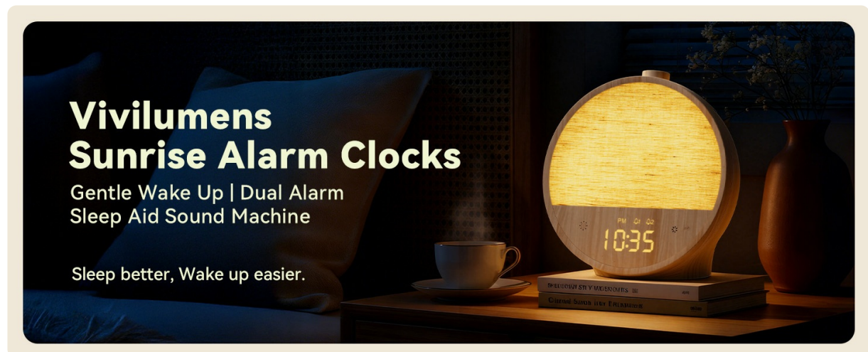
Image: The Vivilumens Sunrise Alarm Clock showcasing its multi-functional design including dual alarm, wake-up light, white noise, sleep aid, and RGB light features.

Welcome to your new Vivilumens Wood Grain Sunrise Alarm Clock. This device is designed to enhance your morning routine with a gentle, natural wake-up experience and provide a calming atmosphere for sleep. It combines a sunrise simulation light, natural sound machine, dual alarms, RGB mood lighting, and a dimmable night lamp. Please read this manual carefully to ensure proper use and optimal performance.