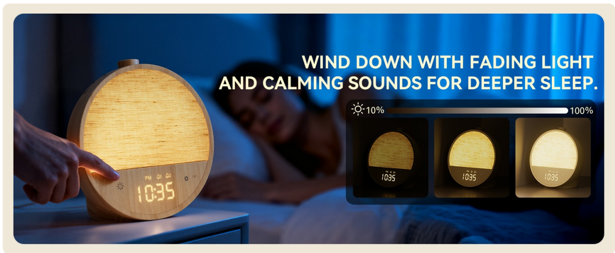
Image: The clock functioning as a dimmable night light, showing various brightness levels of the warm white light.