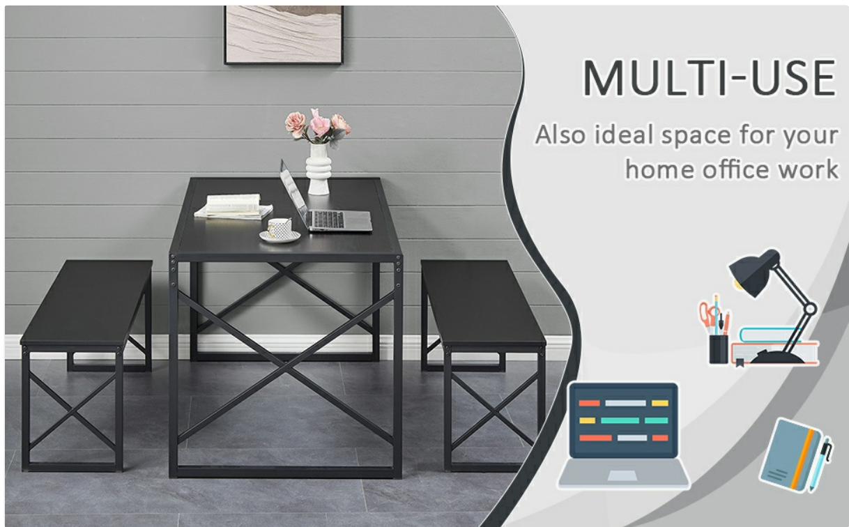
Image: The table set configured for home office use, highlighting its versatility.