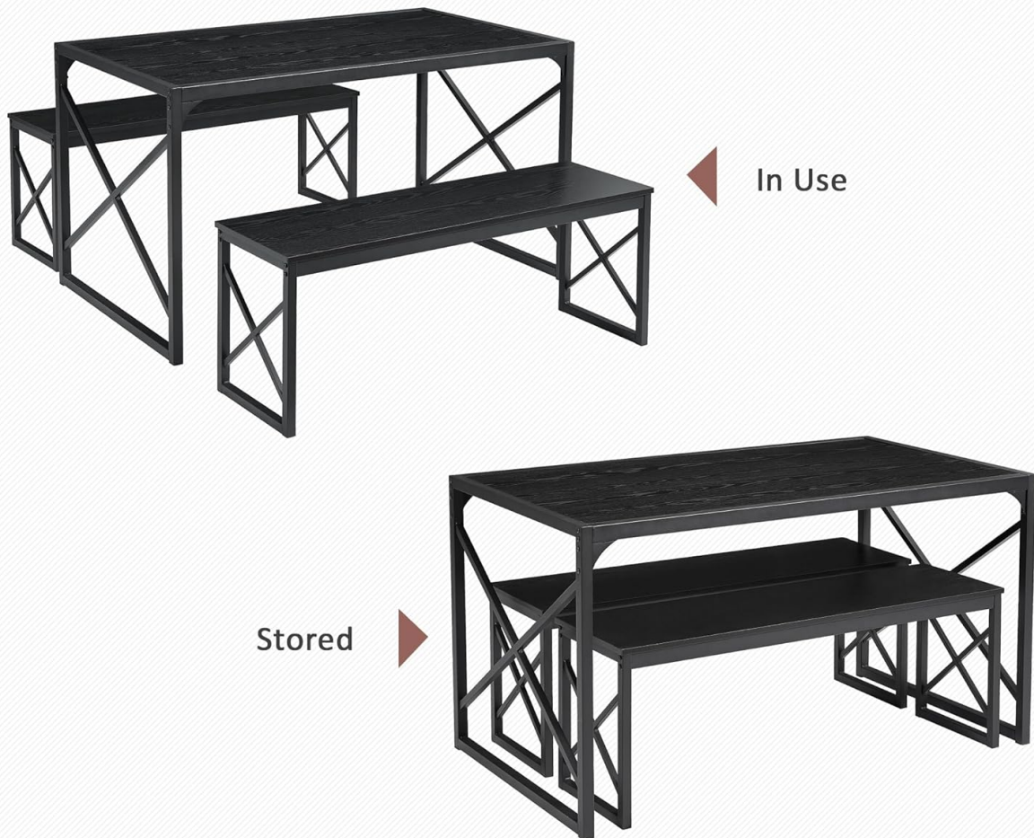
Image: Demonstrating the space-saving design with benches stored under the table.

Store the benches completely underneath the table when not in use, ideal for space-limited rooms.