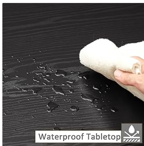
Image: Demonstrating the waterproof nature of the tabletop for easy cleaning.