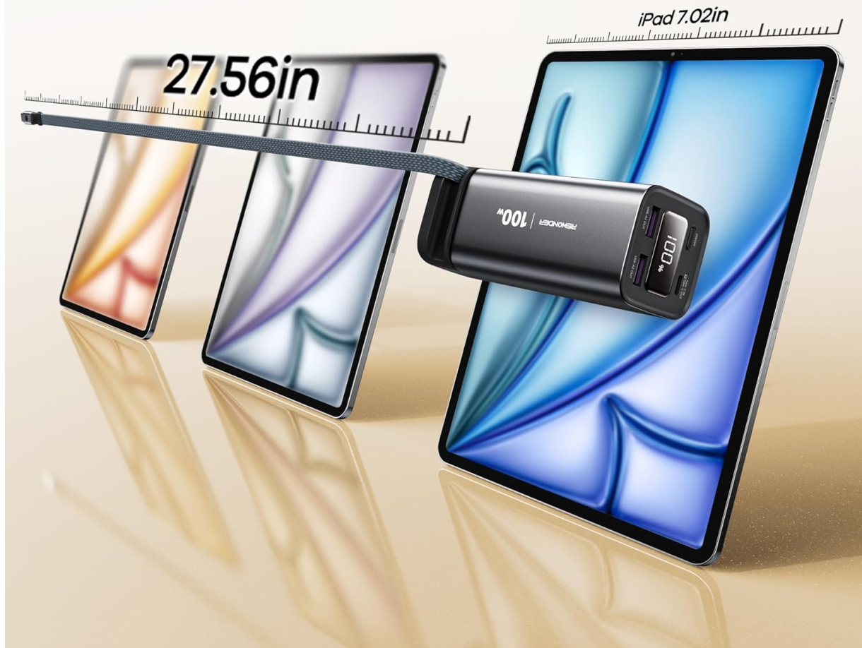
Image: The extended 27.56-inch retractable cable, long enough to comfortably reach devices even when the power bank is placed nearby.