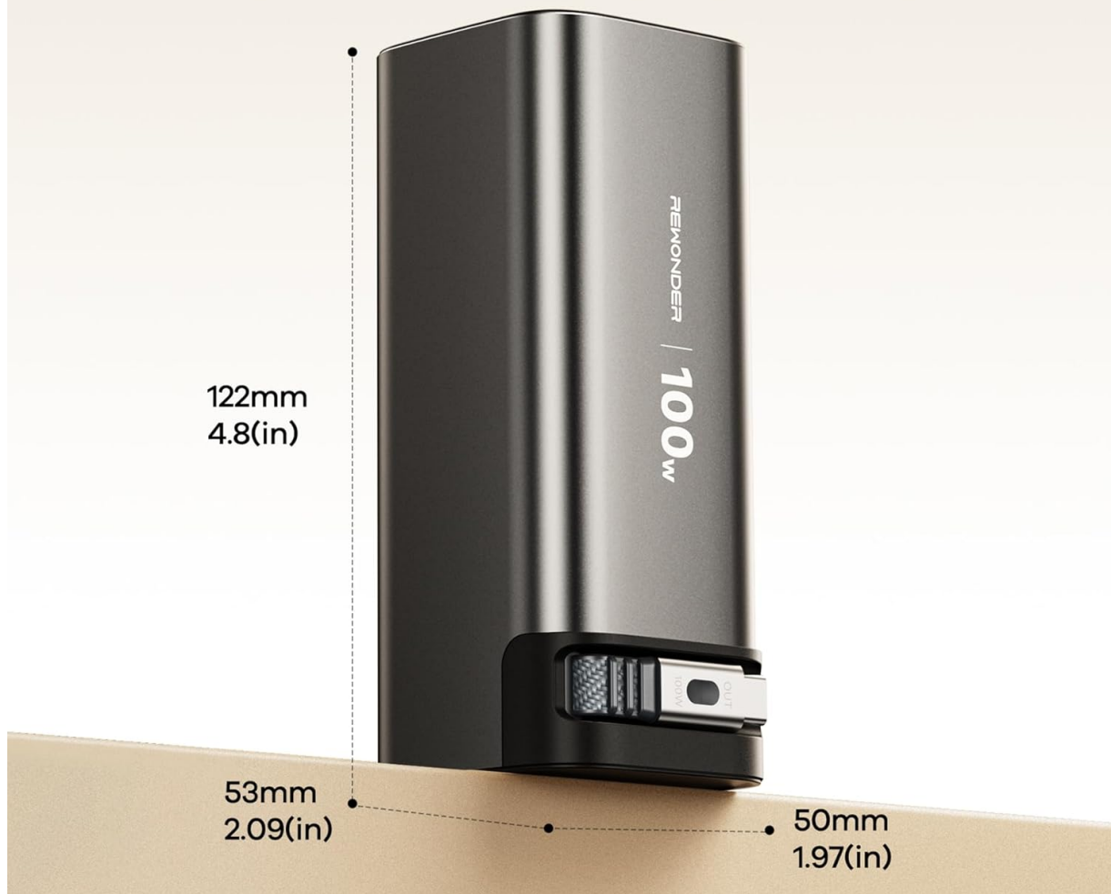
Image: An infographic illustrating the compact dimensions and weight of the power bank, making it easy to carry.