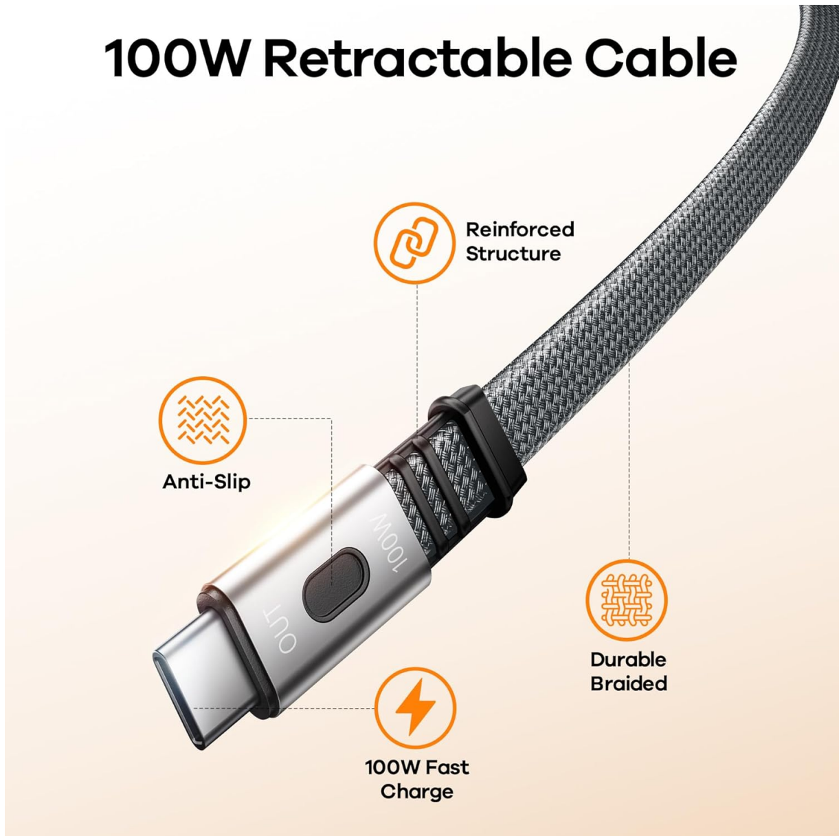
Image: A detailed view of the durable, braided retractable USB-C cable, emphasizing its robust construction designed for frequent use.