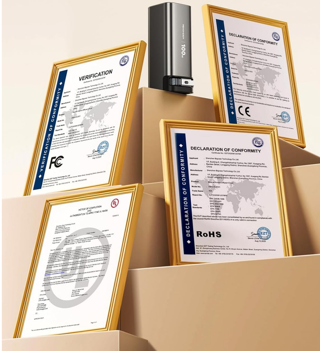
Image: The power bank is shown with its safety certifications, assuring users of its quality and adherence to international standards.