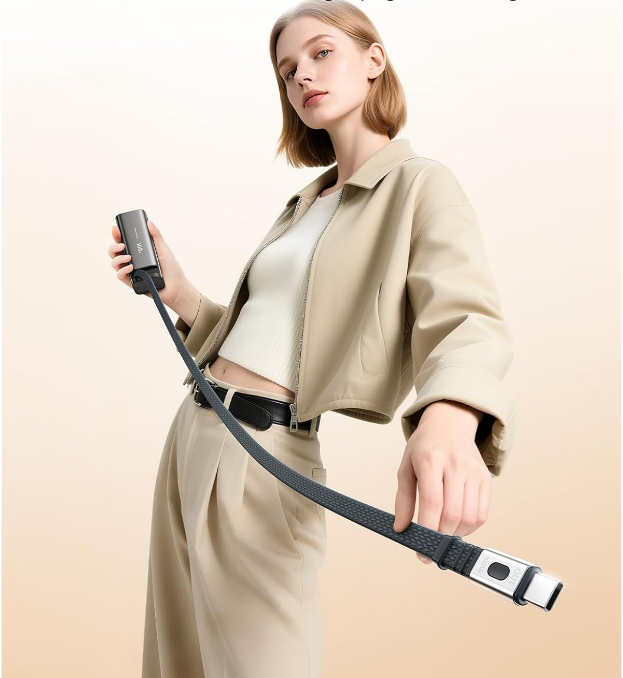
Image: A visual representation of the power bank's lab-tested durability, highlighting the robust design of its retractable cable.

35,000 Retract | 3,000 Plug Unplug | 10,000 Swing