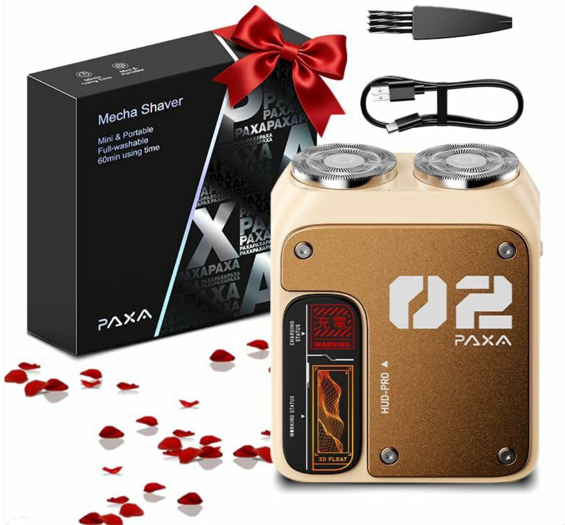
Image: The PAXA Mini Electric Shaver, showcasing its compact design.