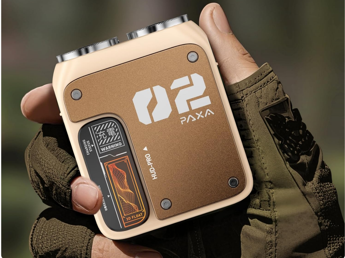
Image: The smart LED battery indicator displaying working, low battery, and fully charged states.