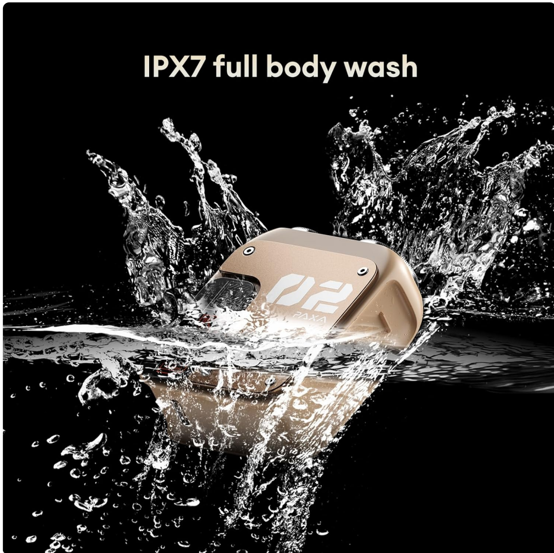
Image: The PAXA Mini Electric Shaver submerged in water, illustrating its IPX7 full-body wash capability for easy cleaning.

Your browser does not support the video tag.