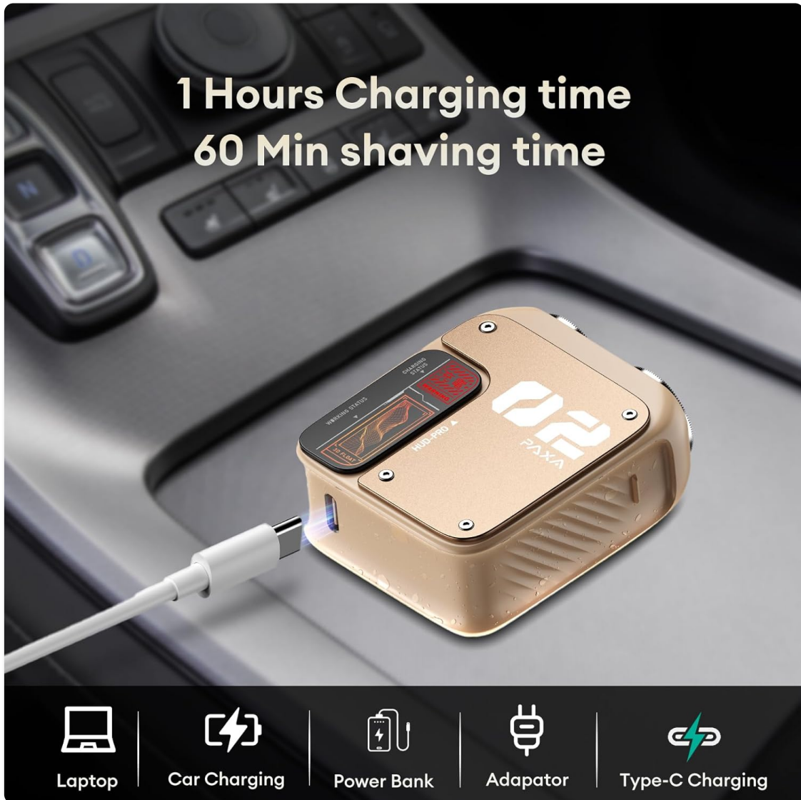
Image: The shaver connected to a USB-C cable for charging, illustrating various compatible power sources.