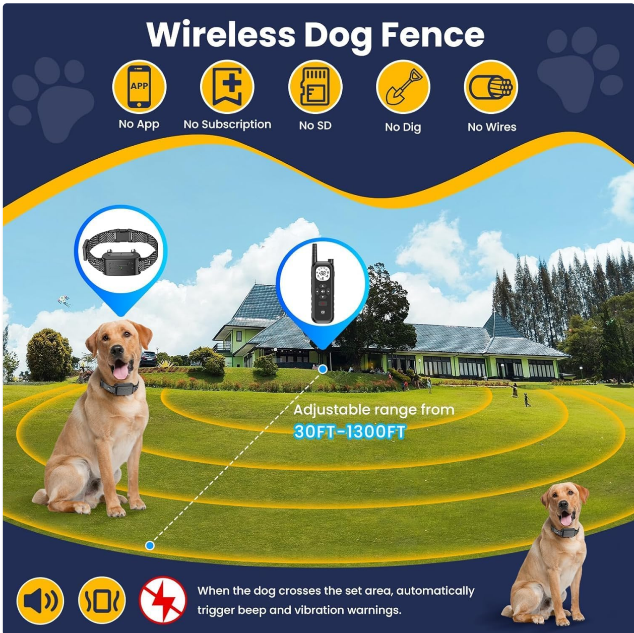
Image 4.1: Visual representation of the wireless fence boundary and adjustable range.