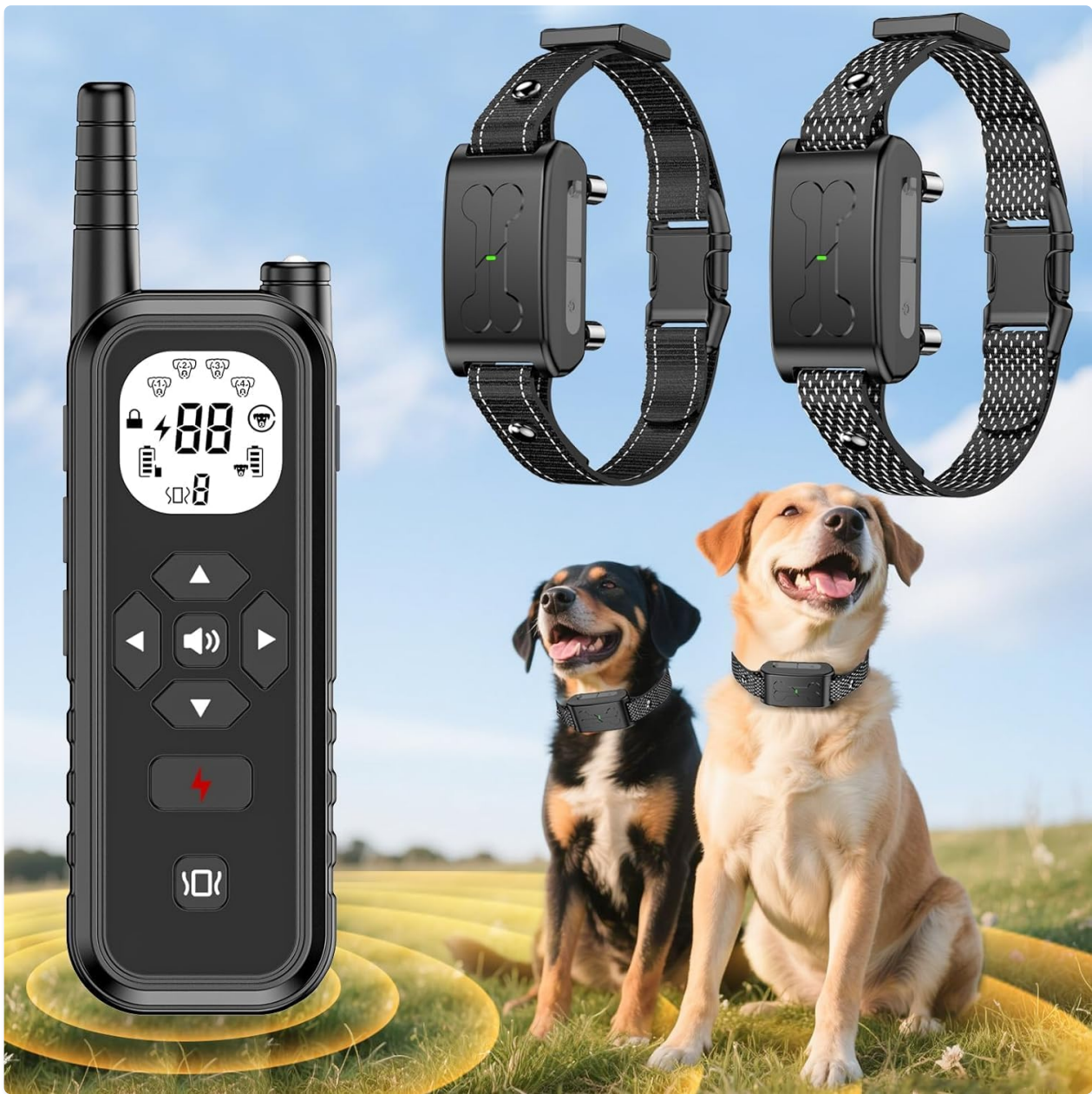
Image 1.1: Overview of the ALTOUMAN Wireless Dog Fence System, showing the remote control and two collars with dogs.