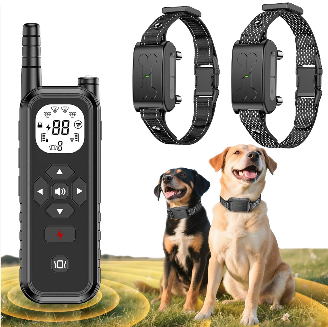
Image 3.3: Collar adjustability and suitability for different dog sizes.

Fit the collar snugly around your dog's neck. Ensure the contact points touch the dog's skin. The collar is adjustable up to 23.6 inches and suitable for dogs weighing 8-110 lbs.