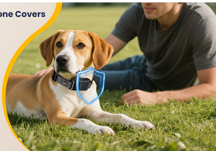
Image 8.2: Demonstrating the two safety anti-lost light modes of the remote.