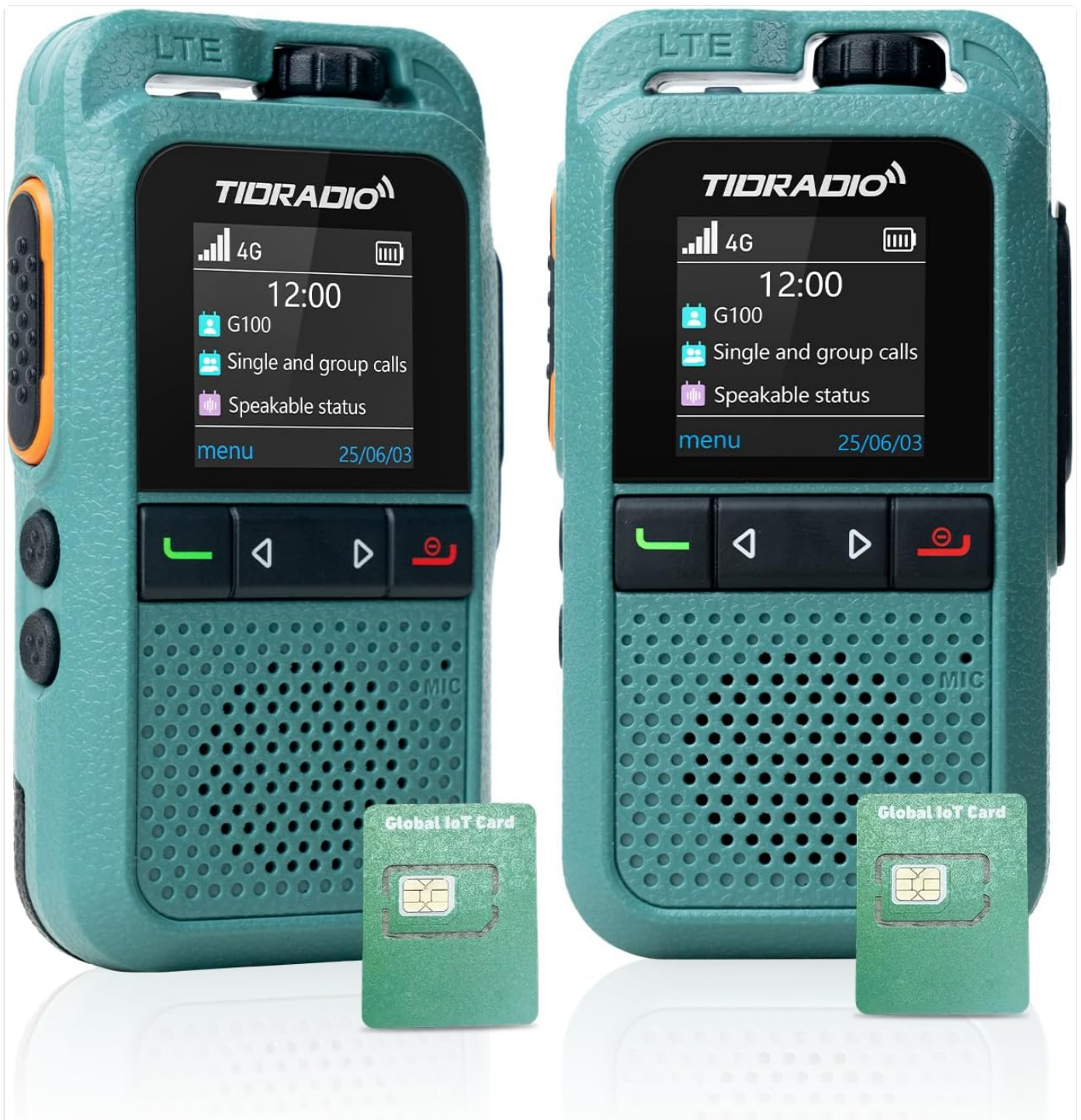
Image: Front view of the TIDRADIO TD-G100 walkie talkie, showcasing its compact design and display.