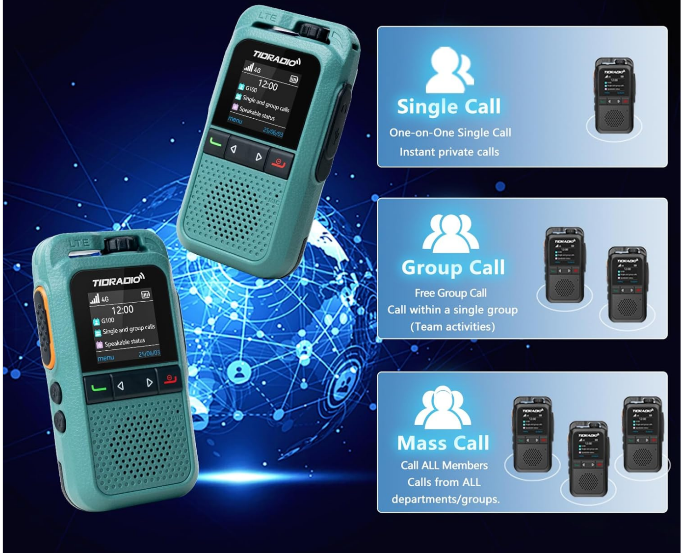
Image: Diagram illustrating the Single Call, Group Call, and Mass Call capabilities of the TD-G100.