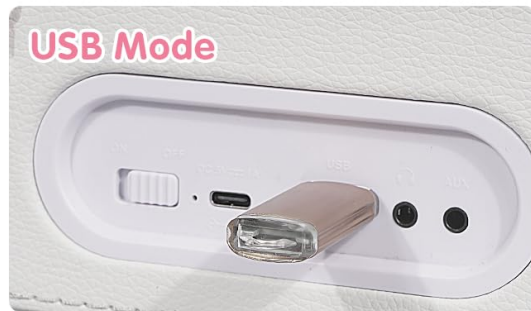
Read and play audio files from