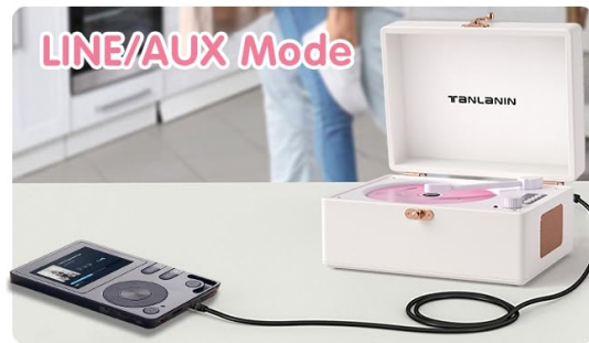
Supports audio input from