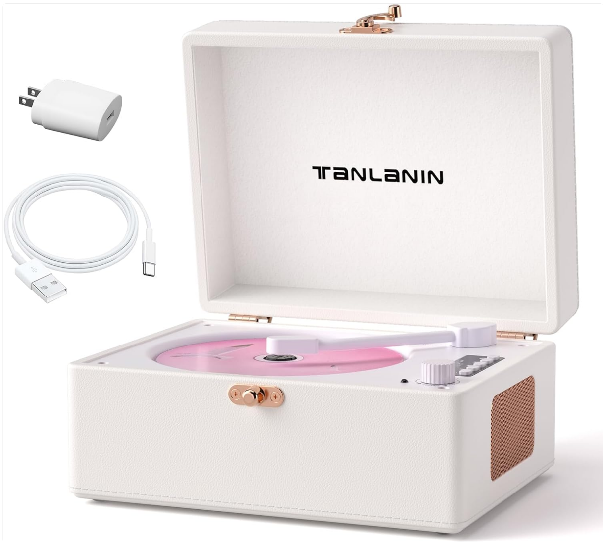
Figure 1: Front view of the TANLANIN Vintage Portable CD Player, showcasing its elegant white PU leather finish and rose gold hardware.