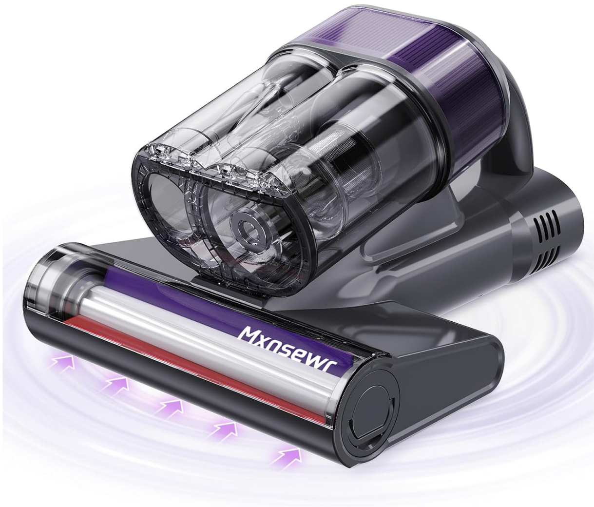
Image 3.1: Mxnsewr CY168 Mattress Vacuum Cleaner, showcasing its compact design and transparent dust collection system.