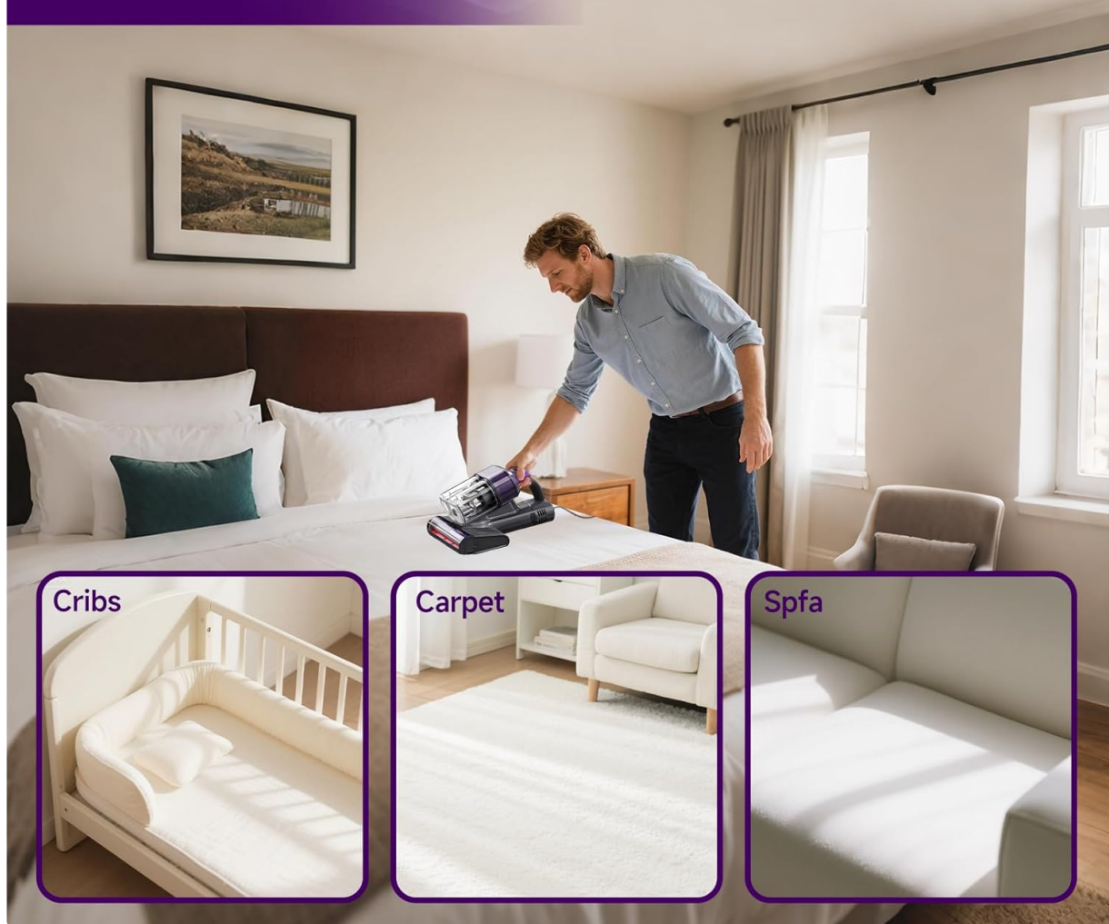
Image 5.3: The Mxnsewr CY168 being used for multi-function deep cleaning on various surfaces including beds, cribs, carpets, and sofas.