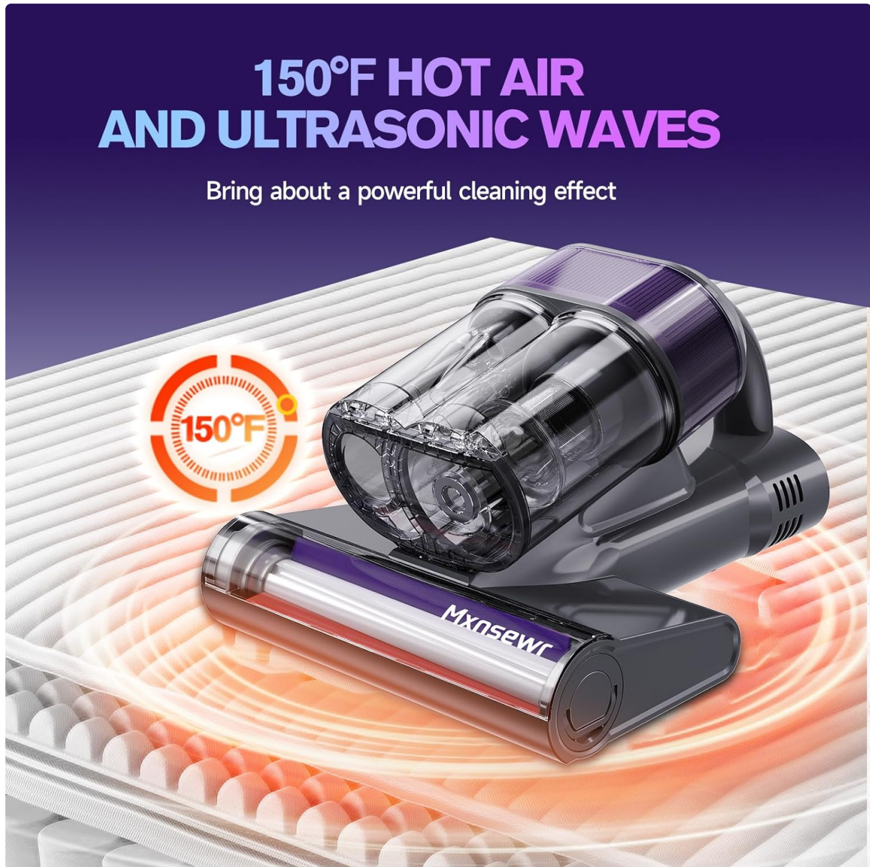
Image 5.2: Depiction of the 150°F hot air and ultrasonic waves working together for enhanced cleaning and drying.