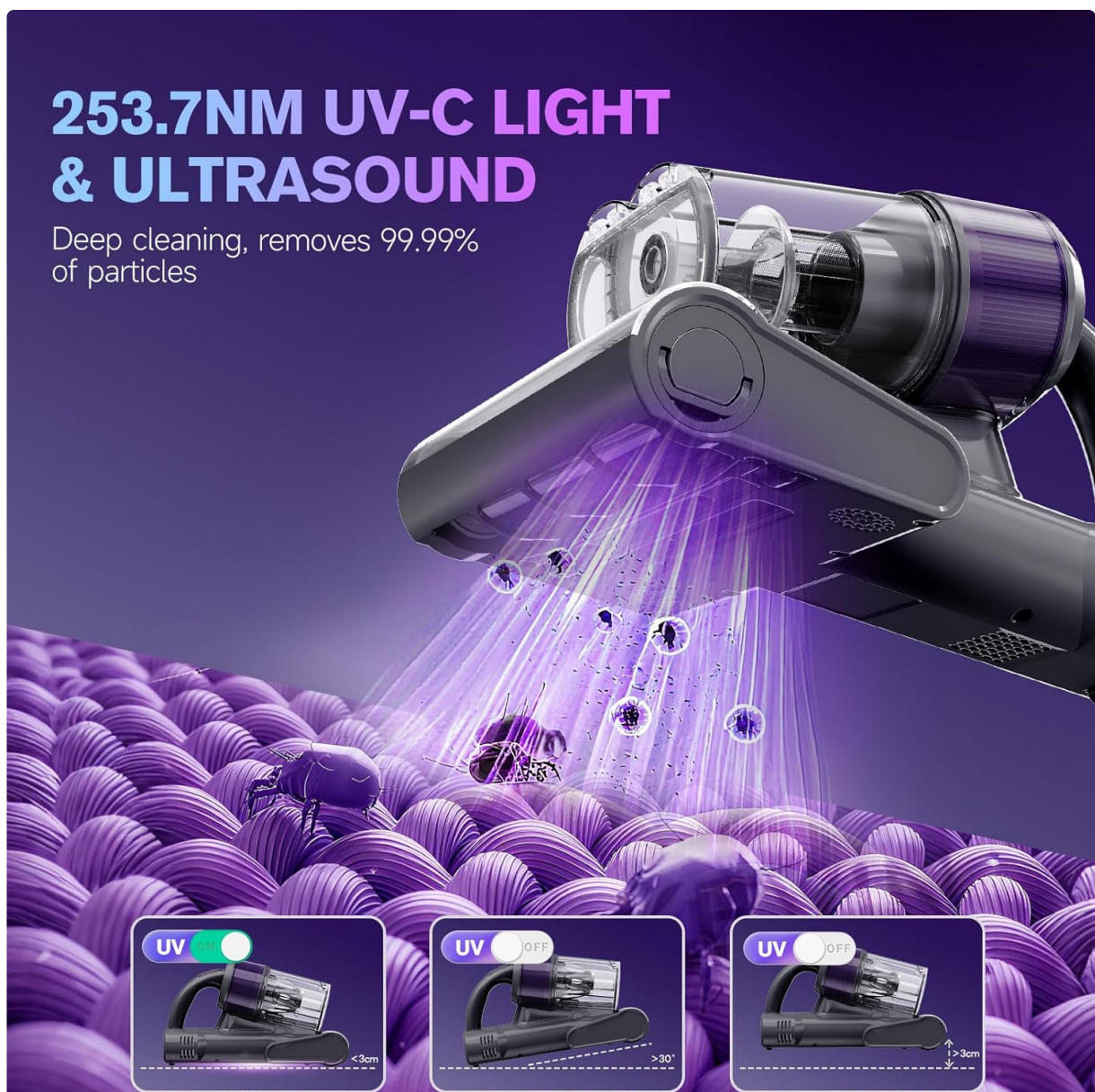
Image 5.1: Illustration of the 253.7nm UV-C light and ultrasonic technology in action, showing how the gravity sensor ensures safe operation by deactivating the UV-C light when lifted.