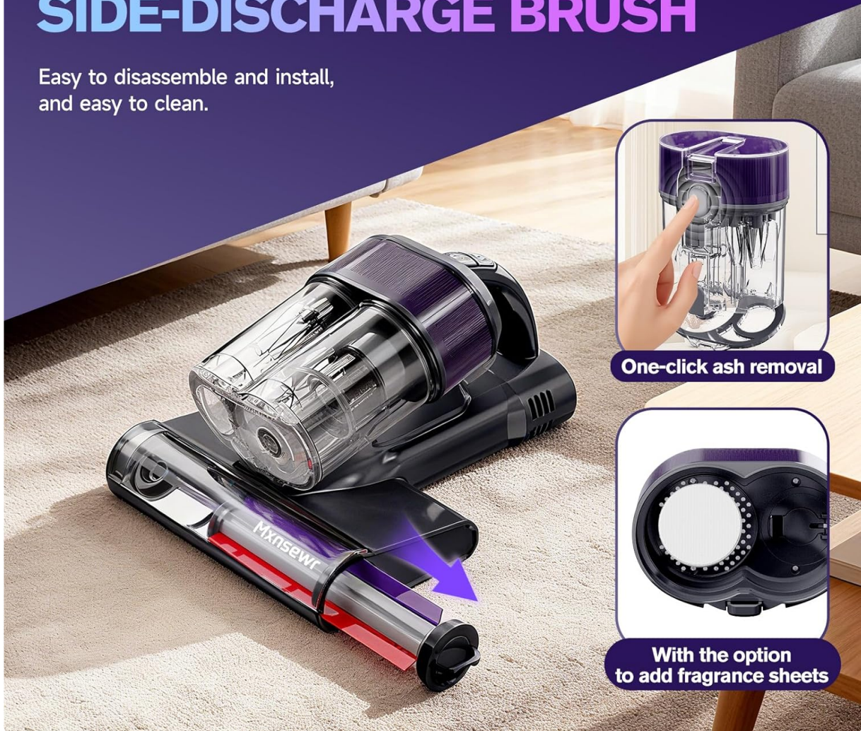
Image 6.1: Demonstrates the one-click ash removal feature and the option to add fragrance sheets to the unit.

Easy to disassemble and install, and easy to clean.