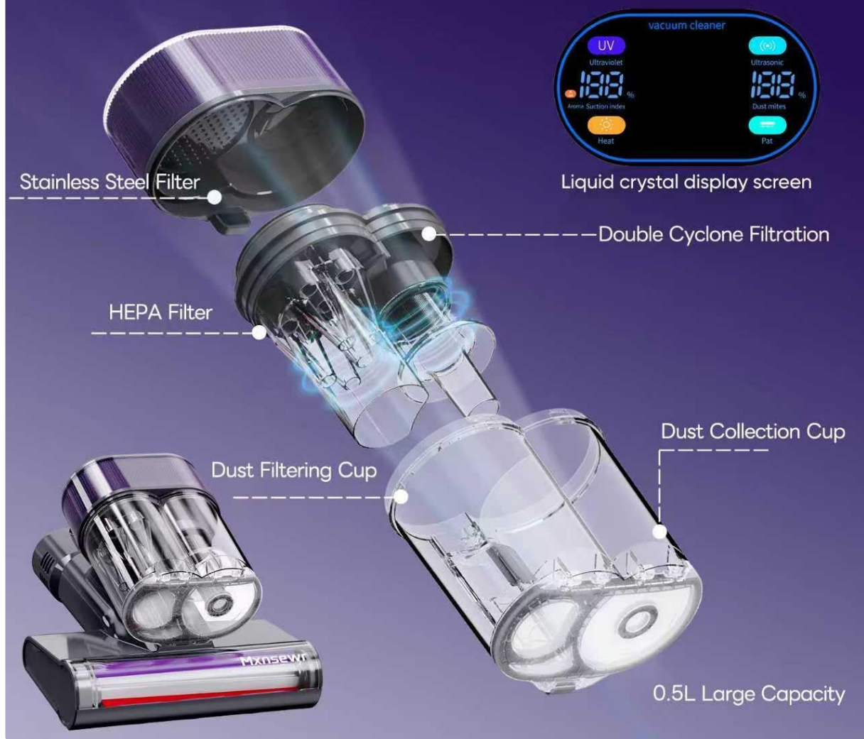
Image 6.2: Exploded view of the multi-layer filtration system, including the stainless steel filter, HEPA filter, double cyclone filtration, dust filtering cup, and 0.5L large dust collection cup.