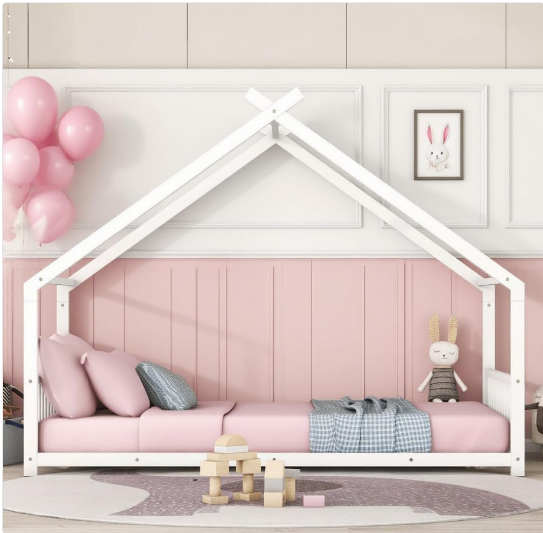
Image: The Bellemave Twin Size Floor Bed Frame with Roof, shown in a child's room with pink bedding and decor.