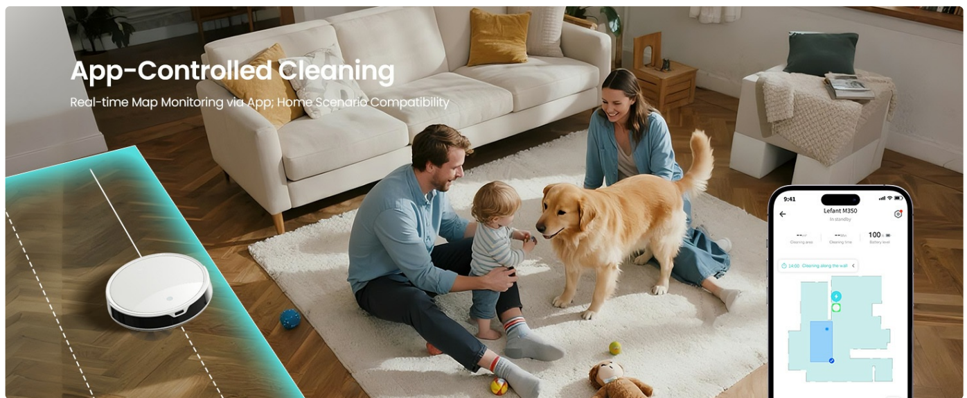
Image: A smartphone showing the Lefant app with options for suction adjustment and setting no-go zones on a floor plan.