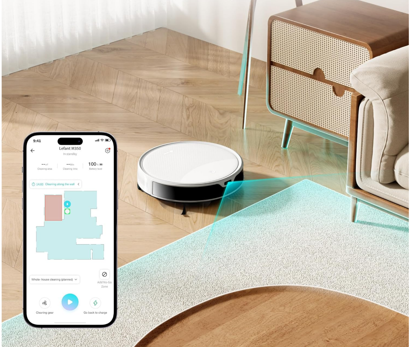
Image: The Lefant M350 robot vacuum positioned next to its self-emptying station.

Cleans in a precise grid, ensuring no spots are missed.