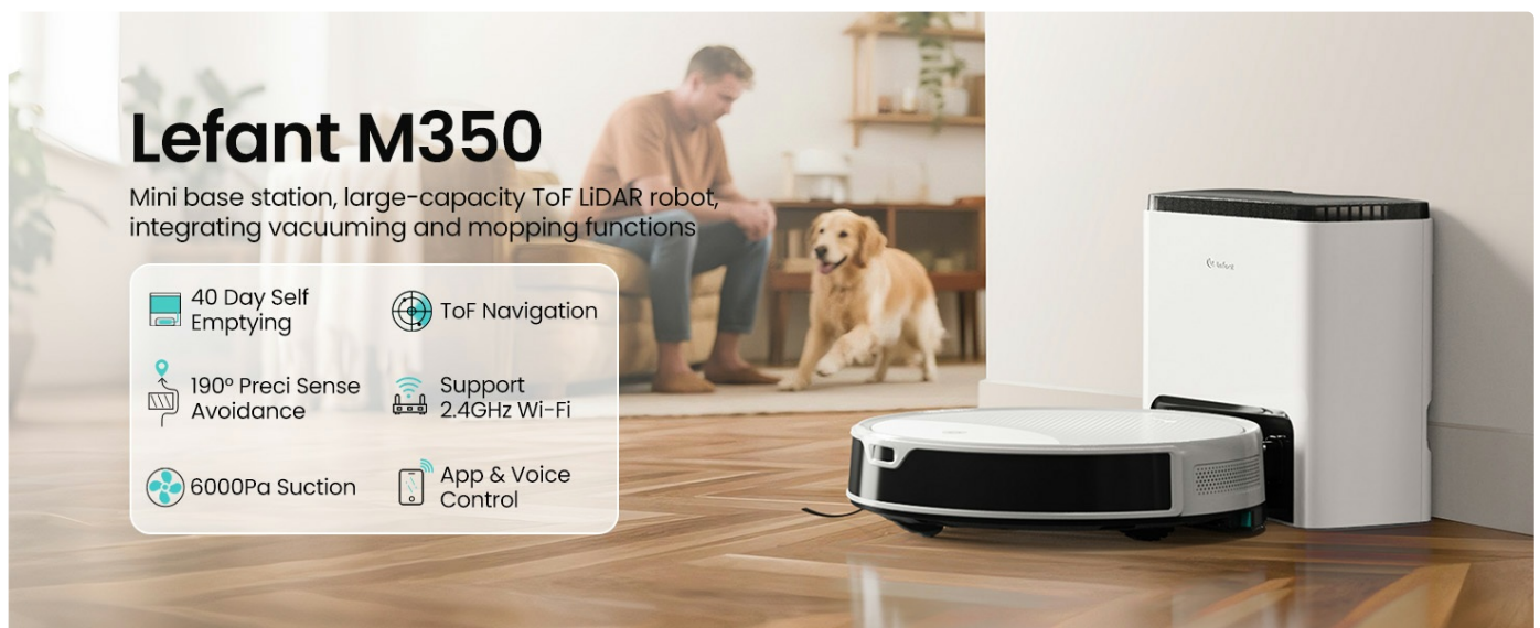
Image: The Lefant M350 robot vacuum docked at its self-emptying station, with an illustration showing dust being transferred into the 2.2L dust bag.

After each cleaning cycle, the robot automatically returns to the self-emptying station to transfer collected debris into the 2.2L dust bag. This provides up to 40 days of hands-free dust disposal.