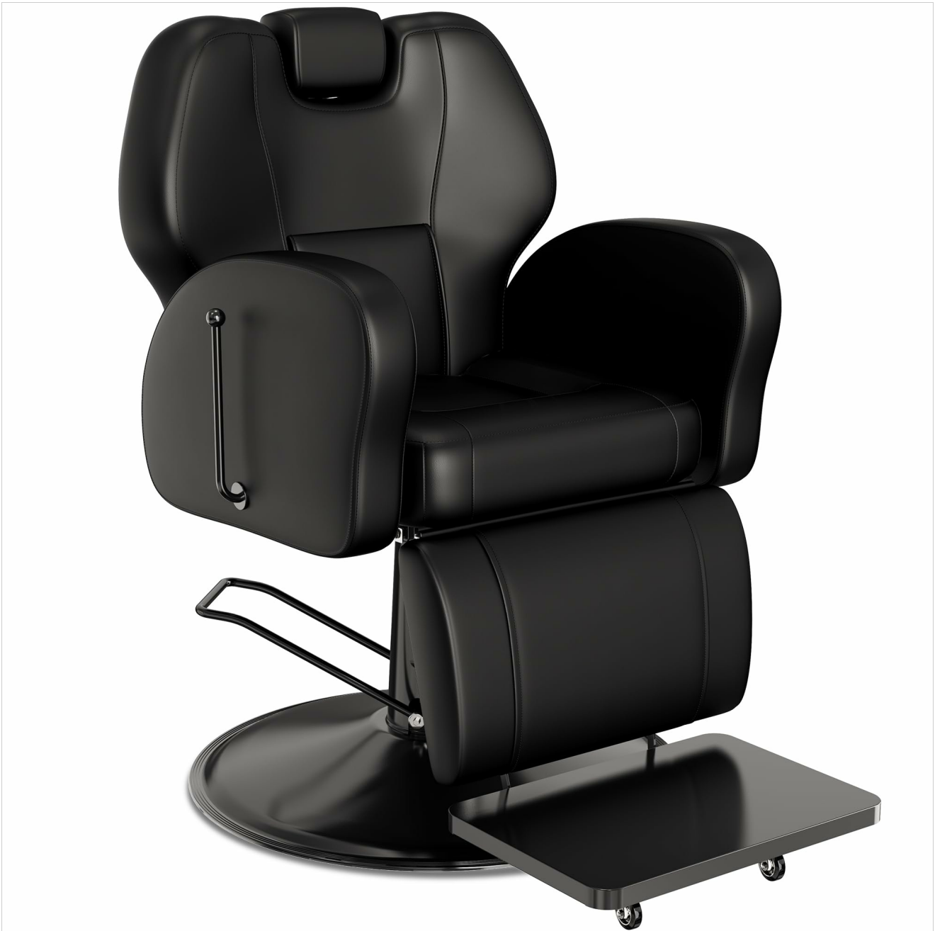
Image: Main components of the Baasha All-Black Reclining Salon Chair.

Important Note: The chair ships in two separate boxes. Ensure both packages have arrived before beginning assembly.