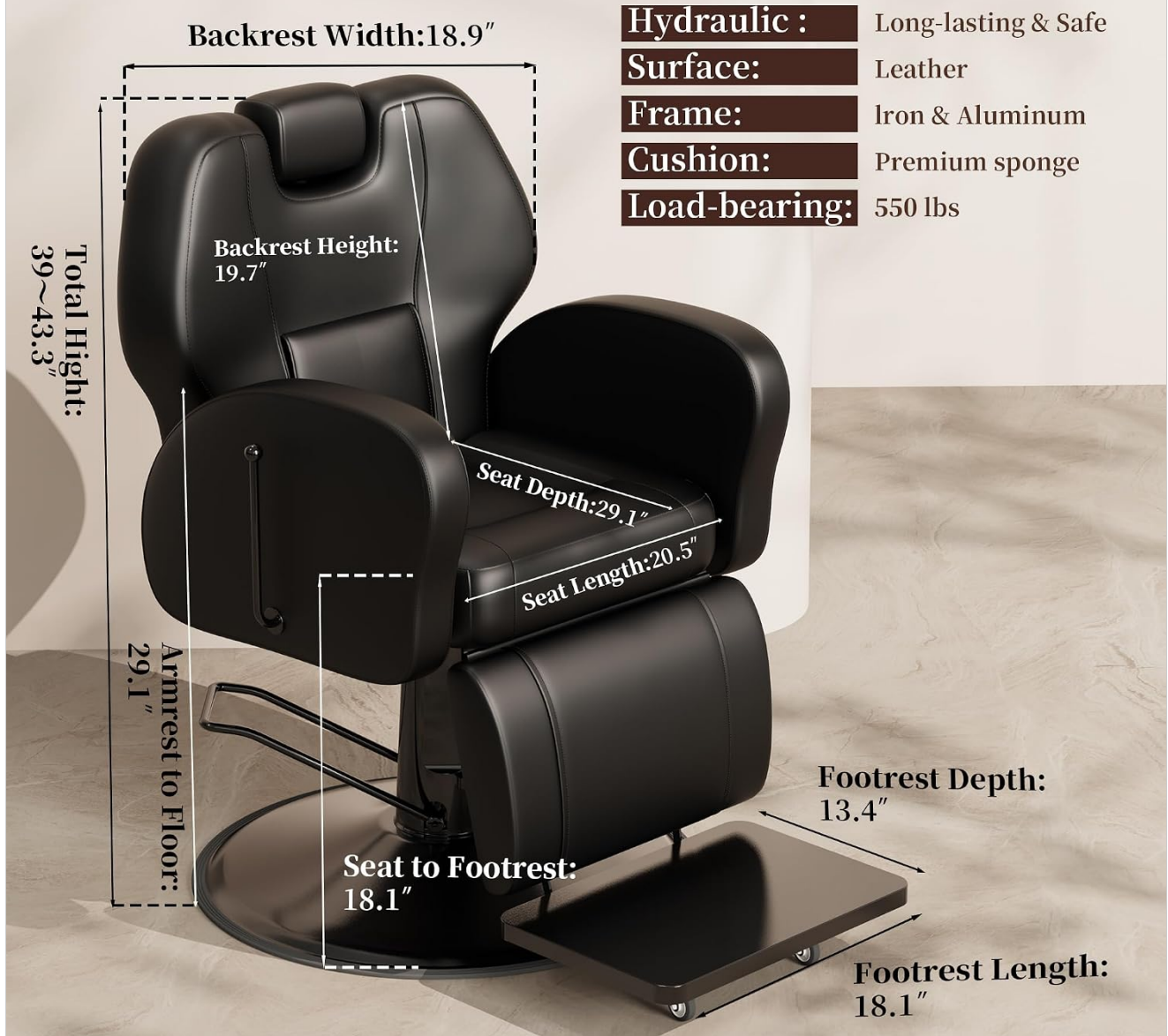
Image: Detailed product dimensions and material specifications.