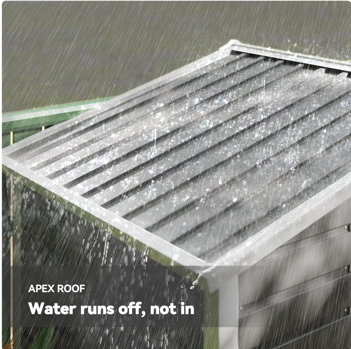
Image: Apex roof design ensuring efficient water runoff.

K46-7R) in the specified order. The first piece of tin at the top needs to extend beyond the wall by approximately 2.4 inches when installed. Secure with screws (F1, V2). Install K46-8 and K46-9 around the roof, and K46-10 at the highest part. Install corner pieces (GC) on the four corners of the roof.