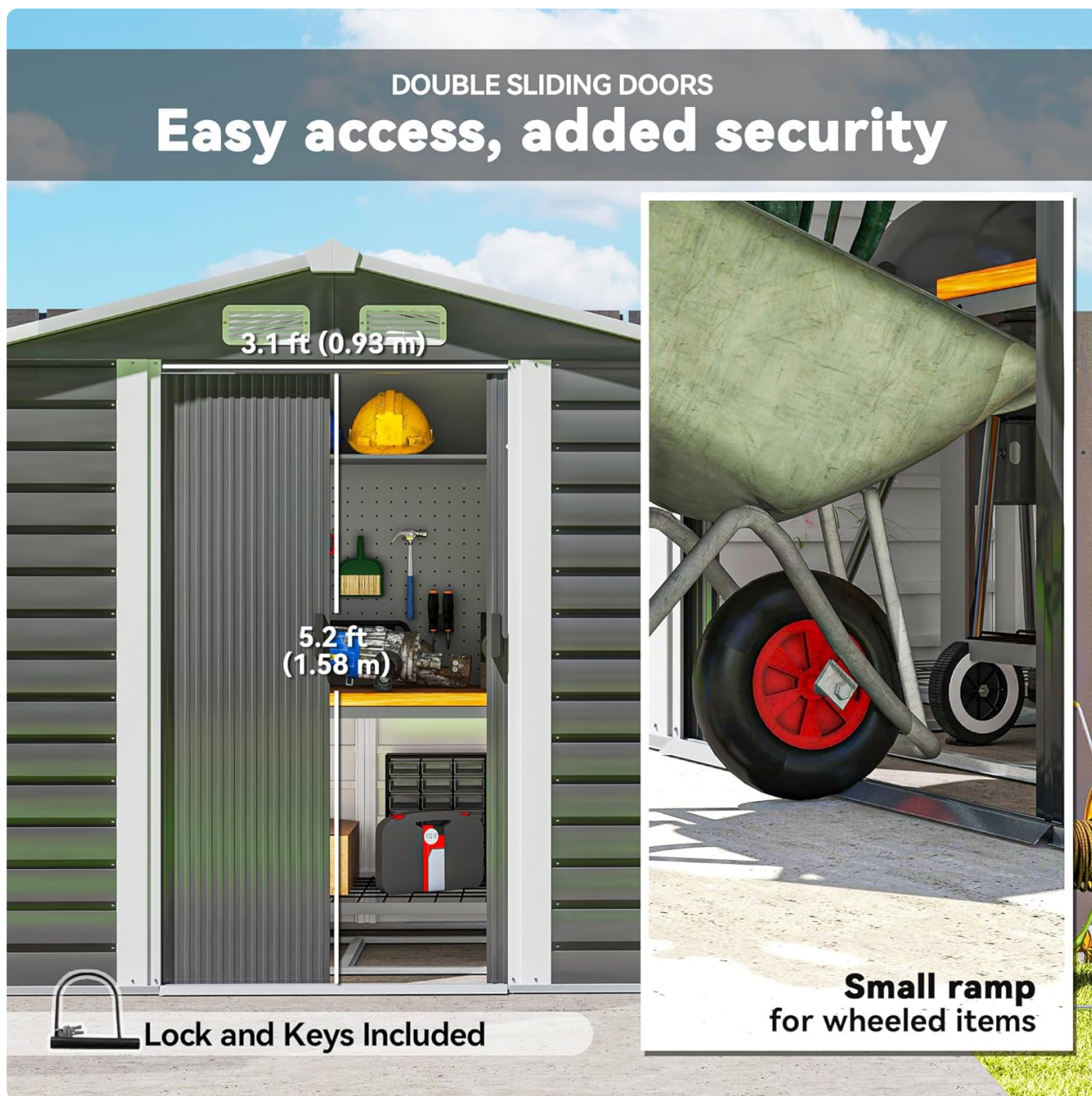
Image: Double sliding doors with lock and ramp for convenient access.