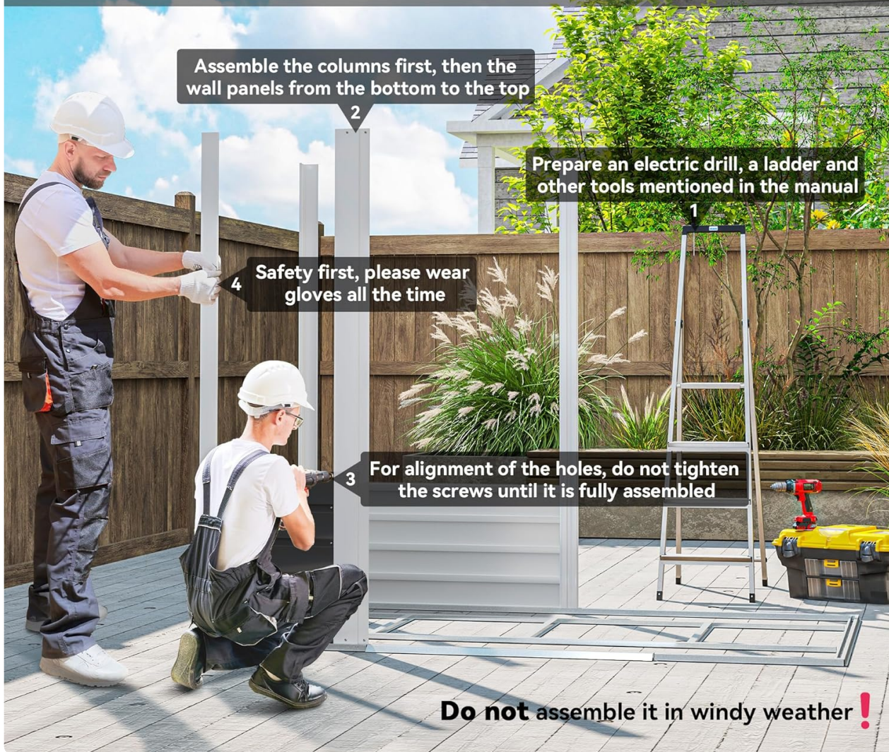
Image: Initial assembly steps highlighting safety precautions and tool requirements.