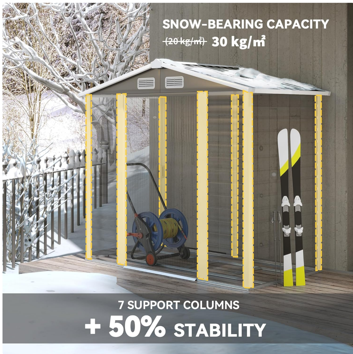
Image: Shed's snow-bearing capacity and structural support.