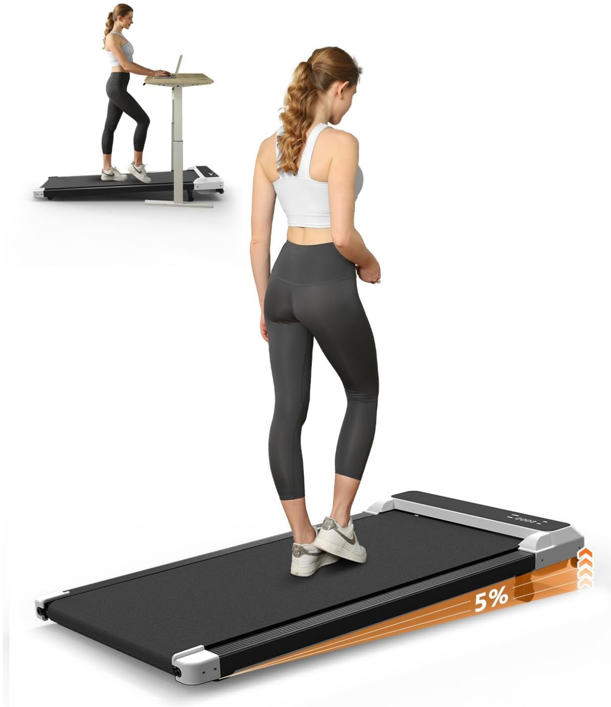
Image 2.1: The Ueadcm C7W-1 Walking Pad in operation, demonstrating its compact design and suitability for active use.

The Ueadcm C7W-1 is a versatile 3-in-1 walking pad designed for home and office use, offering a compact solution for daily exercise. It features a manual incline, a quiet motor, and an LED display for tracking workout metrics.