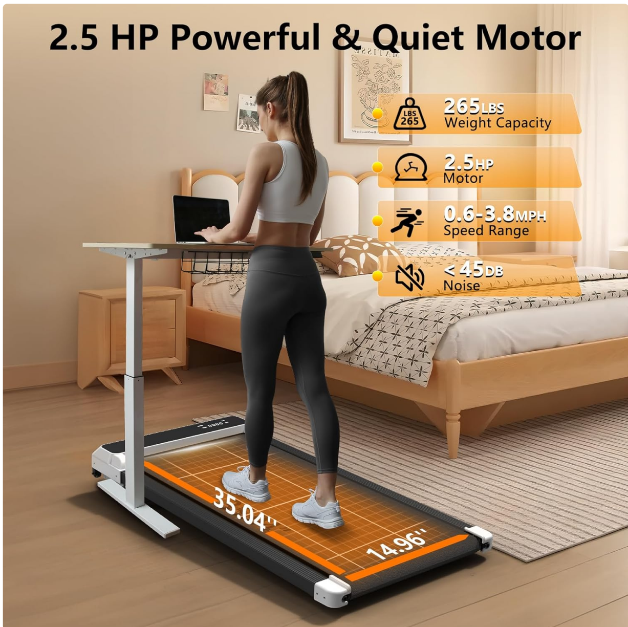
Image 4.1: The walking pad supports various activities, from active walking to use with a standing desk.