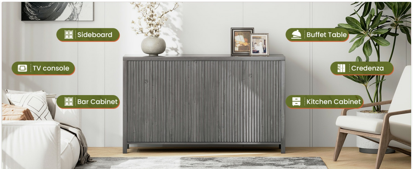
Image: Visual representation of the cabinet's multi-functional design, showcasing its suitability as a sideboard, TV console, buffet table, credenza, bar cabinet, or kitchen cabinet.