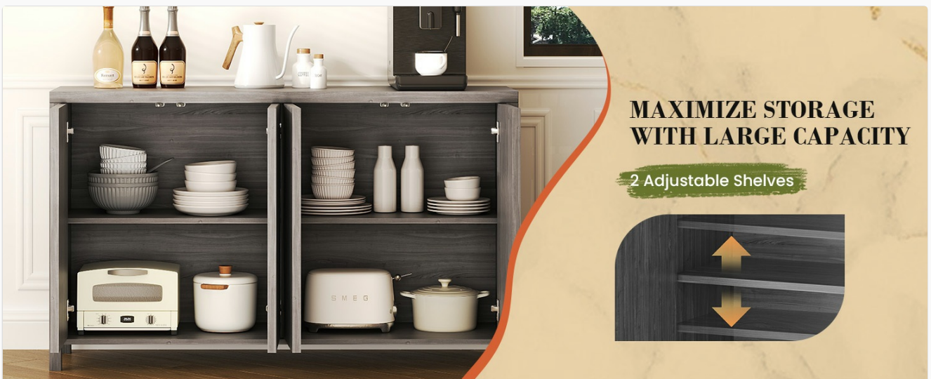
Image: Interior view demonstrating the large storage capacity with two adjustable shelves. The shelves are shown holding various kitchen items, highlighting their versatility.

Image: Product dimensions and internal storage details. The overall cabinet measures 55.5" W x 15.4" D x 32.8" H. The tabletop has a maximum load of 350 lbs, and each adjustable shelf supports up to 50 lbs.