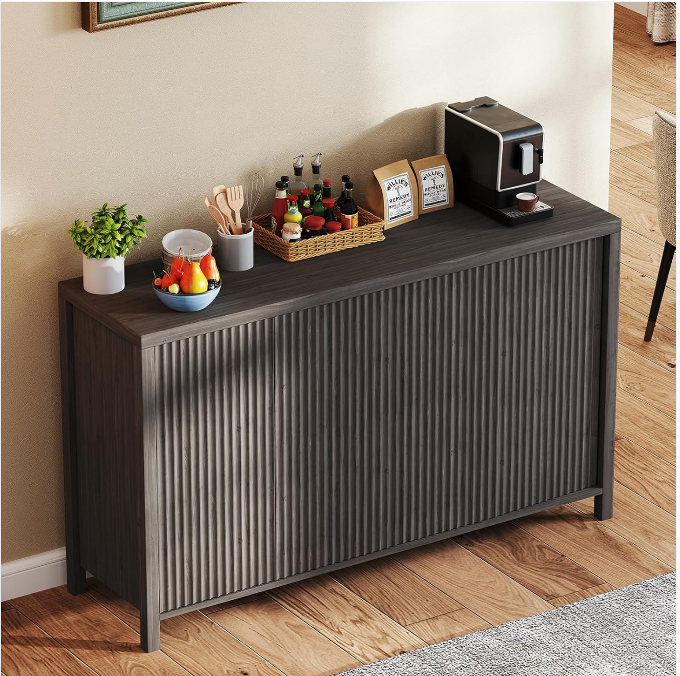
Image: Detailed view of the adjustable shelves and door mechanisms. The shelves can be positioned at various heights, and the doors feature a push-to-open design with handcrafted fluted panels.