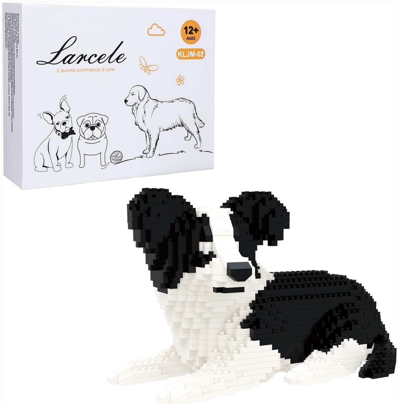
Image 1: The Larcele Micro Building Blocks Set packaging and the completed Border Collie 2 model.