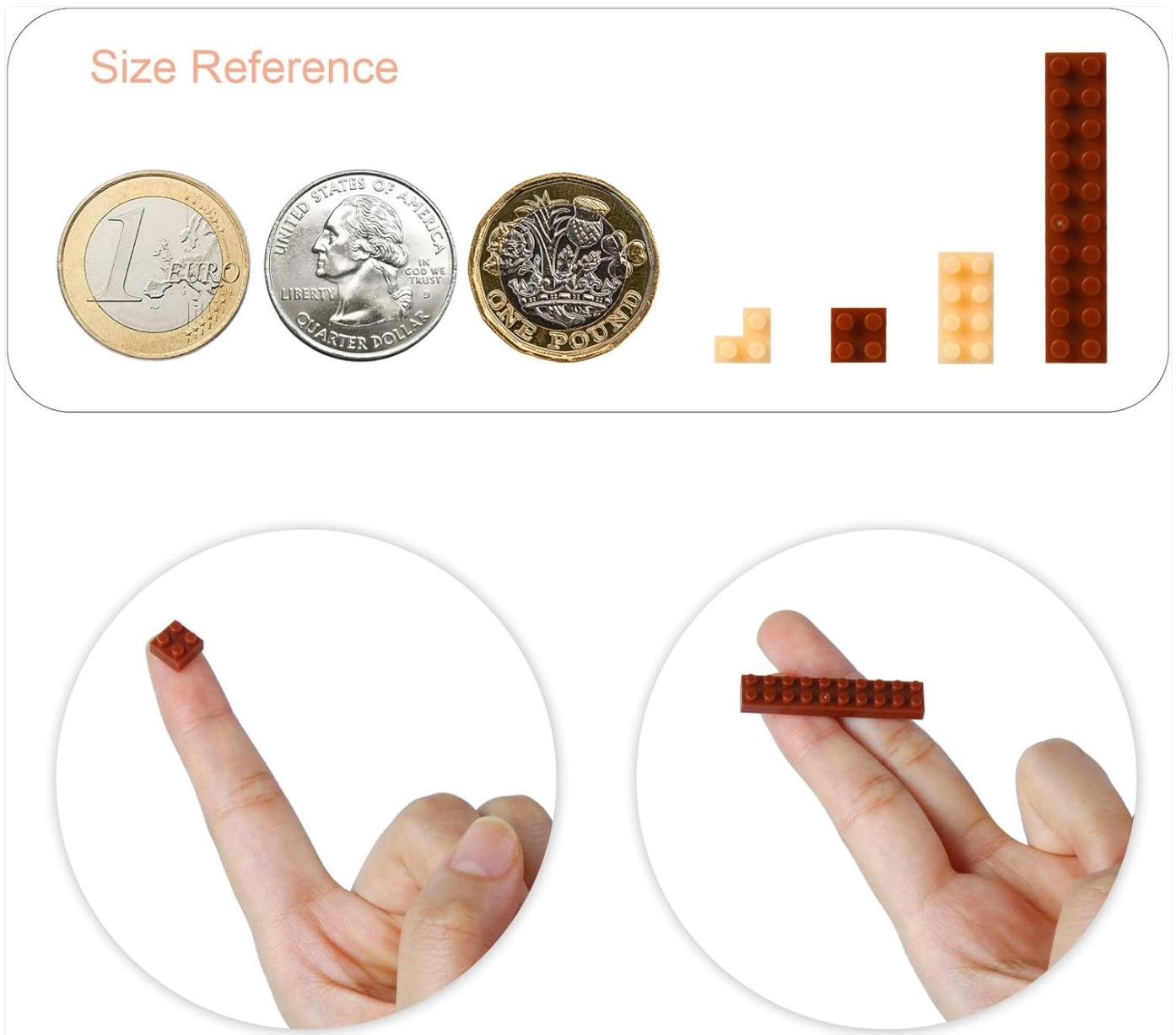
Image 3: A visual reference demonstrating the small scale of the micro building blocks.