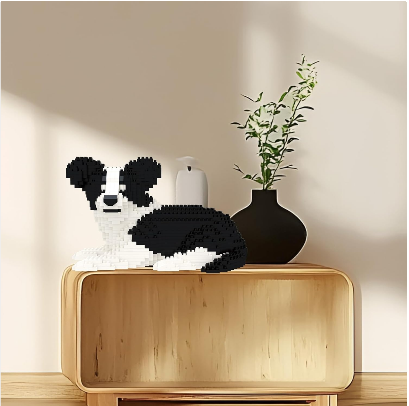
Image 5: The Border Collie 2 model displayed as a decorative item on a cabinet.