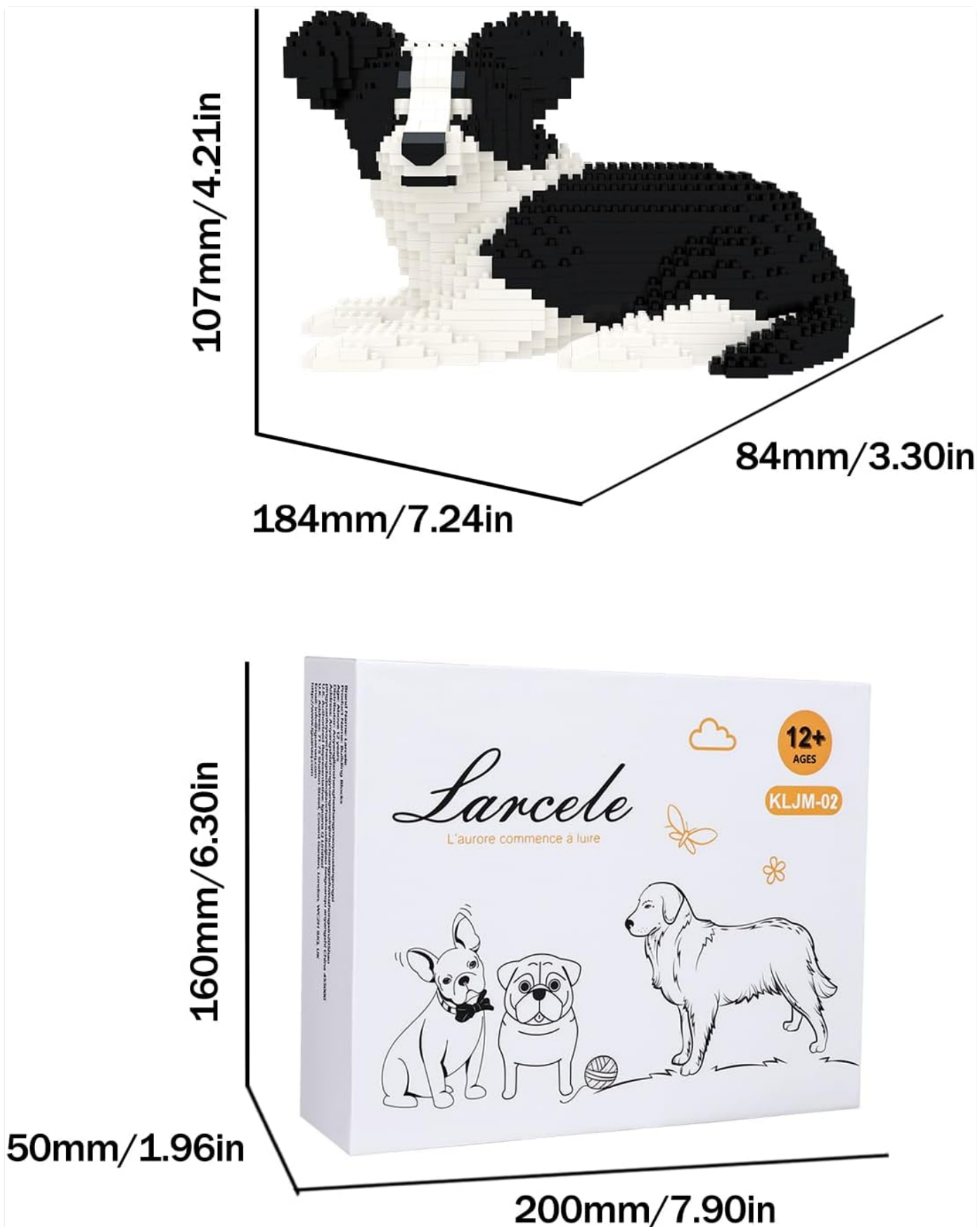
Image 6: Detailed dimensions of the assembled model and the product box.