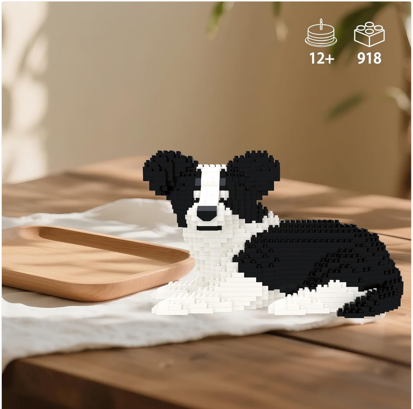
Image 2: The assembled Border Collie 2 model, demonstrating the intricate detail achieved with micro blocks.