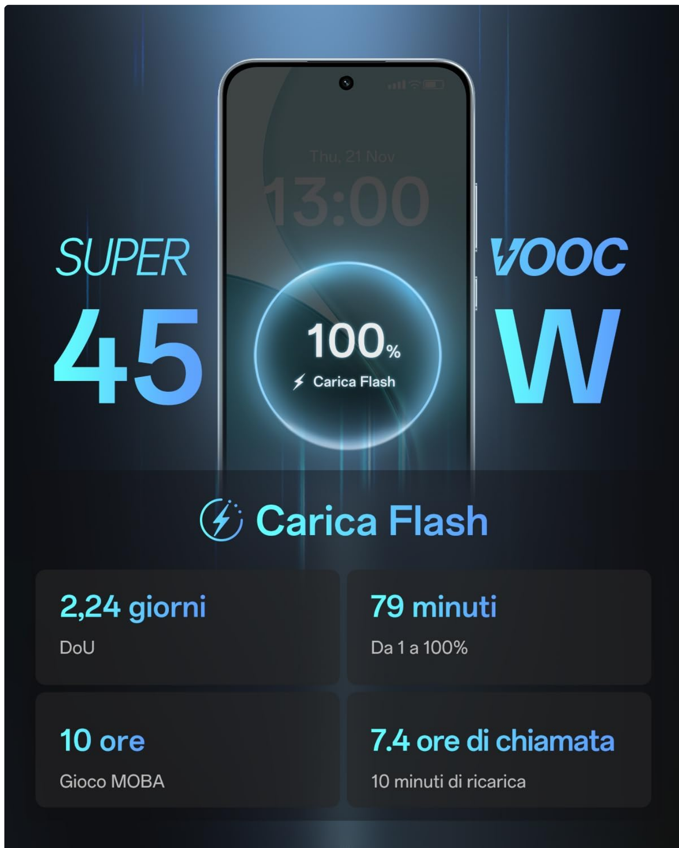
Image: The OPPO Reno14 F 5G display showing 100% charge with the SUPERVOOC 45W fast charging indicator. This highlights the device's rapid charging capability, achieving a full charge in approximately 79 minutes.