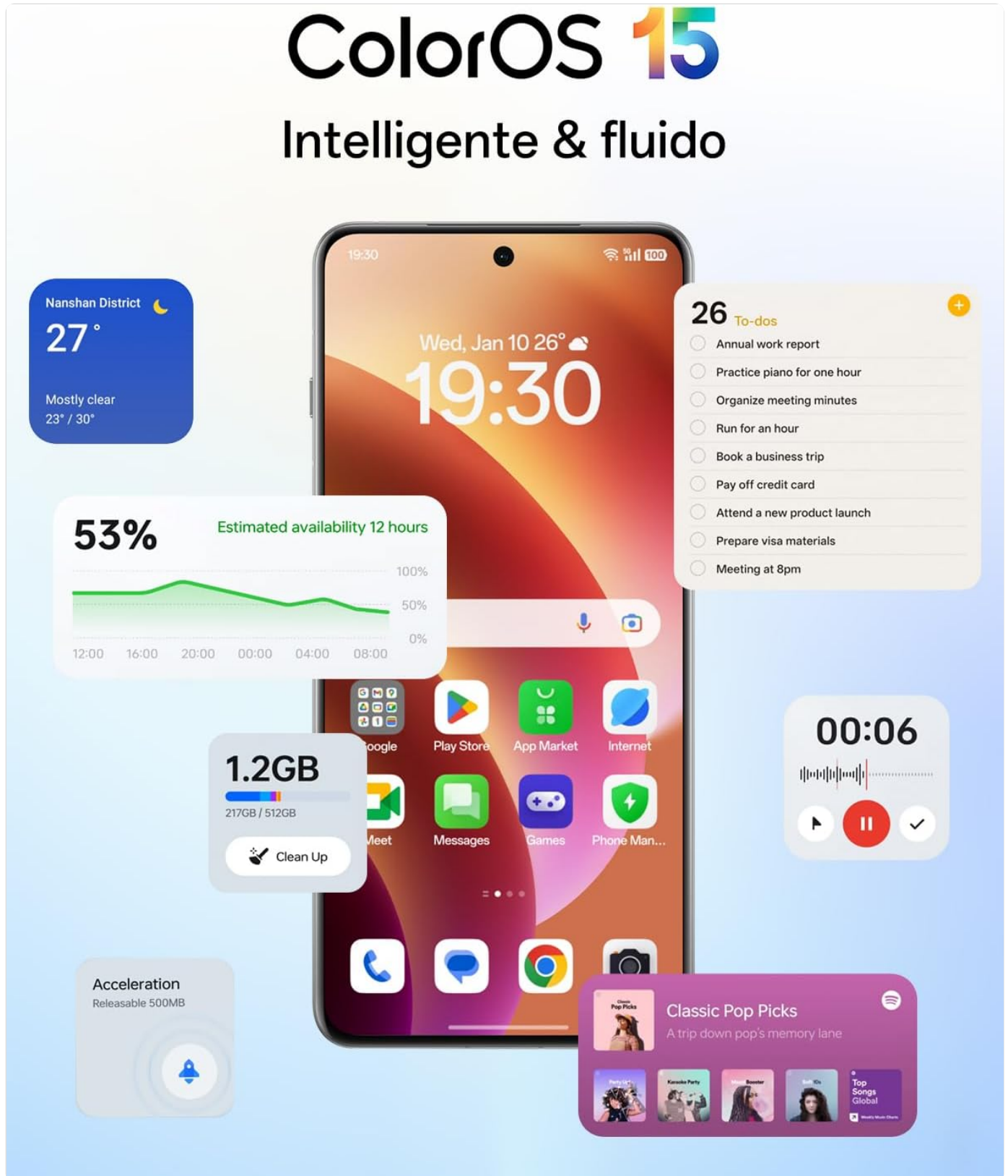
Image: A screenshot of the ColorOS 15 interface on the OPPO Reno14 F 5G, showcasing various widgets and app icons. This image demonstrates the intelligent