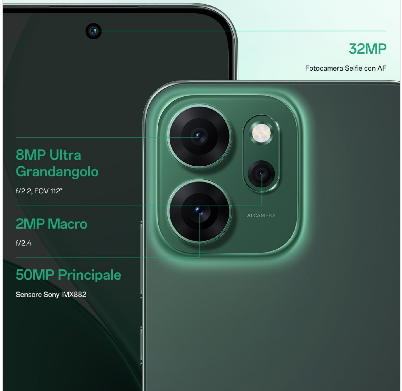
Image: A detailed view of the OPPO Reno14 F 5G's camera module, illustrating the 50MP main sensor, 8MP ultra-wide, 2MP macro, and the 32MP selfie camera. This graphic highlights the AI Portrait Expert capabilities.