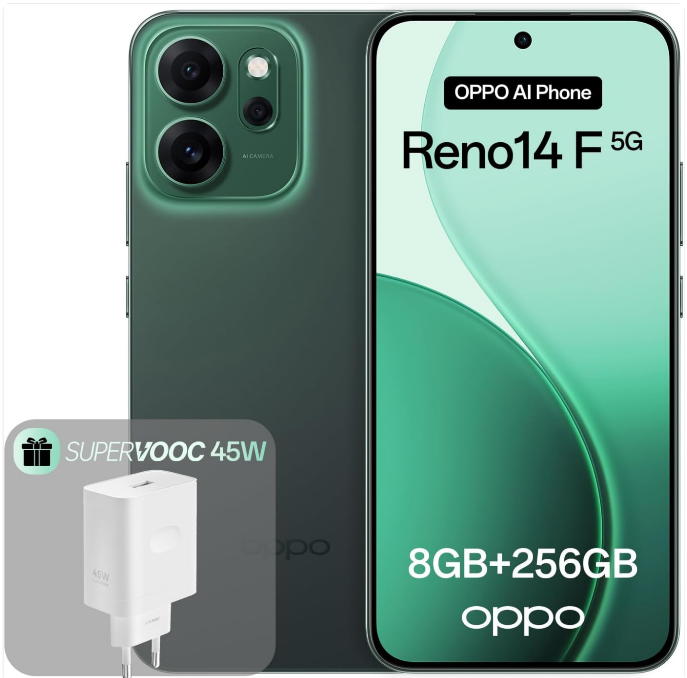
Image: The OPPO Reno14 F 5G smartphone in Luminous Green, accompanied by its 45W SUPERVOOC charger. This image illustrates the primary device and a key accessory included in the package.