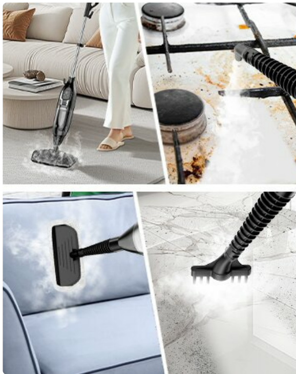
Image: Handheld steamer in action with specialized attachments.