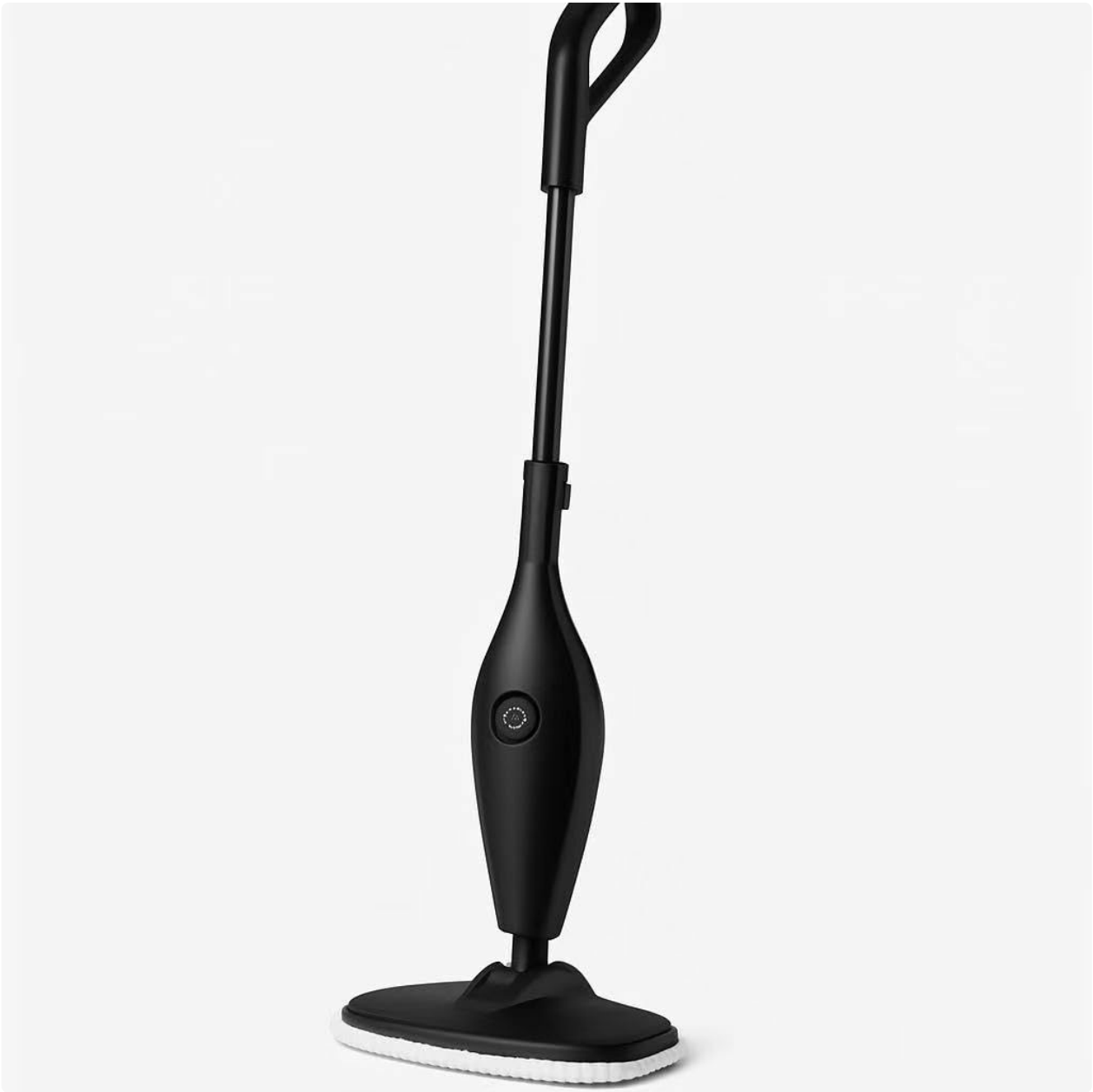
Image: Leiksen 12-in-1 Powerful Steam Mop in its upright configuration.