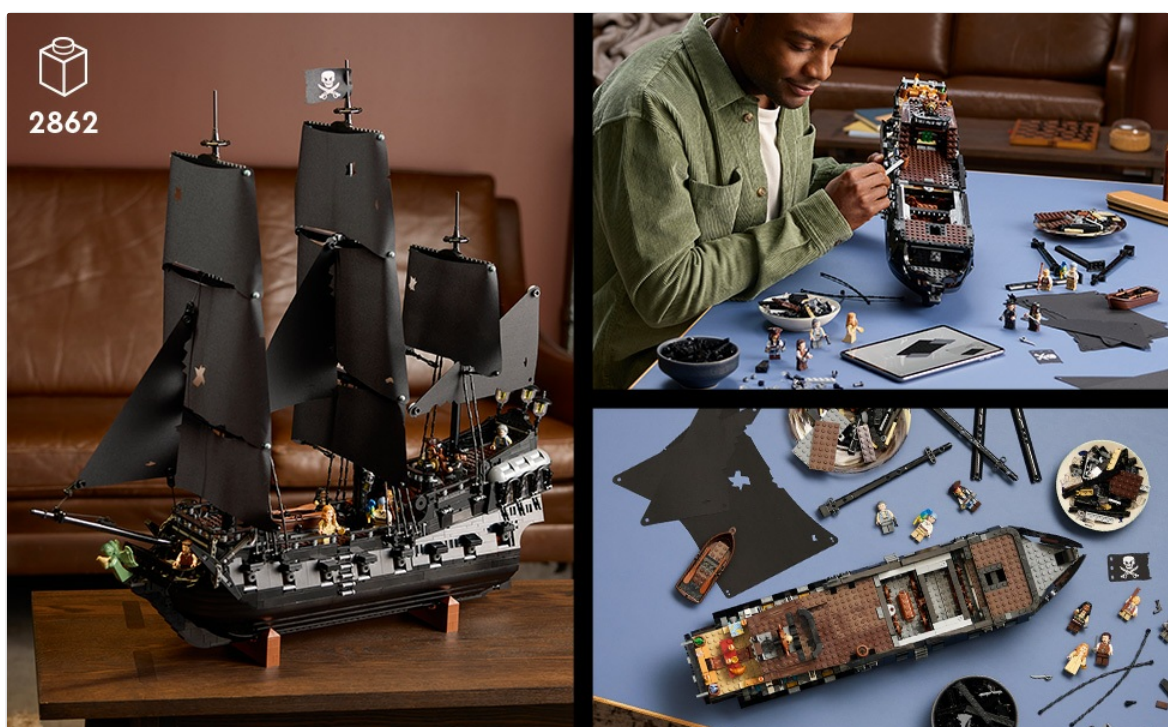
Image: An adult builder carefully assembling sections of the LEGO Black Pearl ship, demonstrating the detailed

Image: The product box for the LEGO Icons Captain Jack Sparrow's Pirate Ship, highlighting the 2,862 piece count and its adult builder focus.