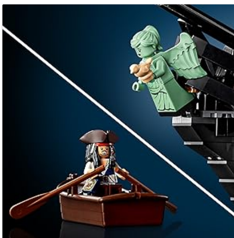
Image: The detachable rowboat, capable of holding minifigures, and the green figurehead that attaches to the bow of the ship.