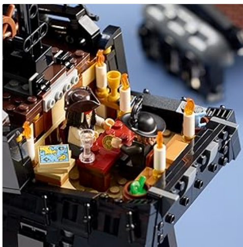
Image: The detailed interior of the captain's quarters, accessible by lifting the deck, featuring miniature furnishings and accessories.