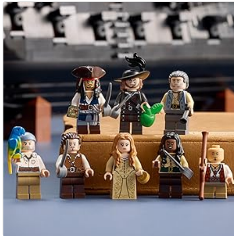
Image: A close-up of the eight included LEGO minifigures: Jack Sparrow, Will Turner, Gibbs, Cotton, Anamaria, Marty, Elizabeth Swann, and Hector Barbossa.