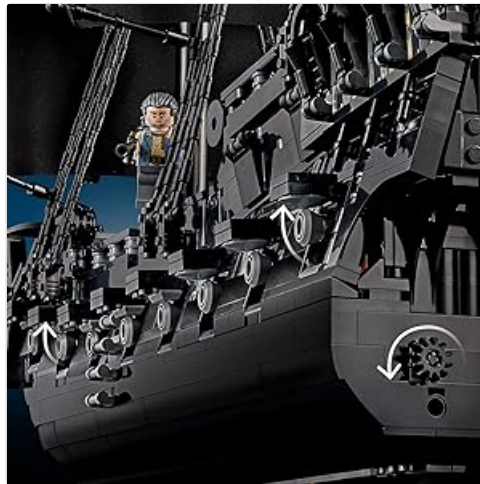
Image: A detailed view of the ship's hull, showing the dials that can be rotated to deploy the cannons from either side.