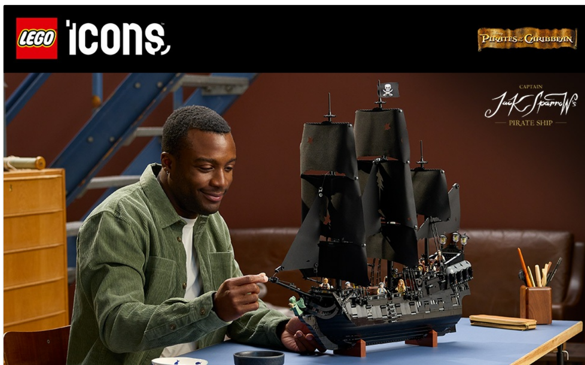
Image: The fully assembled LEGO Icons Captain Jack Sparrow's Pirate Ship (10365) building set, showcasing its

The model includes 8 iconic movie character minifigures: Jack Sparrow, Will Turner, Gibbs, Cotton, Anamaria, Marty, Elizabeth Swann, and Hector Barbossa. A figurehead minifigure can be mounted on the bow for added detail.