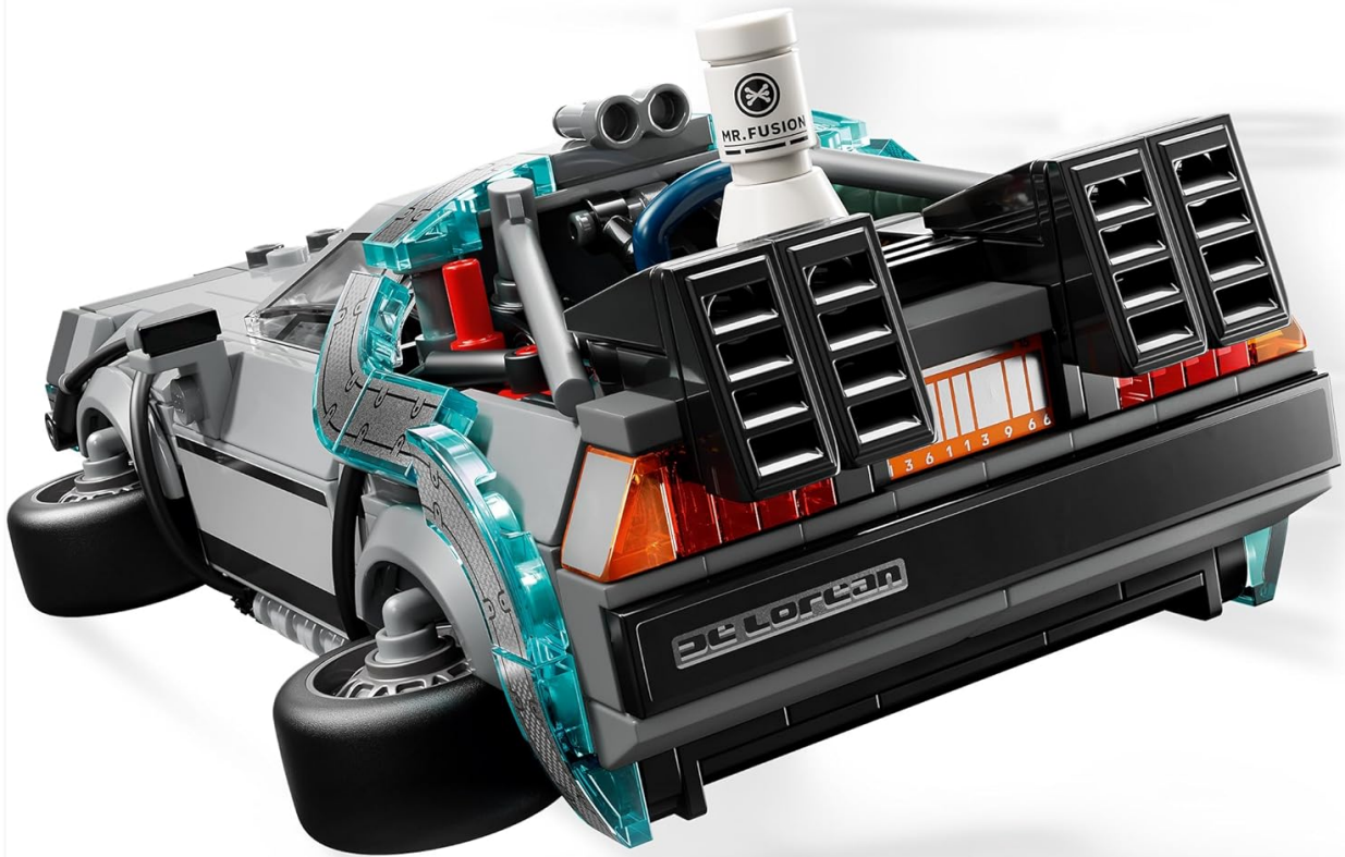
Image: The DeLorean Time Machine in its flying mode.

For assistance with assembly, refer to the LEGO Builder app, which offers interactive 3D building instructions.