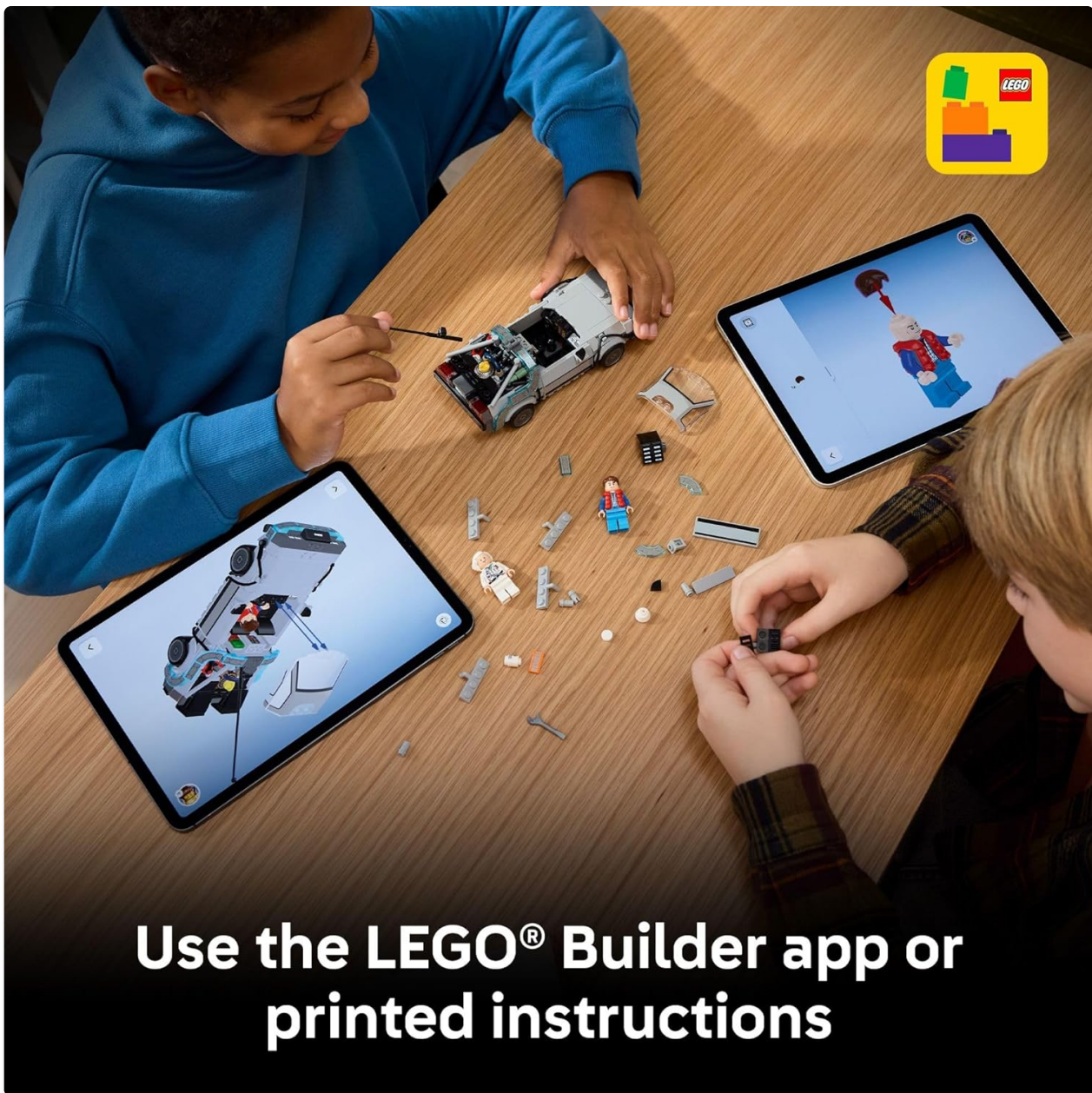
Image: Children using the LEGO Builder app for assembly.