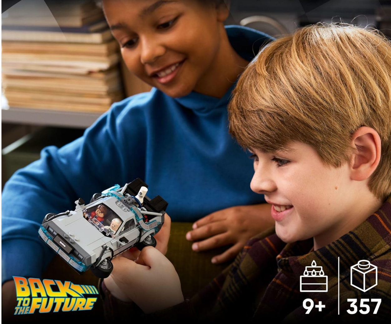
Image: The complete LEGO Speed Champions Time Machine set with minifigures.