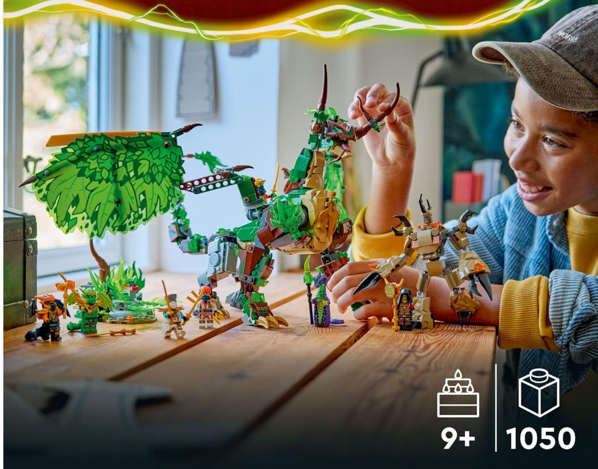
Image 1.1: The assembled LEGO NINJAGO The Dragon of Life set with a child interacting with it.