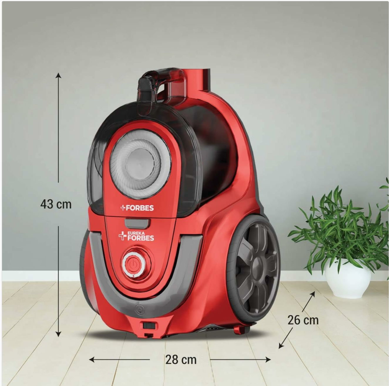
Visual representation of the vacuum cleaner's dimensions.