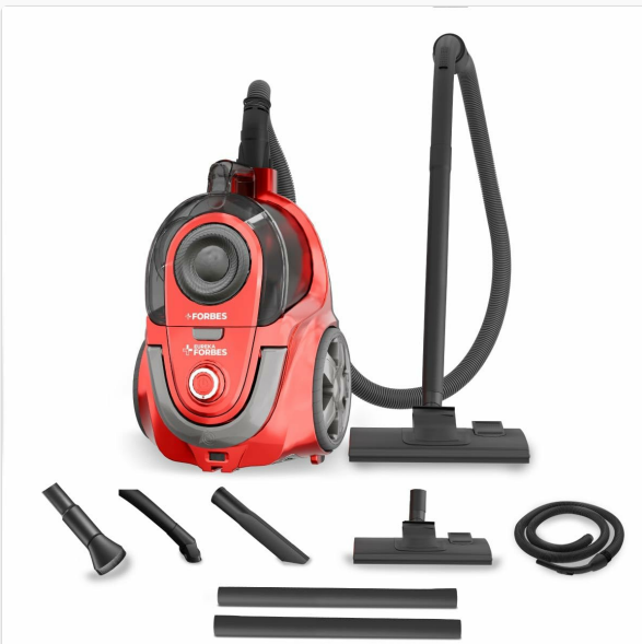
All components of the Cyclo Vac, including the main unit, hose, extension tubes, and various nozzles.

Your Cyclo Vac comes with the main vacuum unit, a flexible hose, two extension tubes, and six versatile accessories: