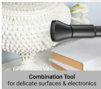
Combination Tool for delicate surfaces & electronics