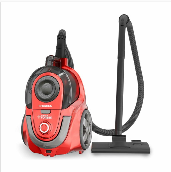
The Eureka Forbes Cyclo Vac main unit with its various cleaning accessories.