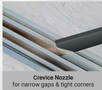
Crevice Nozzle for narrow gaps & tight corners