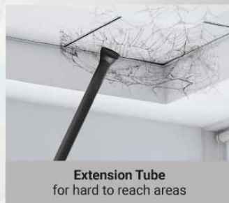
Extension Tube for hard to reach areas