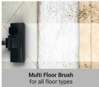
Multi Floor Brush for all floor types