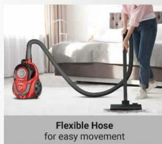
Flexible Hose for easy movement