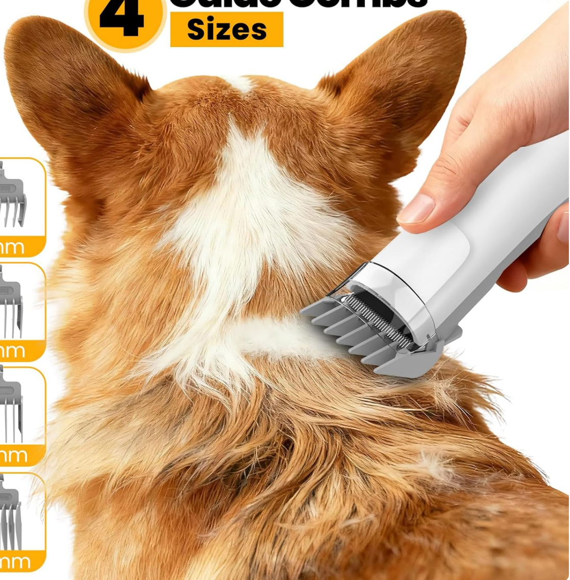
Image: The electric clippers with four different guide combs (3mm, 9mm, 16mm, 24mm) for precise trimming.