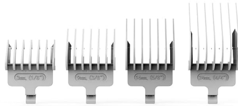
Clipper Limit Comb*4