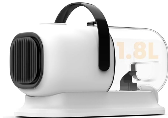
PG01 Pet Grooming Vacuum*1 (11.8*5.4*8.2 inches, 3.7lb)