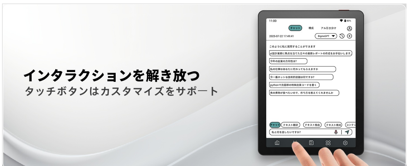
Image: The Bigme B6 E-reader displaying its interface with customizable touch buttons at the bottom of the screen.