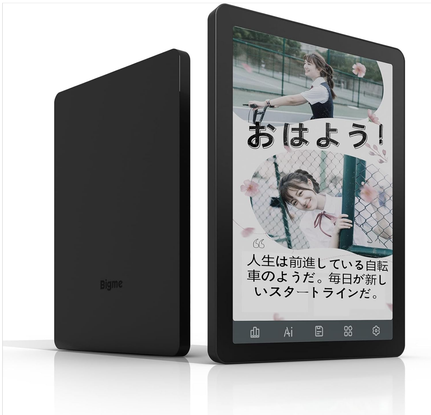
Image: Front and back view of the Bigme B6 Color E-reader. The device is black and features a slim design.