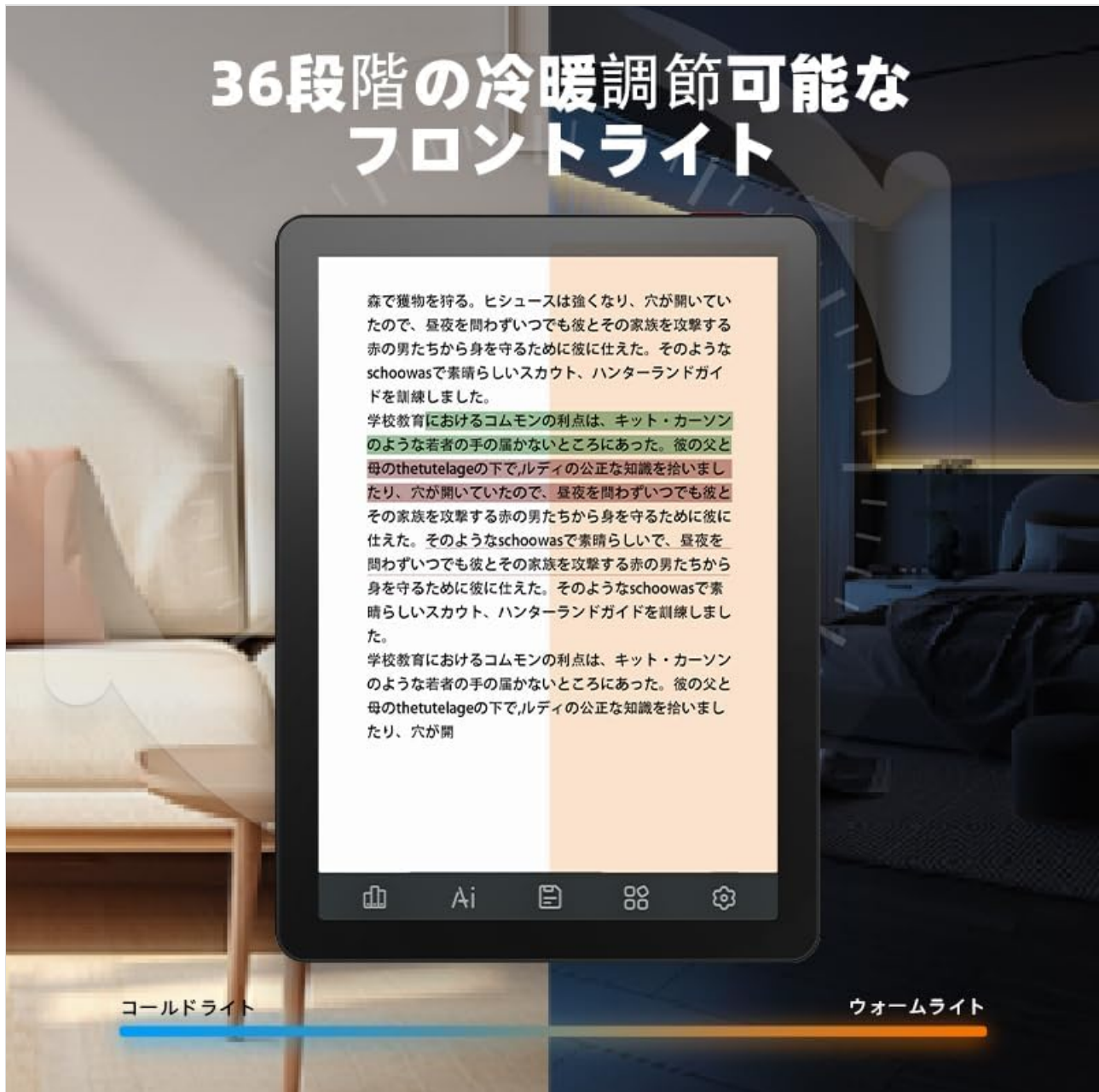
Image: The Bigme B6 E-reader displaying text with an illustration of adjustable front light levels, from cold light to warm light.