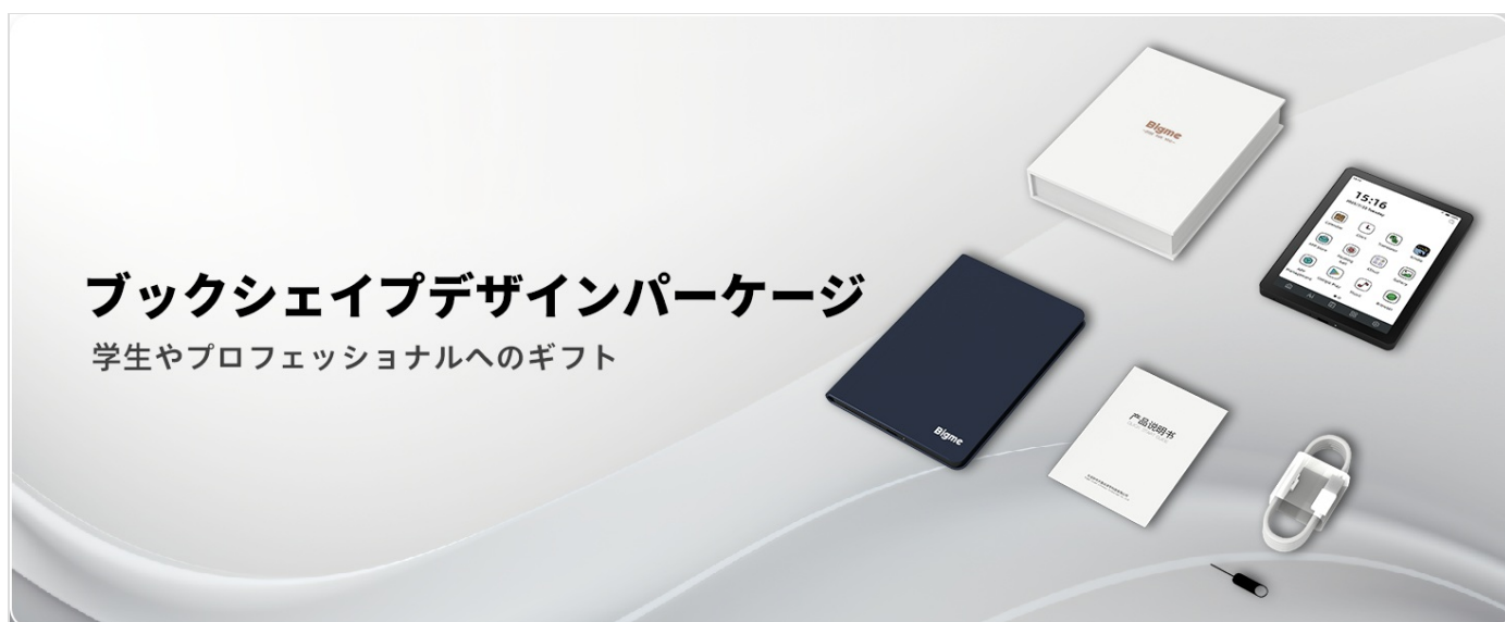
Image: Illustration of the Bigme B6 Color E-reader package contents, including the device, protective case, and user manual.