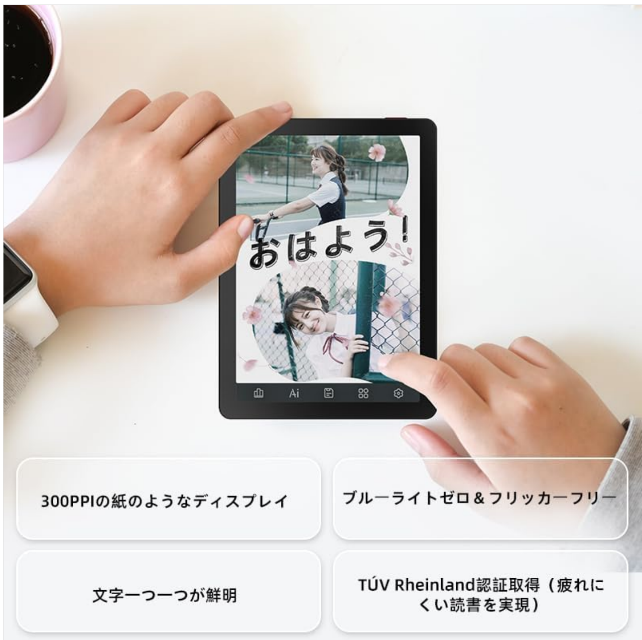
Image: A hand holding the Bigme B6 E-reader, highlighting its display features such as 300PPI, blue light zero, and clear text rendering.