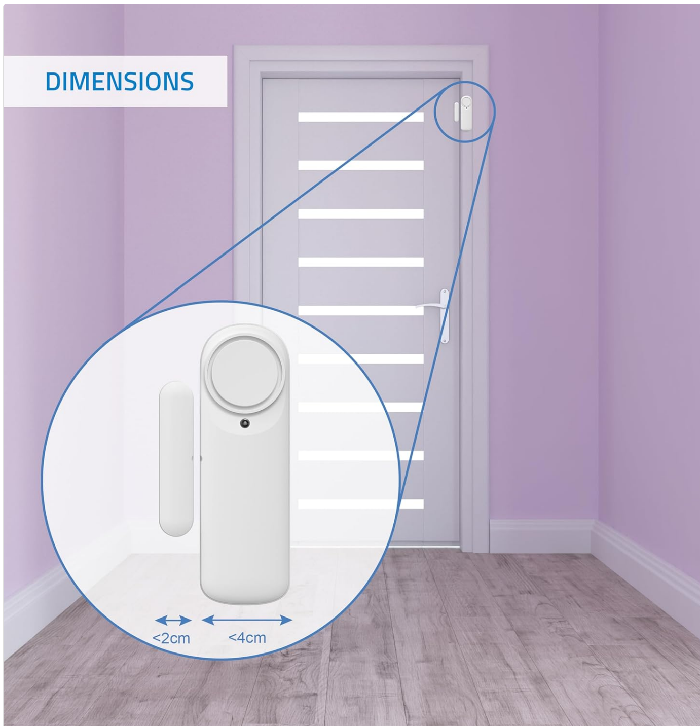
Image: A diagram illustrating the dimensions of the Nivian Smart WiFi Door Alarm and its recommended placement on a door, showing the main unit and magnetic sensor alignment.