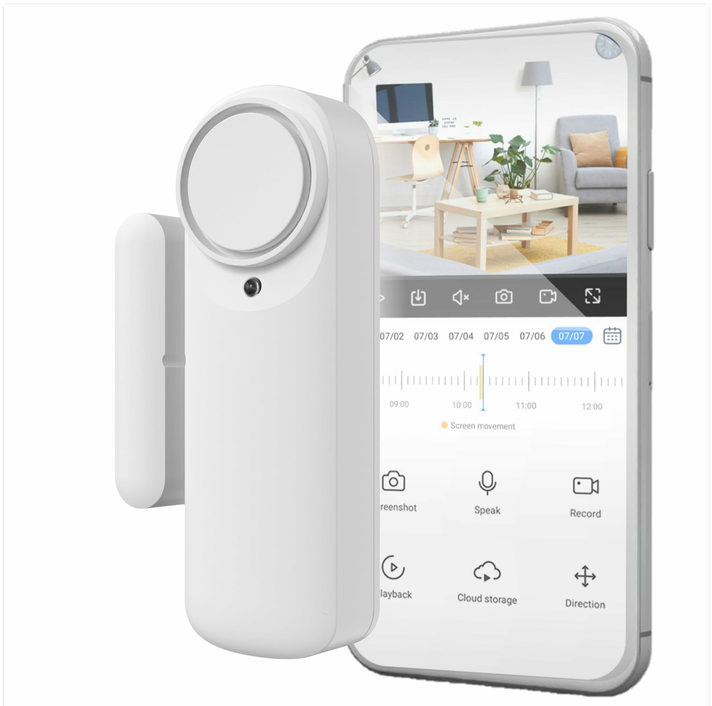
Image: Overview of the Nivian Smart WiFi Door Alarm, highlighting its WiFi connectivity, battery-powered wireless design, app/manual disarm options, powerful siren, and compatibility with Amazon Alexa, Google Assistant, and Tuya Smart Home.