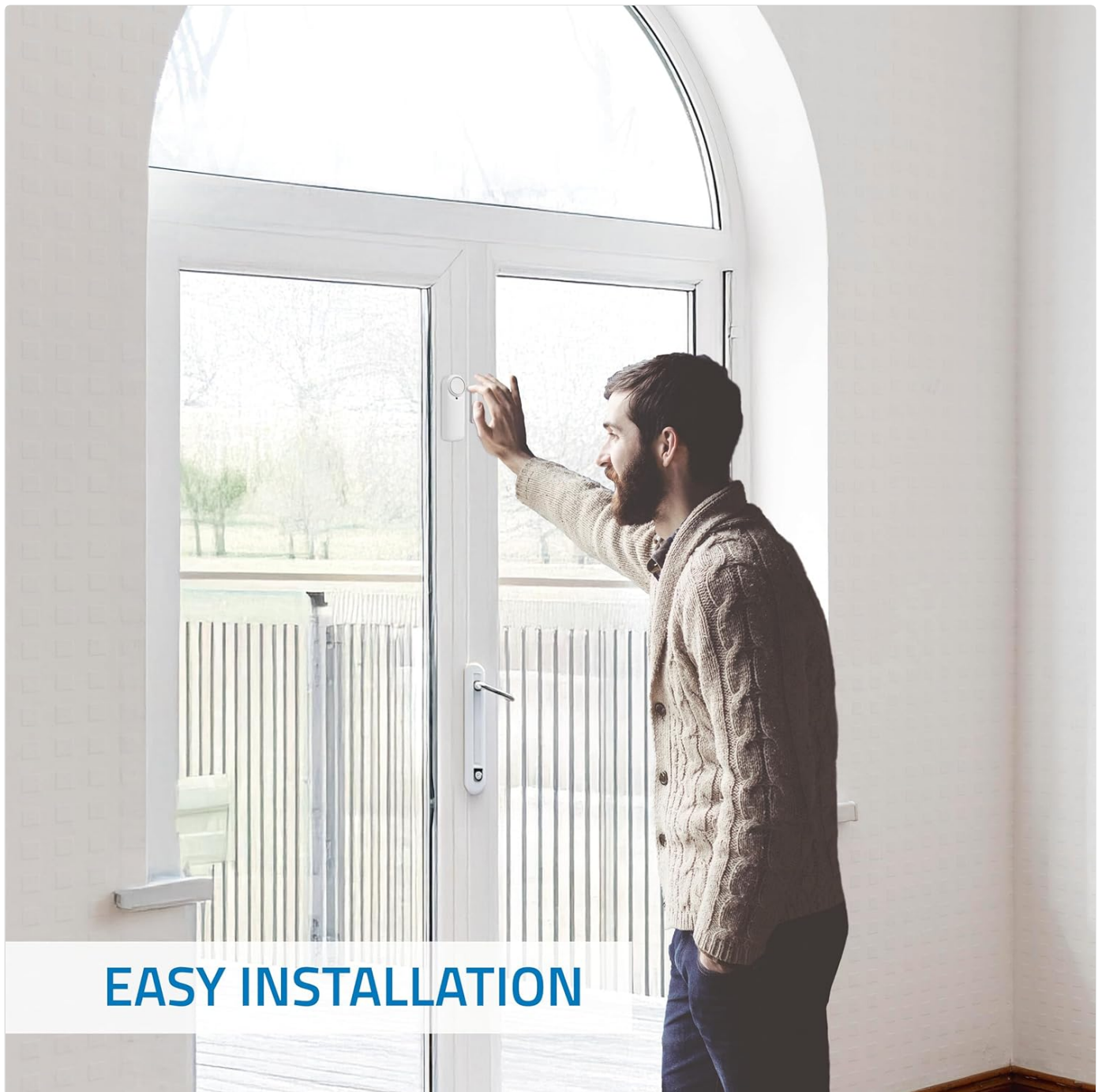
Image: A person demonstrating the easy installation of the Nivian Smart WiFi Door Alarm on a door frame, highlighting its wireless and tool-free setup.