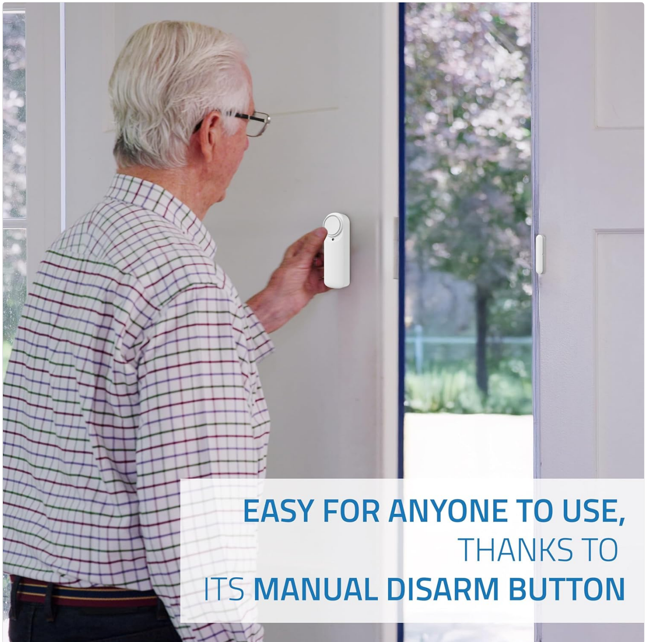
Image: An elderly man demonstrating the use of the manual disarm button on the Nivian Smart WiFi Door Alarm, highlighting its ease of use for all users.

The main sensor unit features a manual button. Press this button to arm or disarm the alarm. Refer to the device's LED indicator for status confirmation (e.g., solid light for armed, flashing for disarmed).