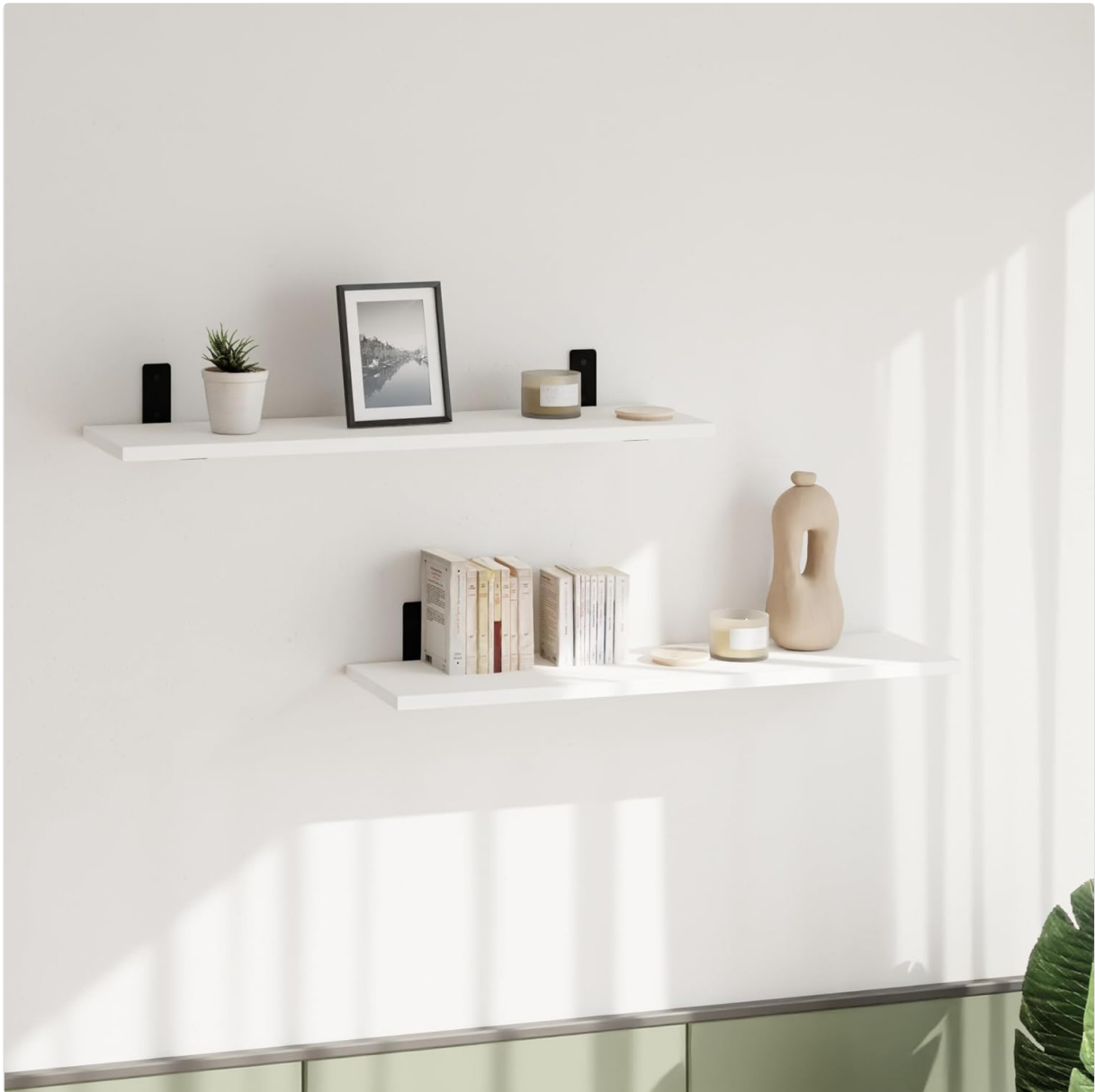
Image: Example of the wall shelf in use, displaying various items.