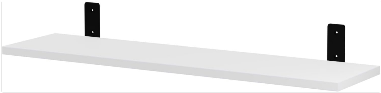
Image: The shelf panel and two metal support brackets, as typically found in the package.