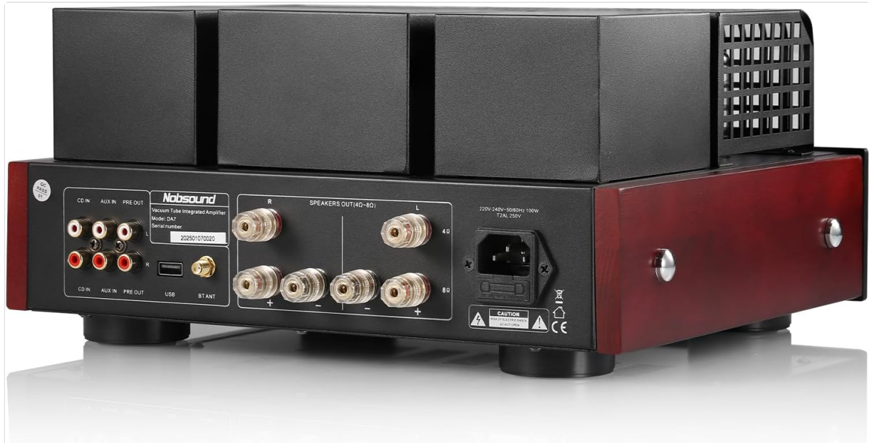
Figure 3: Rear panel of the DA7 amplifier, displaying speaker terminals, RCA inputs, optical, coaxial, USB, and power input.