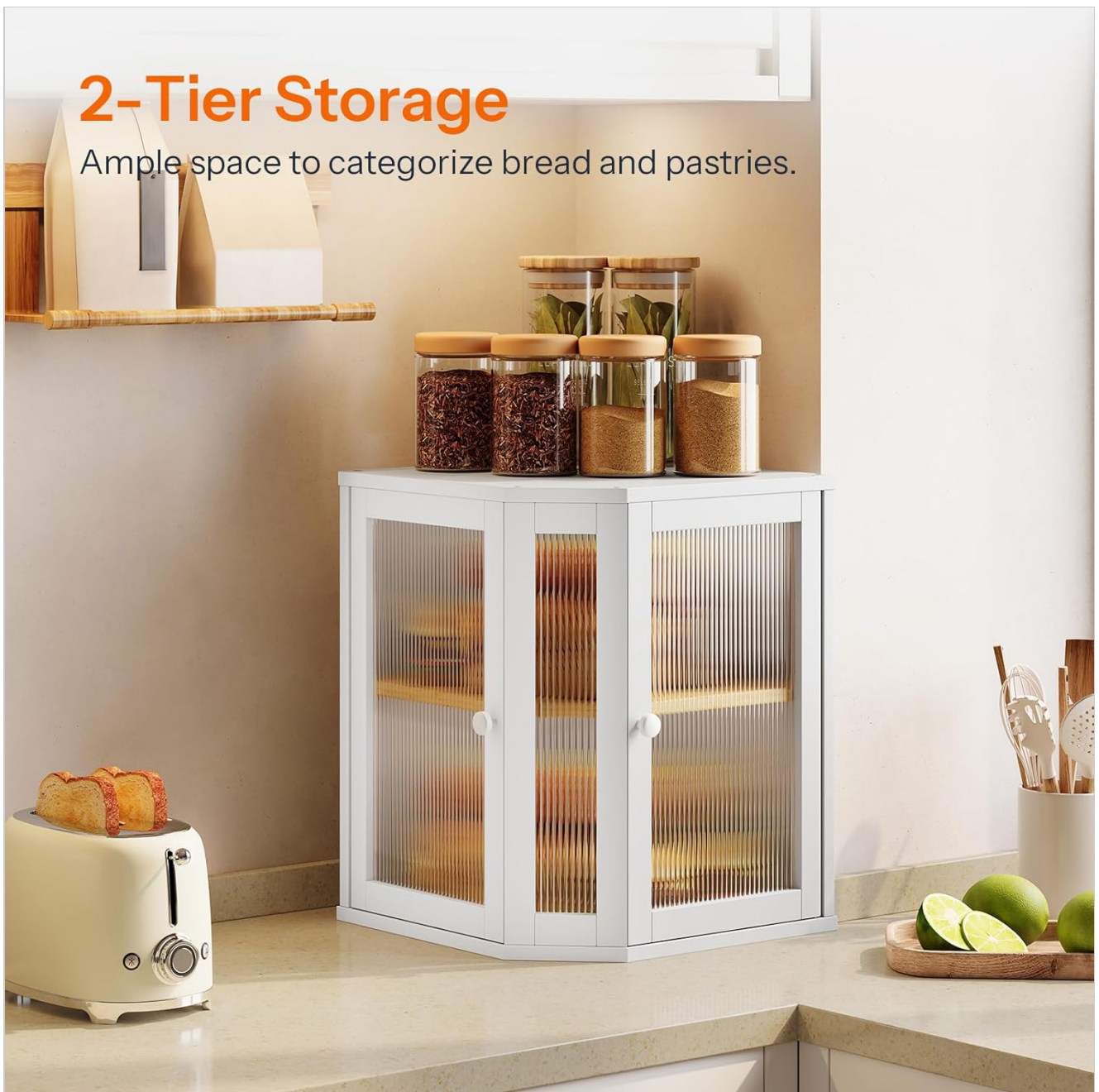
Image demonstrating the two-tier storage capacity of the bread box.