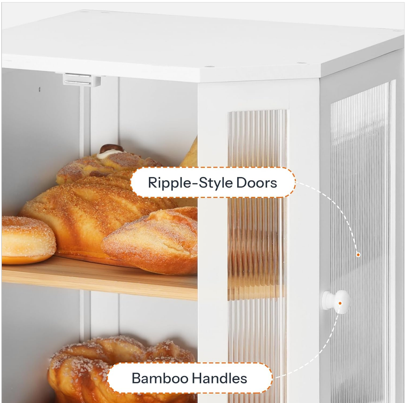
Image highlighting the ripple-style doors and bamboo handles.