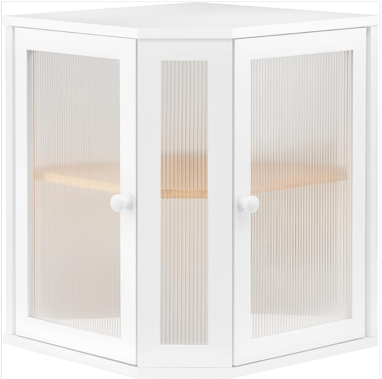
Image of the fully assembled bread box, ready for use.

Note: If you encounter any difficulty during assembly, refer to the included diagram in the accessory kit or the video guide. Ensure all screws are tightened securely but do not overtighten to prevent damage to the bamboo.