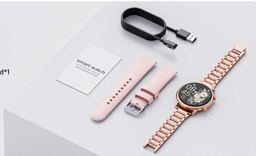
Image: Contents of the Hwagol Smart Watch package.

Upon unboxing, verify that all items are present: