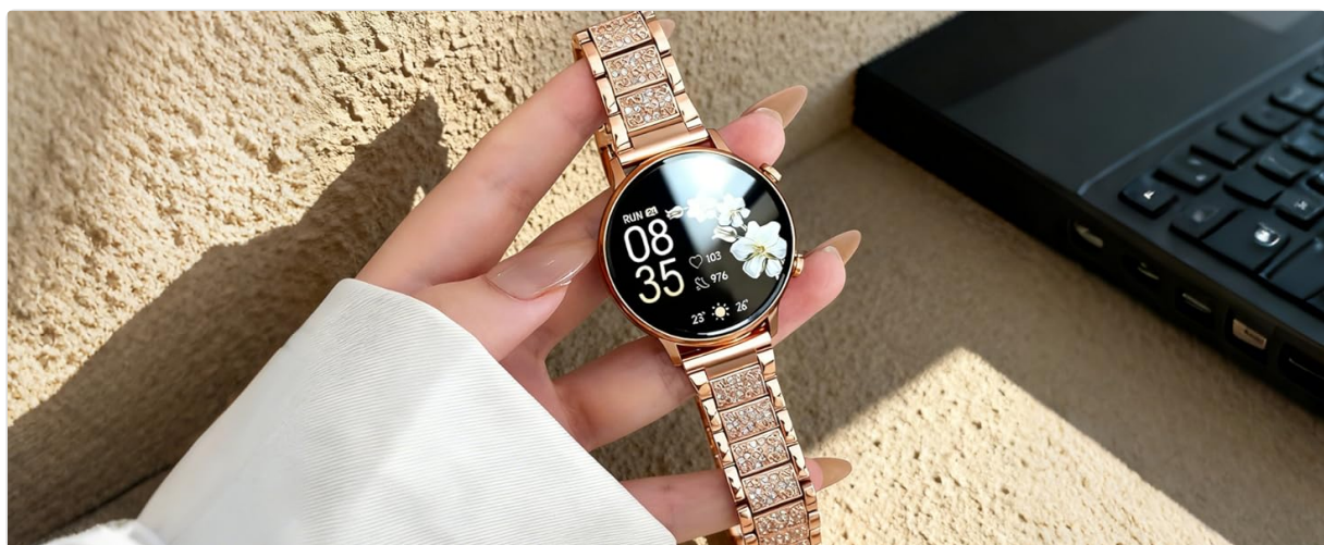
Image: Examples of customizable watch faces and the custom dial feature.

Personalize your smart watch by choosing from over 100 pre-installed watch faces or create your own custom dial using your favorite photos, such as selfies, pets, or landscapes, through the companion app.