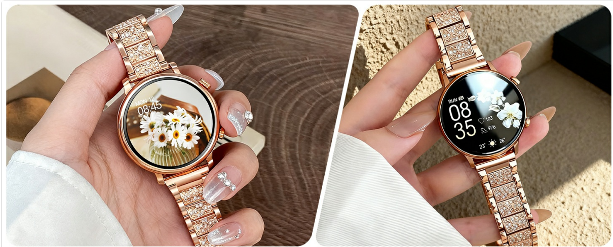
Image: Smart watch interface showing Bluetooth call and notification features.

The Hwagol Smart Watch supports Bluetooth 5.2 for seamless connectivity. Once paired with your smartphone, you can manage calls and receive notifications directly on your wrist.