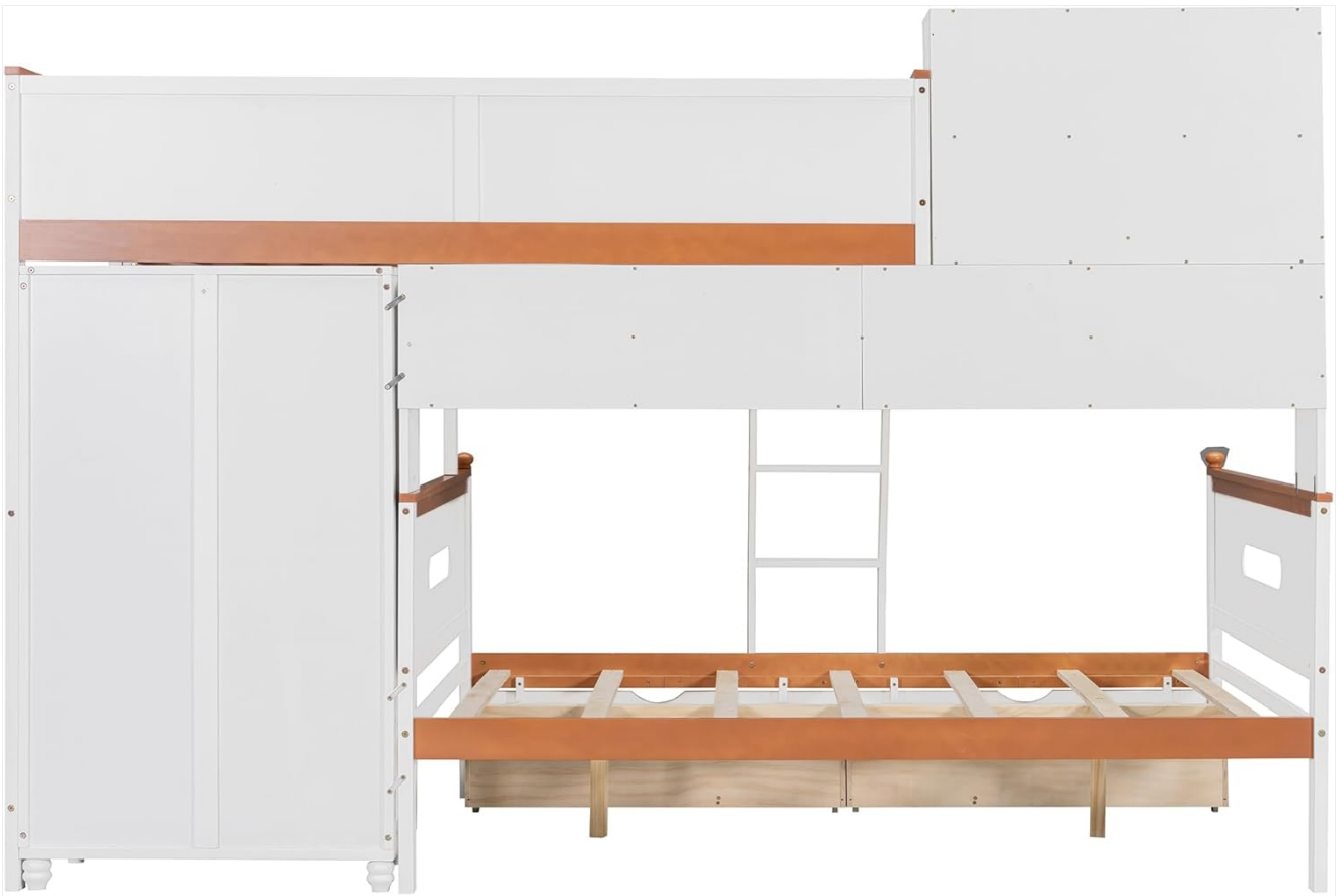
Image: Rear view of the bunk bed, highlighting the integrated wardrobe unit on the right side, designed for clothing storage.