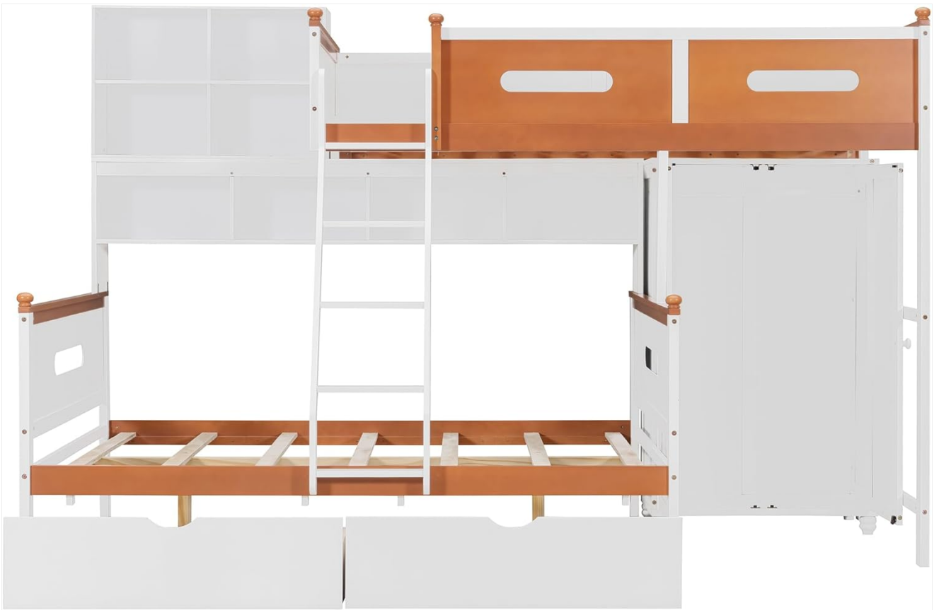
Image: Front view of the Merax Twin Over Full Wooden Bunk Bed, showcasing the twin upper bunk, full lower bunk, integrated shelving, and under-bed drawers.