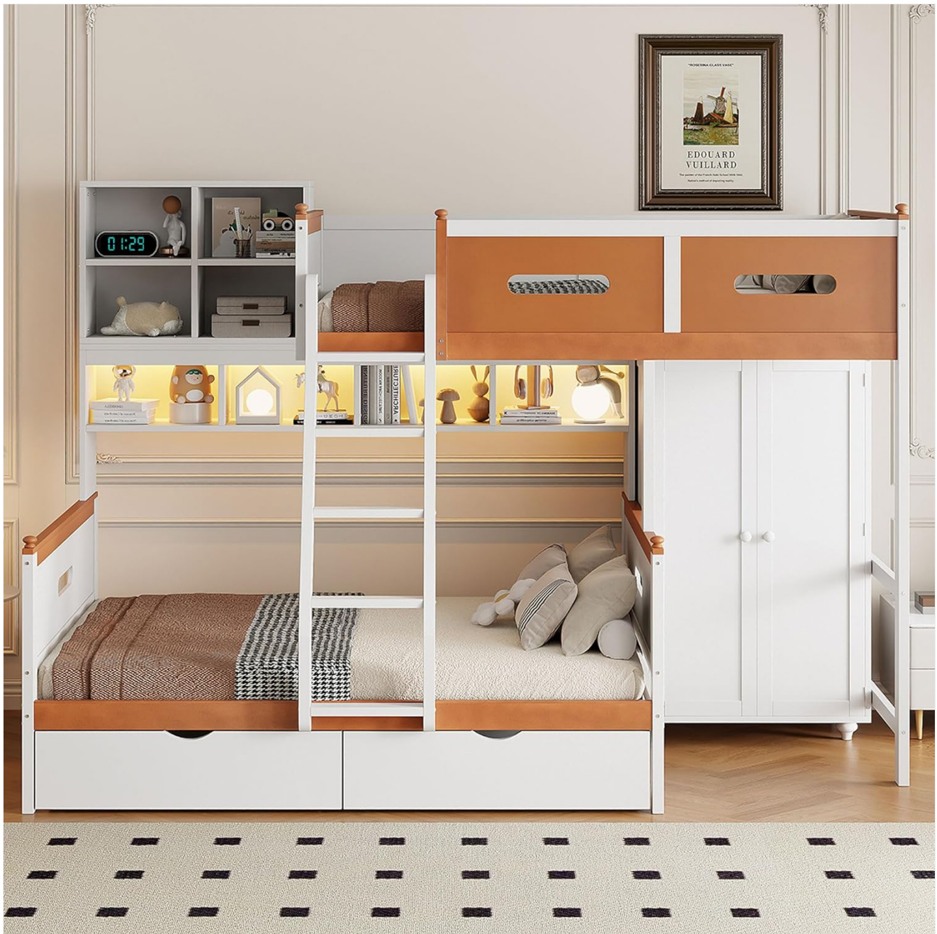
Image: The Merax Twin Over Full Wooden Bunk Bed in white and orange, featuring a built-in wardrobe, drawers, and shelves with LED lighting, presented in a bedroom setting.