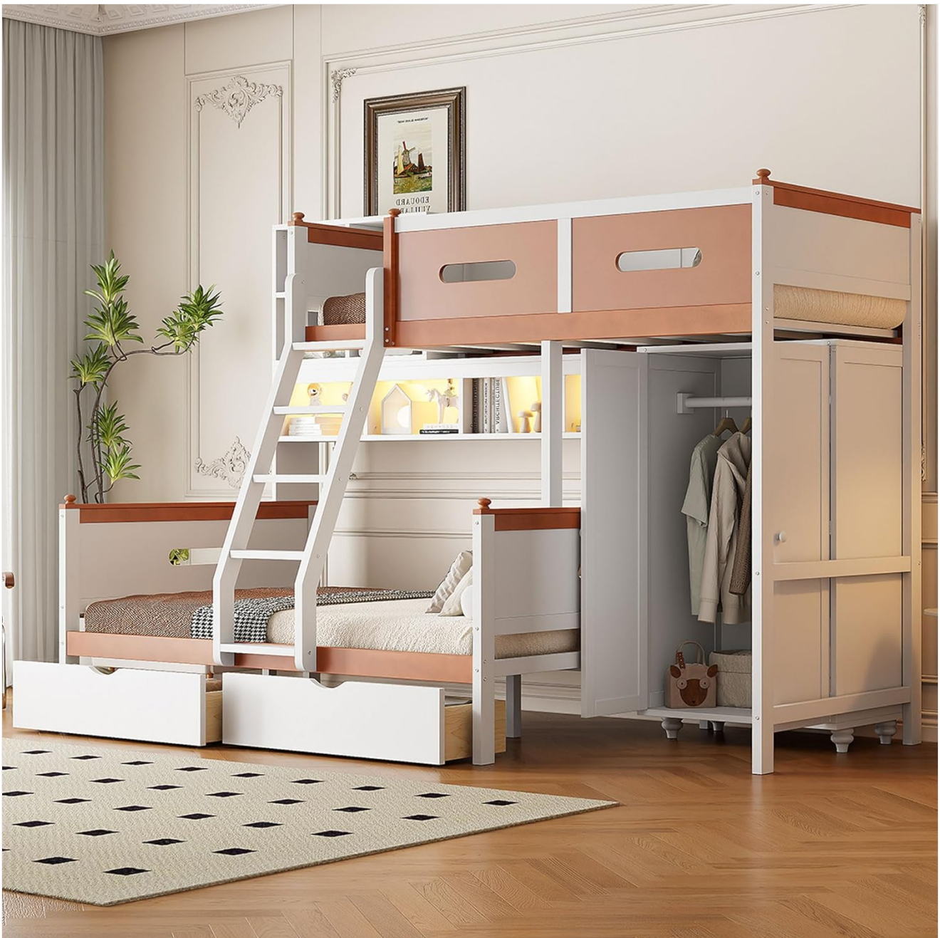
Image: The bunk bed with the two under-bed storage drawers partially pulled out, demonstrating their capacity for storing various items.