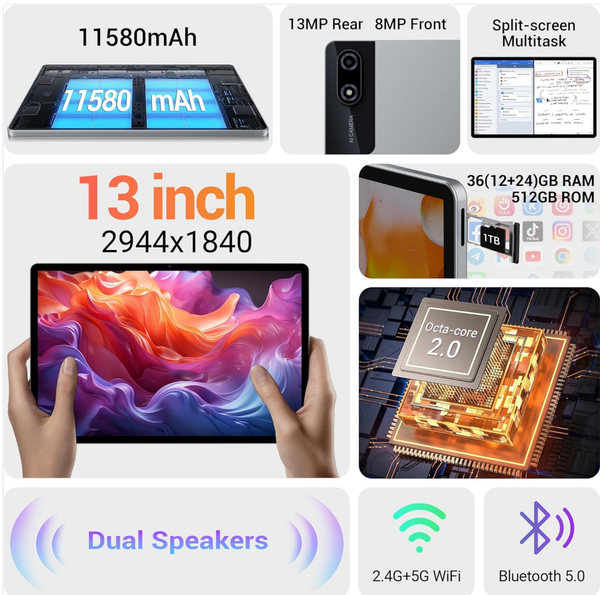
Image 2.1: Visual representation of the tablet's key specifications, including its 11580mAh battery, 13MP rear and 8MP front cameras, split-screen multitasking, 36GB RAM, 512GB ROM, and Octa-core 2.0 processor.