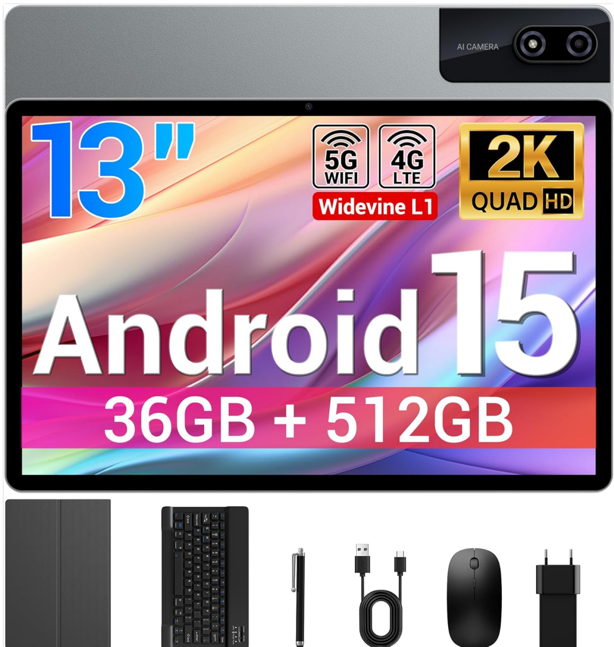
Image 1.1: BEYNIVAN 13-inch Android 15 Tablet with its complete accessory kit, including a keyboard, mouse, stylus, and protective case.