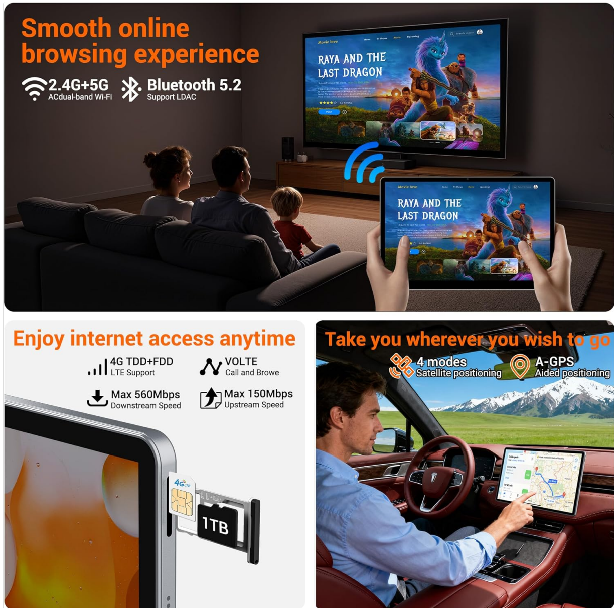
Image 3.1: The tablet's connectivity features, including dual-band Wi-Fi, Bluetooth 5.2, and the SIM/Micro SD card tray for 4G LTE access and storage expansion.