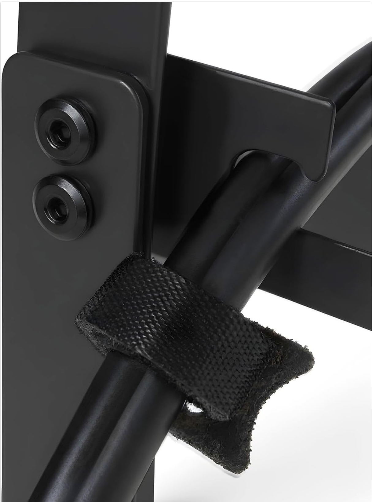
Image 5.1: A cable secured with a velcro strap within the organizer, showcasing effective cable management.