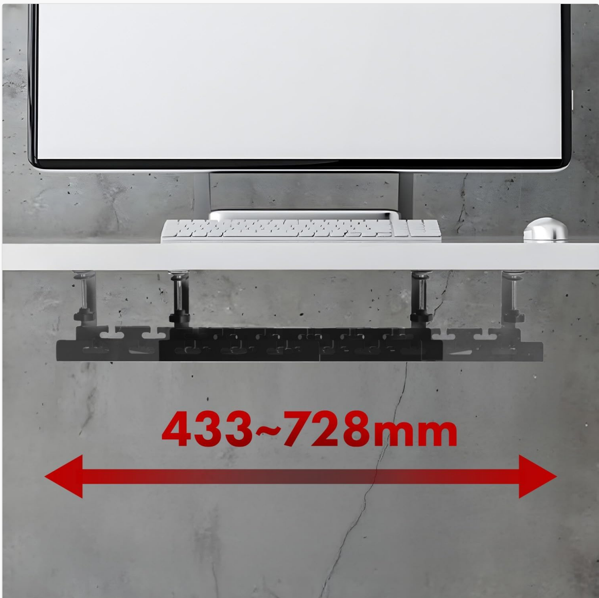
Image 4.1: The cable organizer's length can be adjusted from 433 mm to 728 mm to fit various desk sizes.