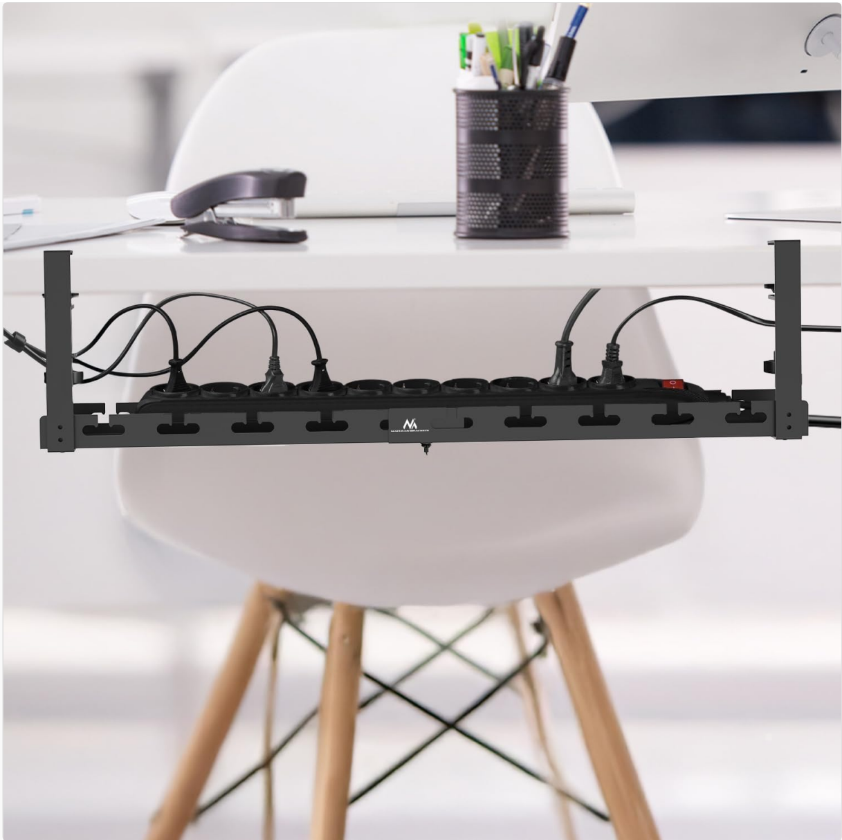
Image 1.1: The Maclean MC-103 B cable organizer installed under a white desk, effectively managing a power strip and multiple cables for a tidy setup.