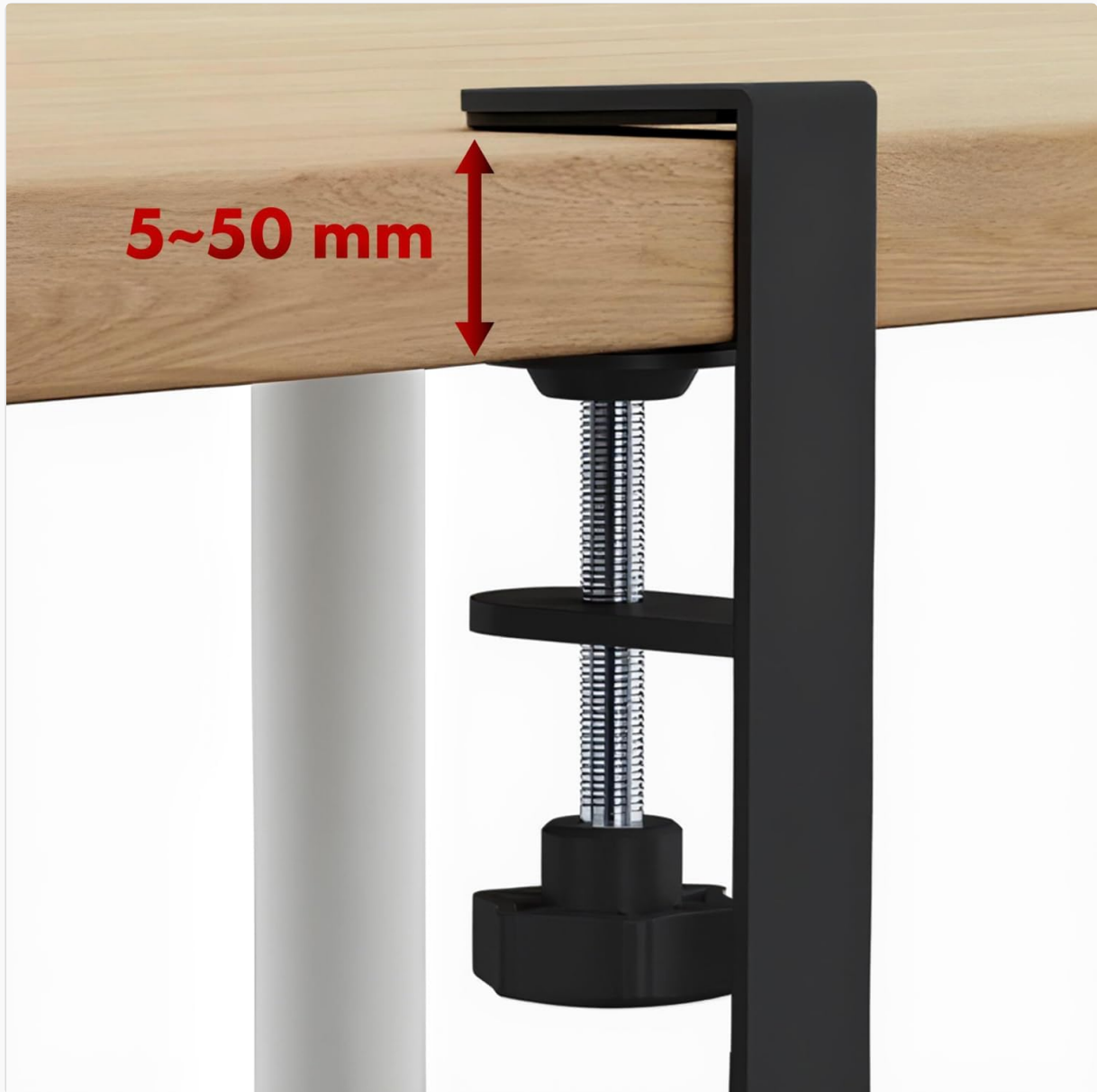
Image 4.2: Close-up of the clamp mechanism, illustrating its compatibility with desk thicknesses from 5 mm to 50 mm.