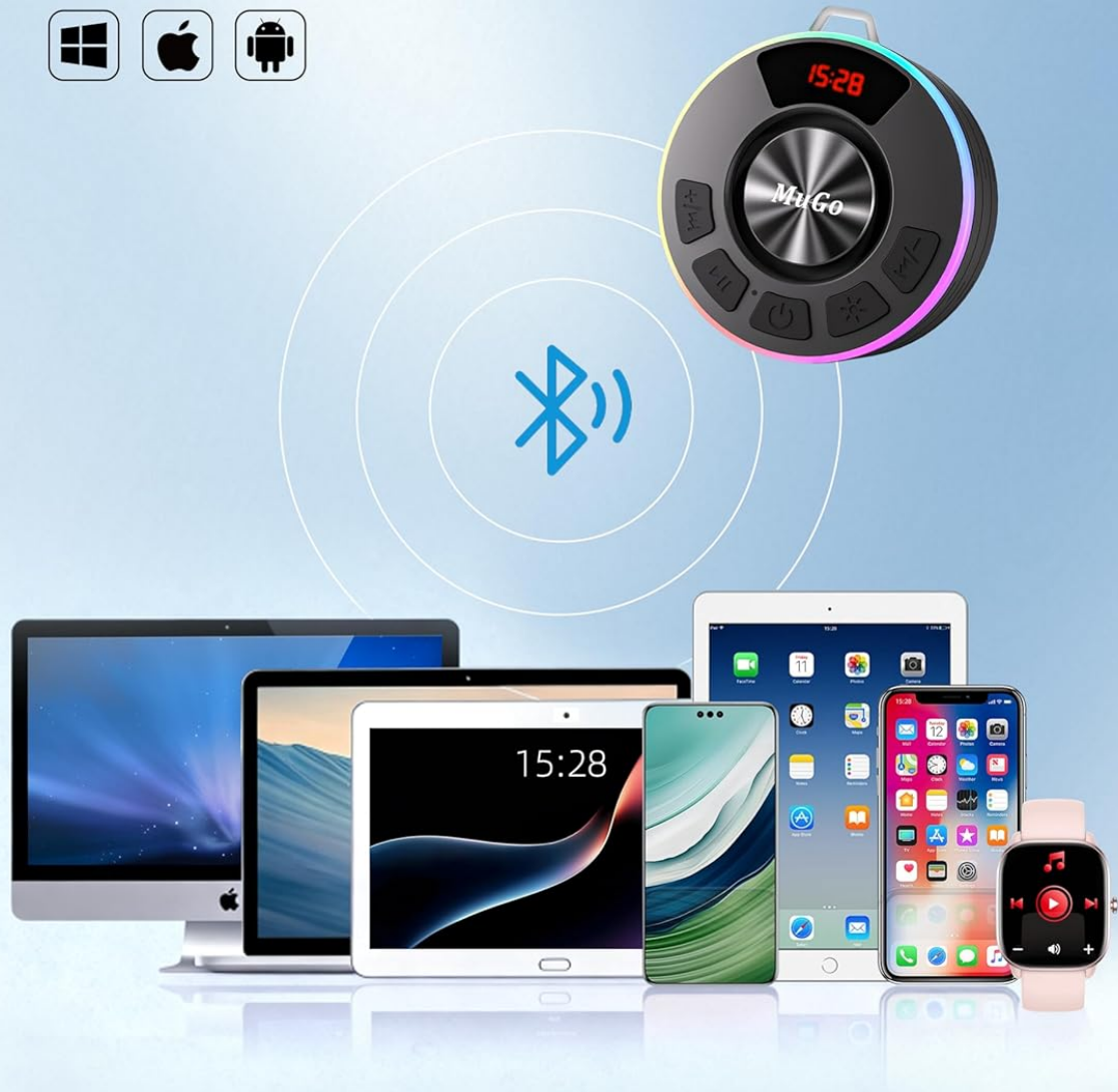
Image: The MuGo ZY-01 speaker demonstrating its wide compatibility with various Bluetooth 5.3 enabled devices.