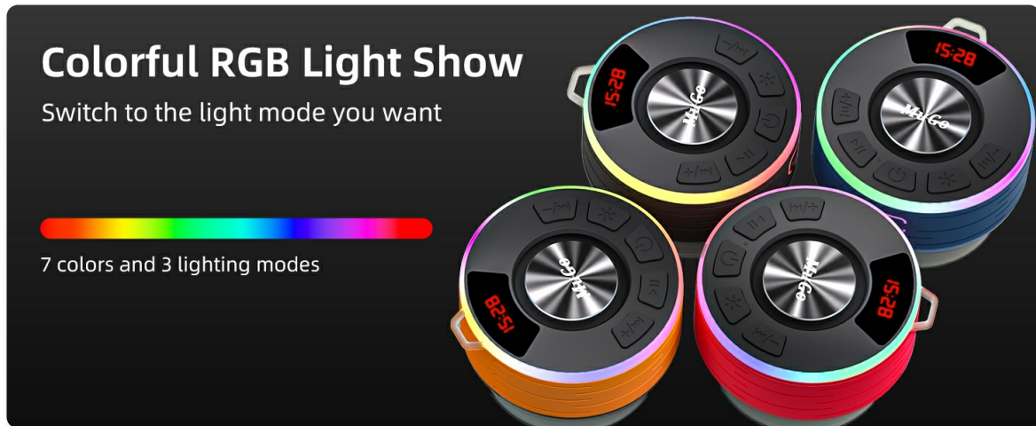
Image: Several MuGo ZY-01 speakers displaying various colorful RGB light patterns.