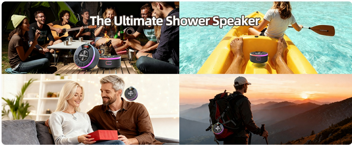
Image: The MuGo ZY-01 speaker floating in a body of water, illustrating its waterproof and buoyant design.