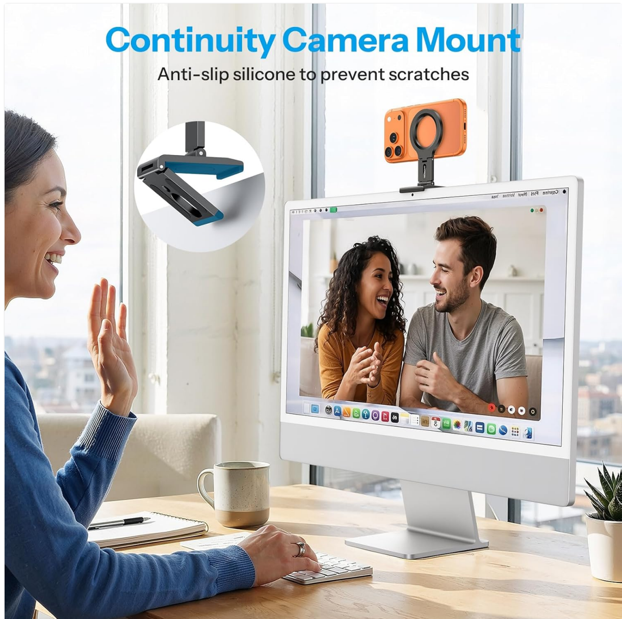
Image: The OMOTON VC07 mount elevating a smartphone for an improved workspace view during a video call.

phone or the mount's arm to the desired position. The robust hinges will hold the angle firmly. For horizontal or vertical orientation, rotate the phone on the magnetic ring.