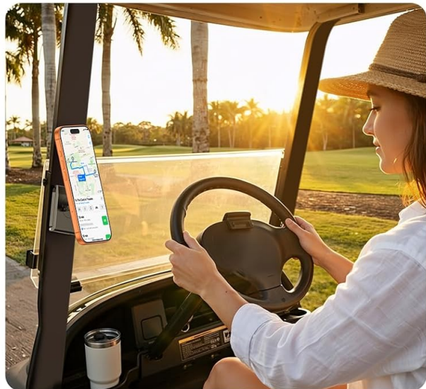
Image: Examples of the OMOTON VC07 mount magnetically attached to different metal surfaces for diverse applications.