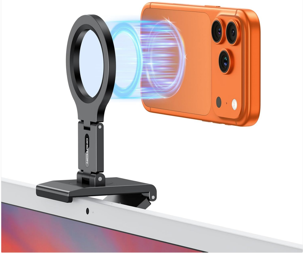
Image: A visual representation of the strong magnetic connection between the mount and a smartphone.

Your browser does not support the video tag.