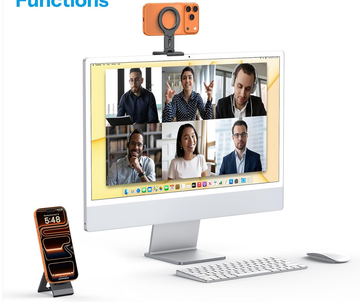
Image: A smartphone mounted on a monitor using the OMOTON VC07, actively participating in a video conference.