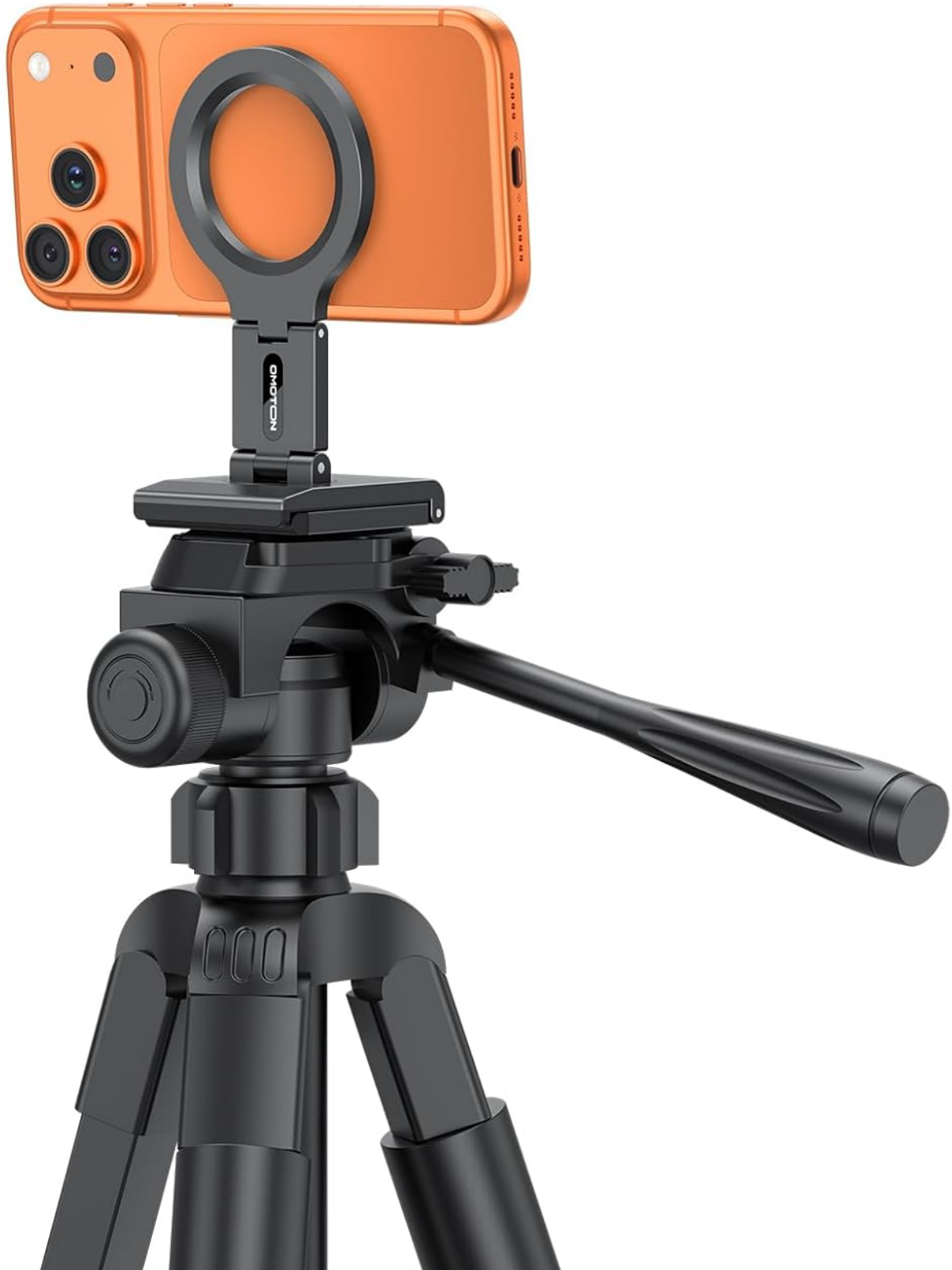
Image: The OMOTON VC07 mount securely holding a smartphone on a tripod, ready for use.