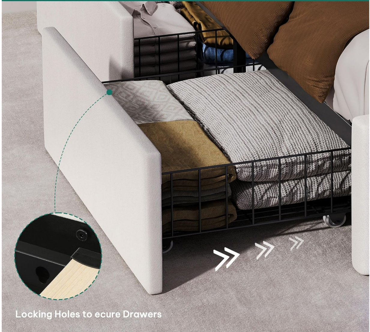
Image: A close-up of the under-bed storage drawers, highlighting their wheeled design and ample storage capacity.