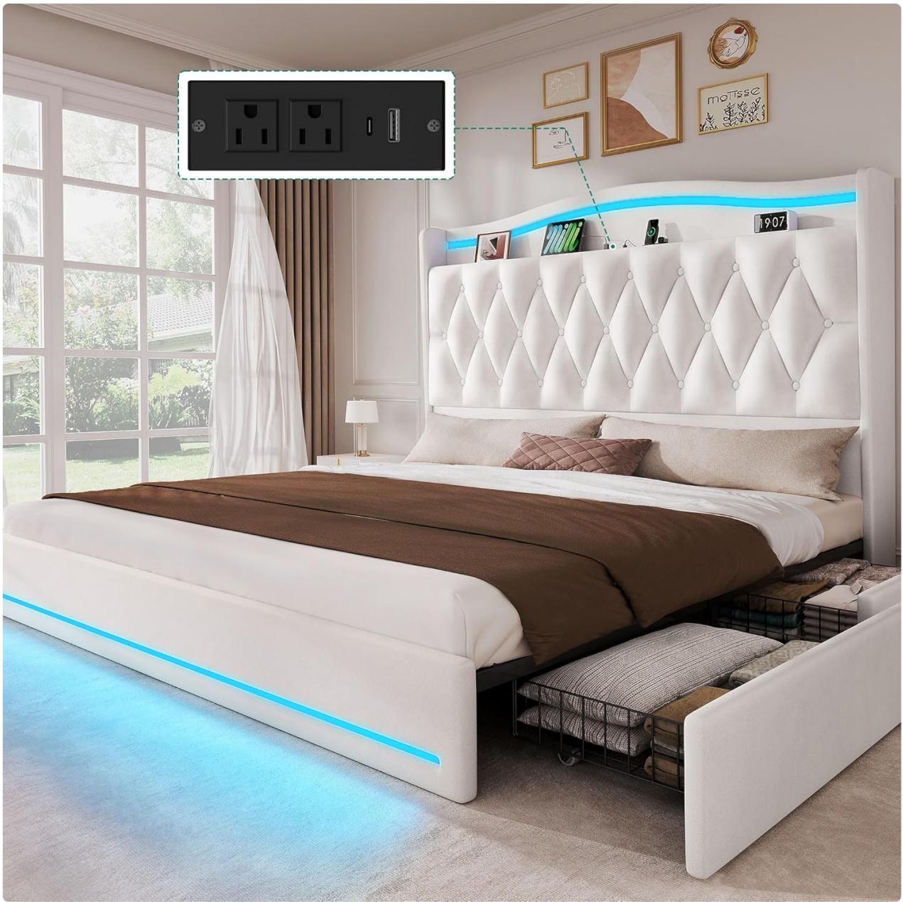
Image: YITAHOME King Size Bed Frame in white, showcasing LED lighting and open storage drawers.