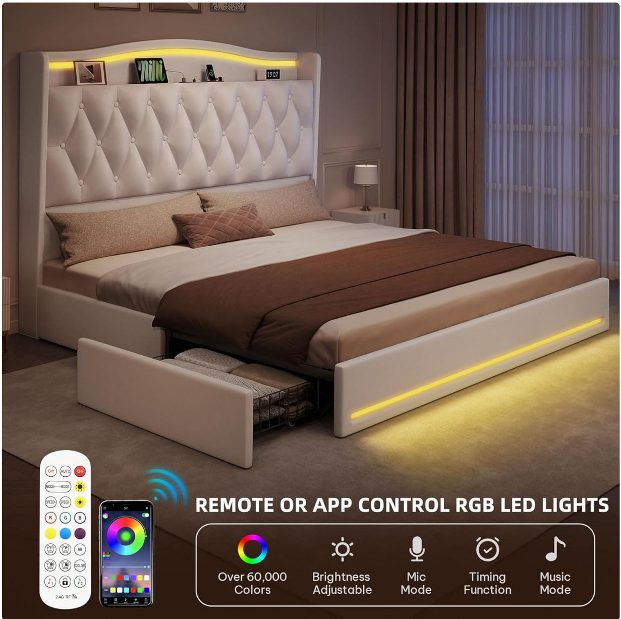
Image: The bed frame with RGB LED lights illuminated, showing the remote control and smartphone app interface for light customization.