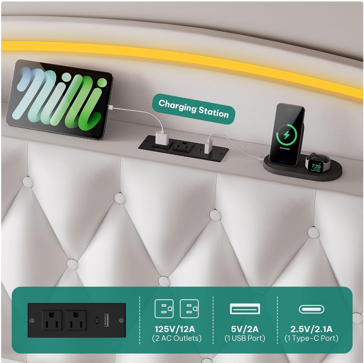
Image: Detailed view of the integrated charging station with AC outlets, USB, and Type-C ports.