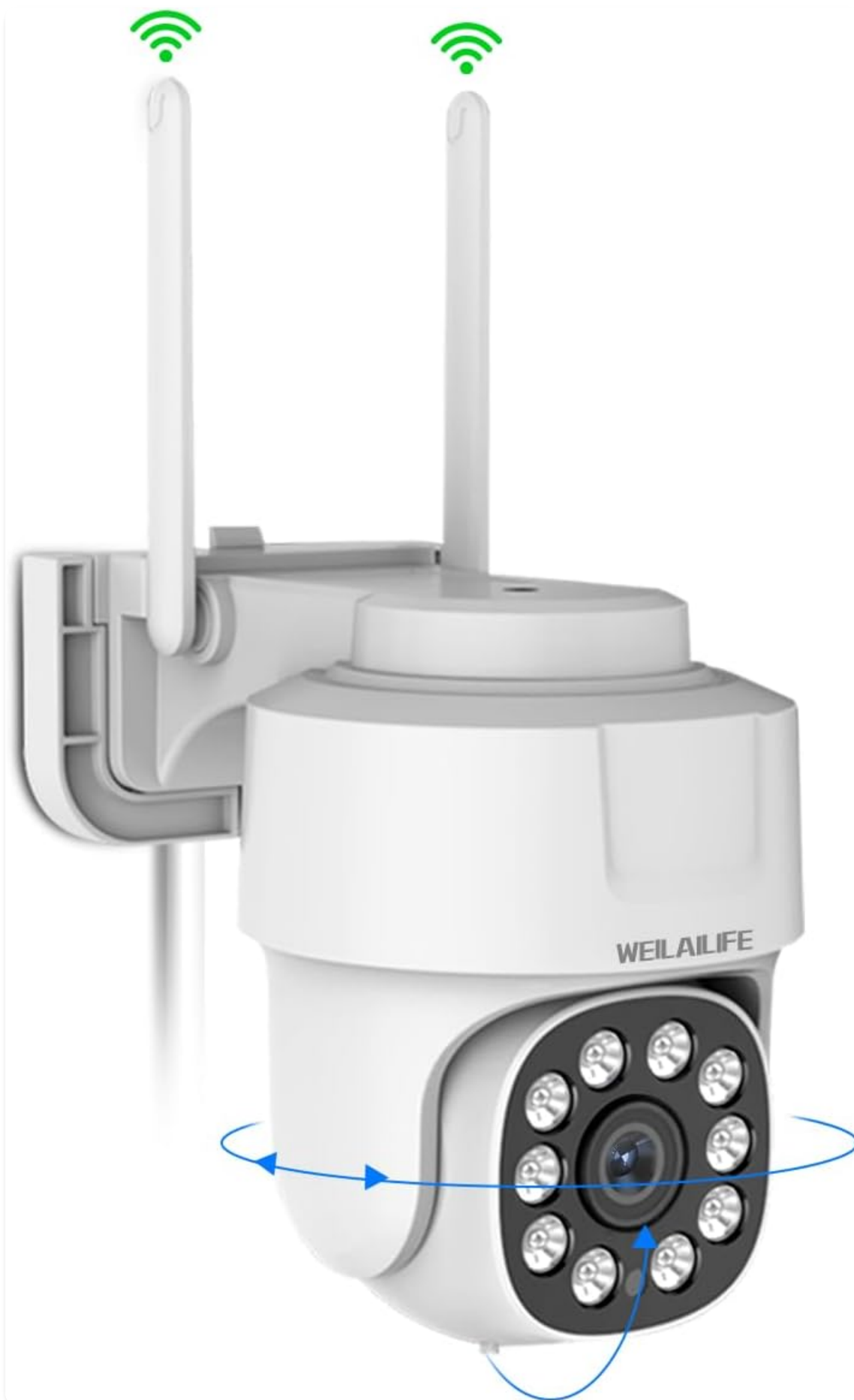
Figure 3.1: WEILAILIFE PTZ Camera with antennas. The blue arrows indicate the pan and tilt movement capabilities.