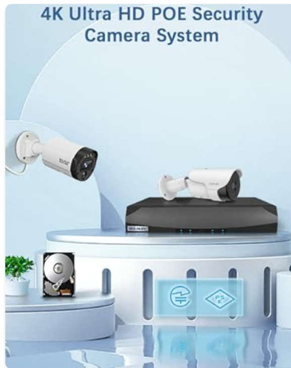
Figure 4.4: The motion detection system provides alerts via app push notifications, email, and a buzzer, indicating detected activity.