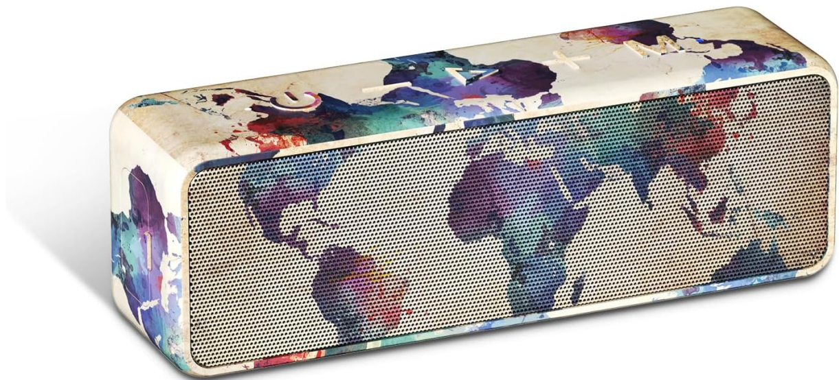
Image: The xdoobo BMTL World Bluetooth Speaker, showcasing its unique graffiti design.

Thank you for choosing the xdoobo BMTL World Bluetooth Speaker. This portable wireless speaker is designed to deliver powerful 20W sound with heavy bass, making it ideal for both outdoor and home use. Featuring IPX6 waterproofing, 13 hours of playtime, and convenient Type-C charging, it offers a robust and versatile audio experience. This manual provides detailed instructions to help you get the most out of your speaker.