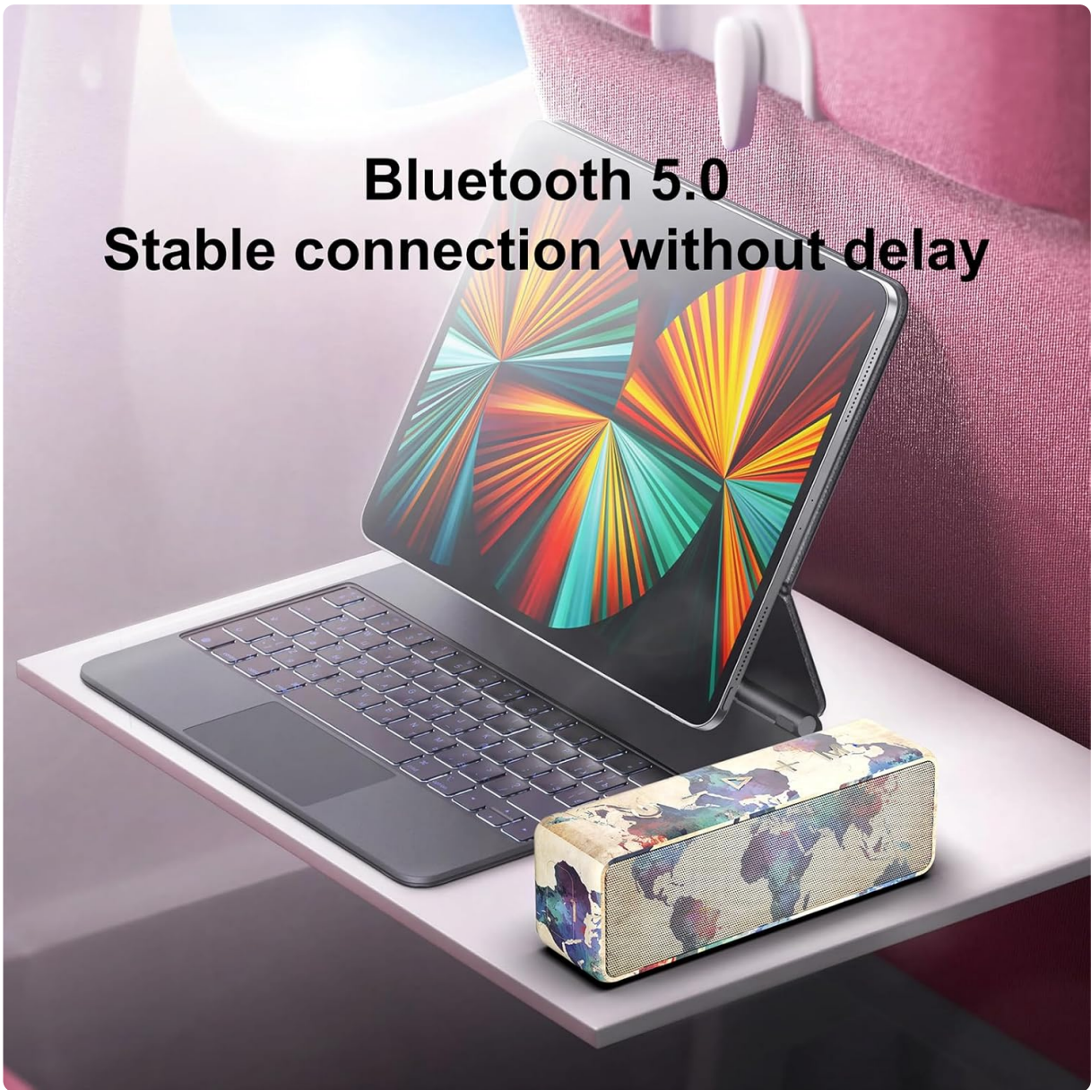
Image: The speaker connected via Bluetooth to a tablet, demonstrating stable Bluetooth 5.0 connection.