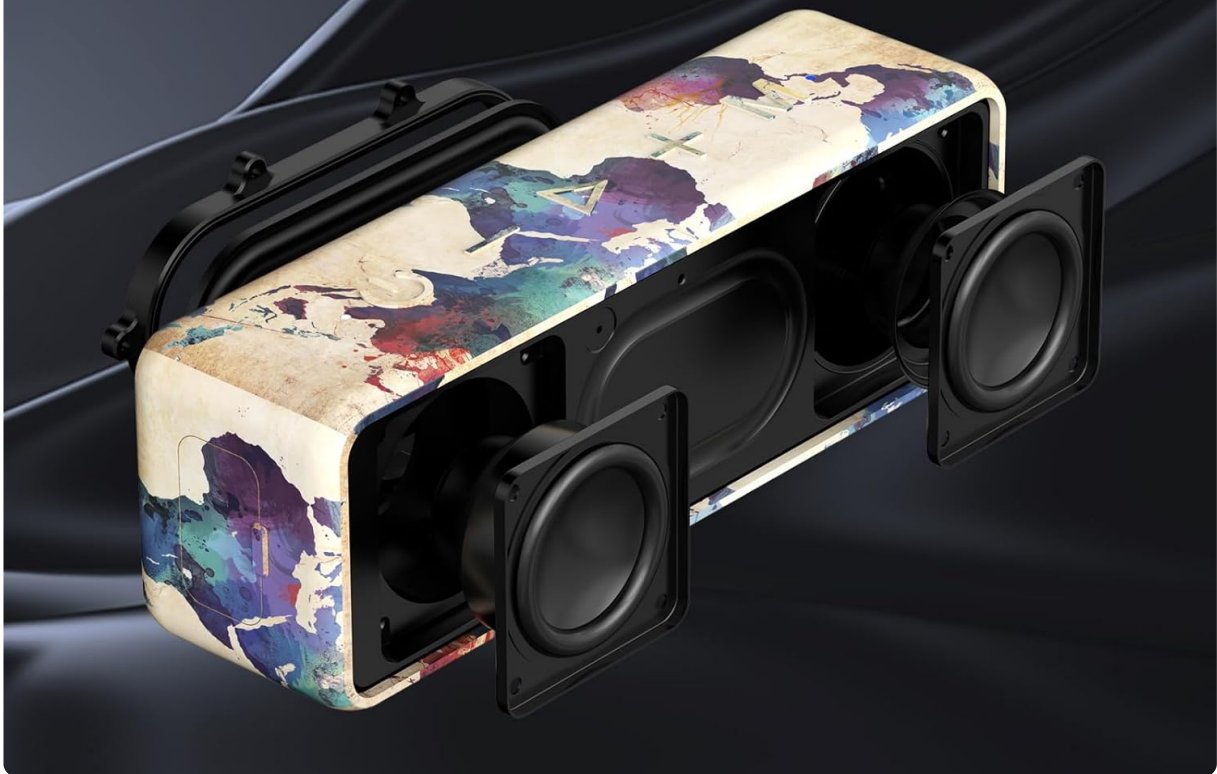
Image: An internal view of the speaker, illustrating the components responsible for its powerful bass and Hi-Fi performance.