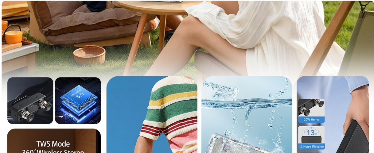
Image: Two speakers set up for True Wireless Stereo (TWS) mode, creating a wider soundstage.