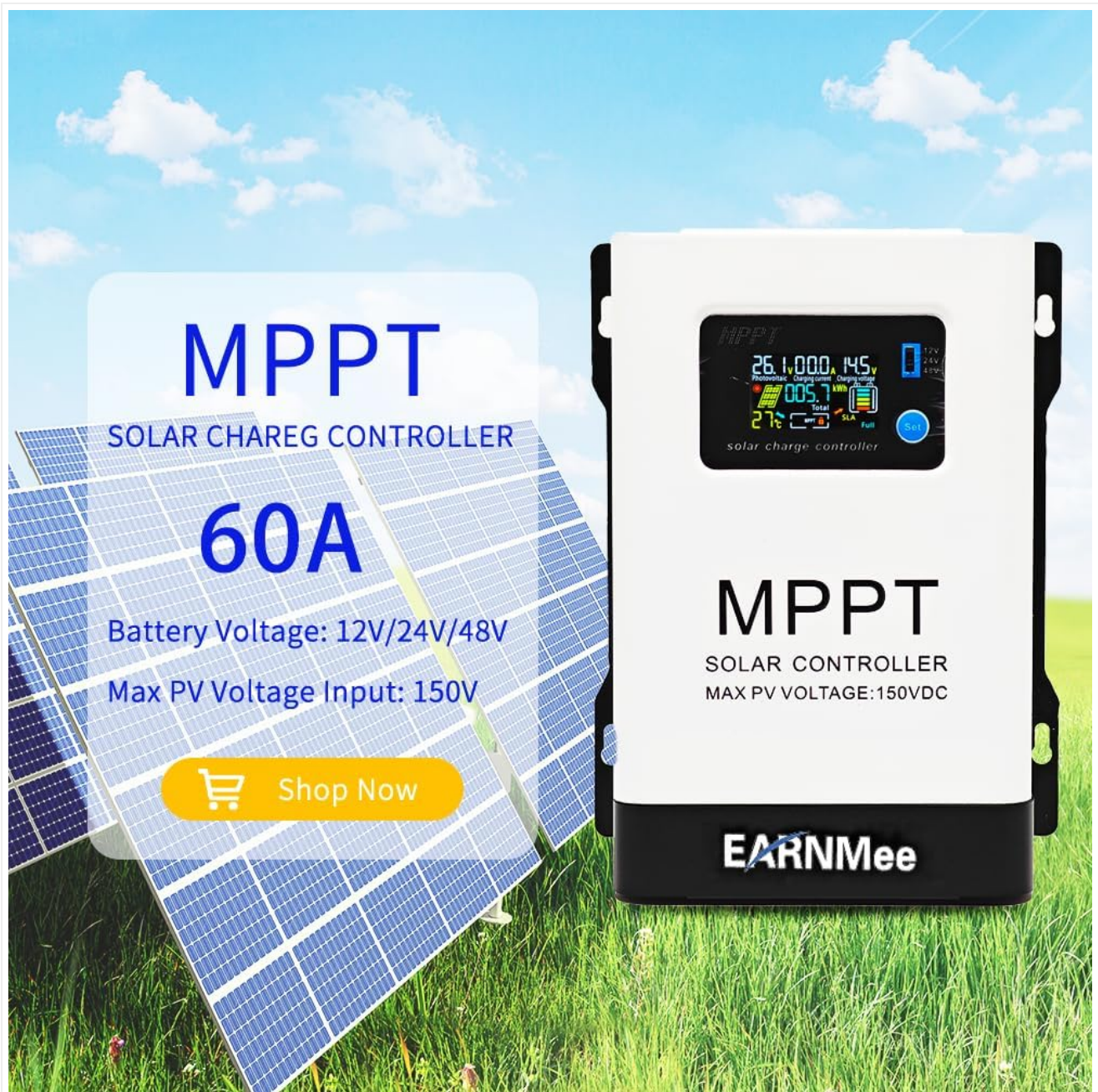
Image: The EARNMee 60A MPPT Solar Charge Controller showcasing its multiple protection features, including overload, polarity, over-charging, and over-temperature protection, ensuring safe operation.