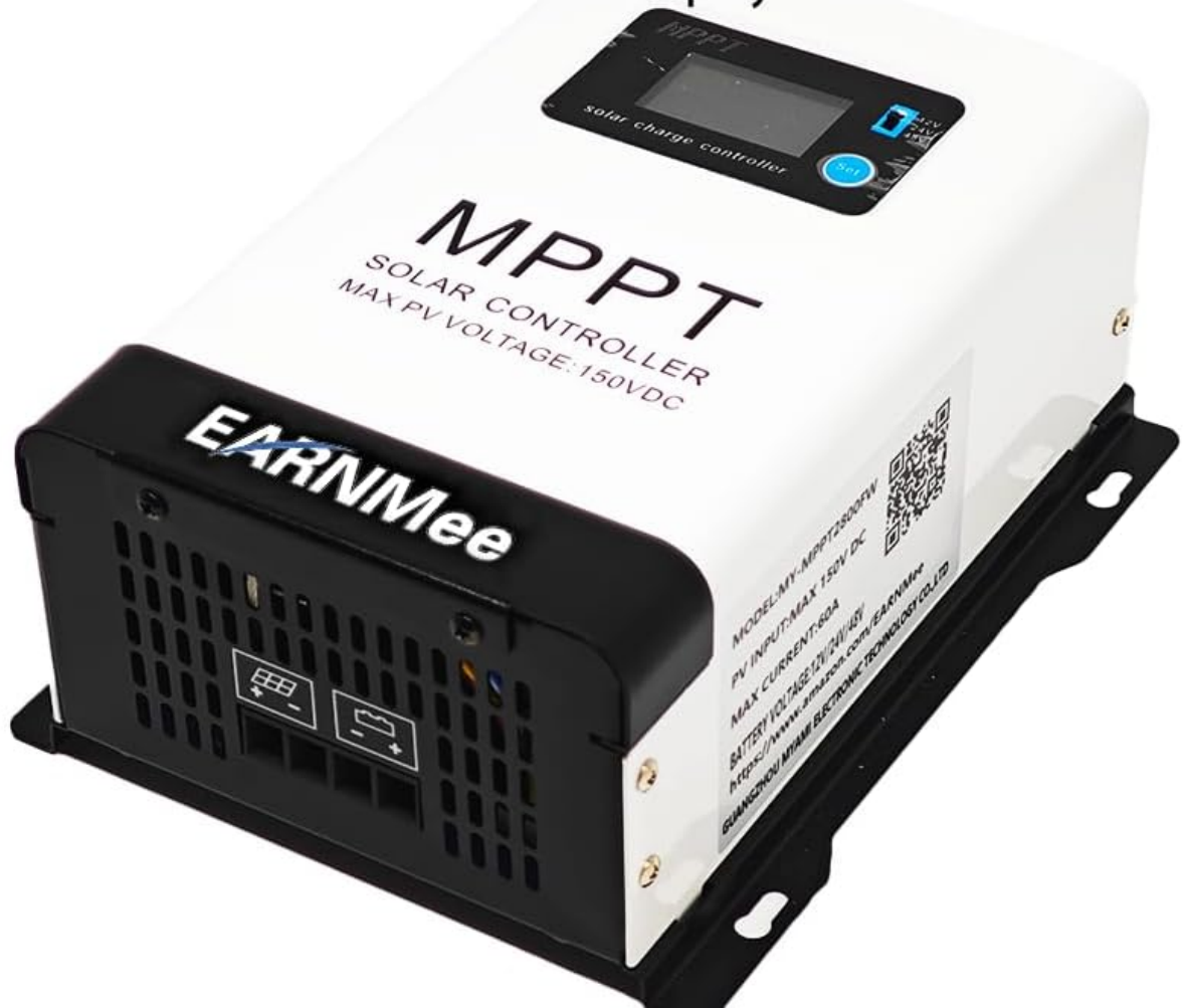
Image: Front view of the EARNMee 60A MPPT Solar Charge Controller, highlighting its intelligent and efficient design, along with a table of key specifications including input voltage, controller type, charging current, and power output for 12V, 24V, and 48V systems.