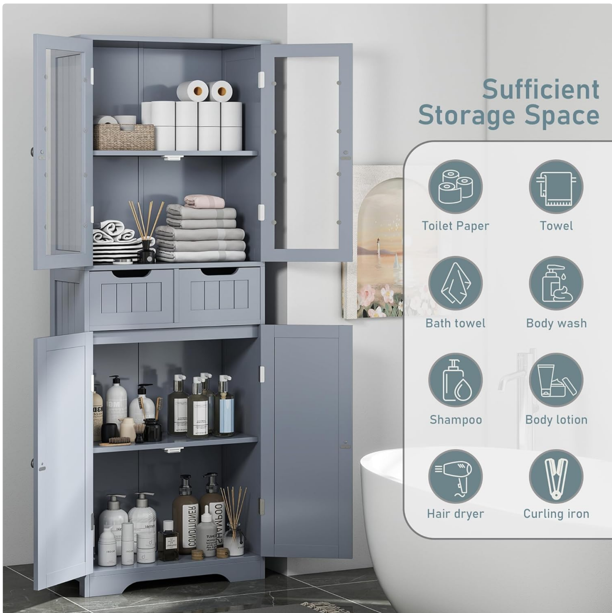
Image 3.1: The cabinet showcasing its storage capacity for items such as toilet paper, towels, bath towels, body wash, shampoo, body lotion, hair dryer, and curling iron.