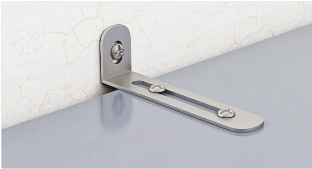
Image 2.1: Detail of the anti-tip mechanism, which must be securely fastened to the wall to prevent accidental tipping.