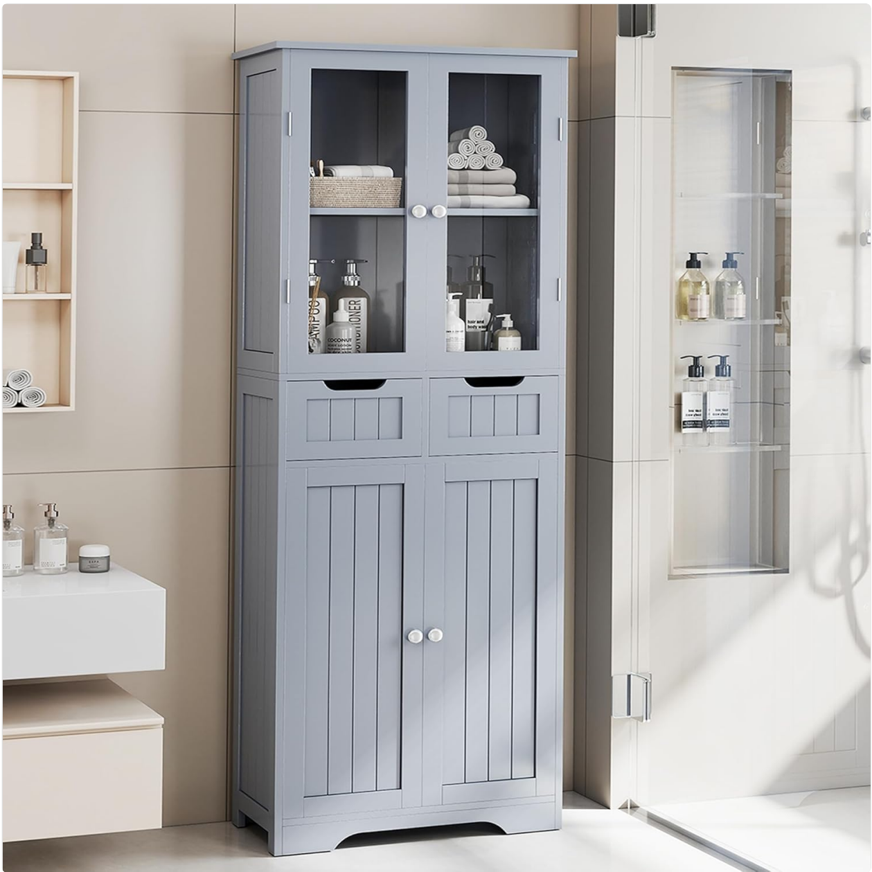
Image 1.1: The TOLEAD 67-inch Tall Grey Bathroom Storage Cabinet, featuring glass doors on the upper section and solid doors on the lower section, with two central drawers.