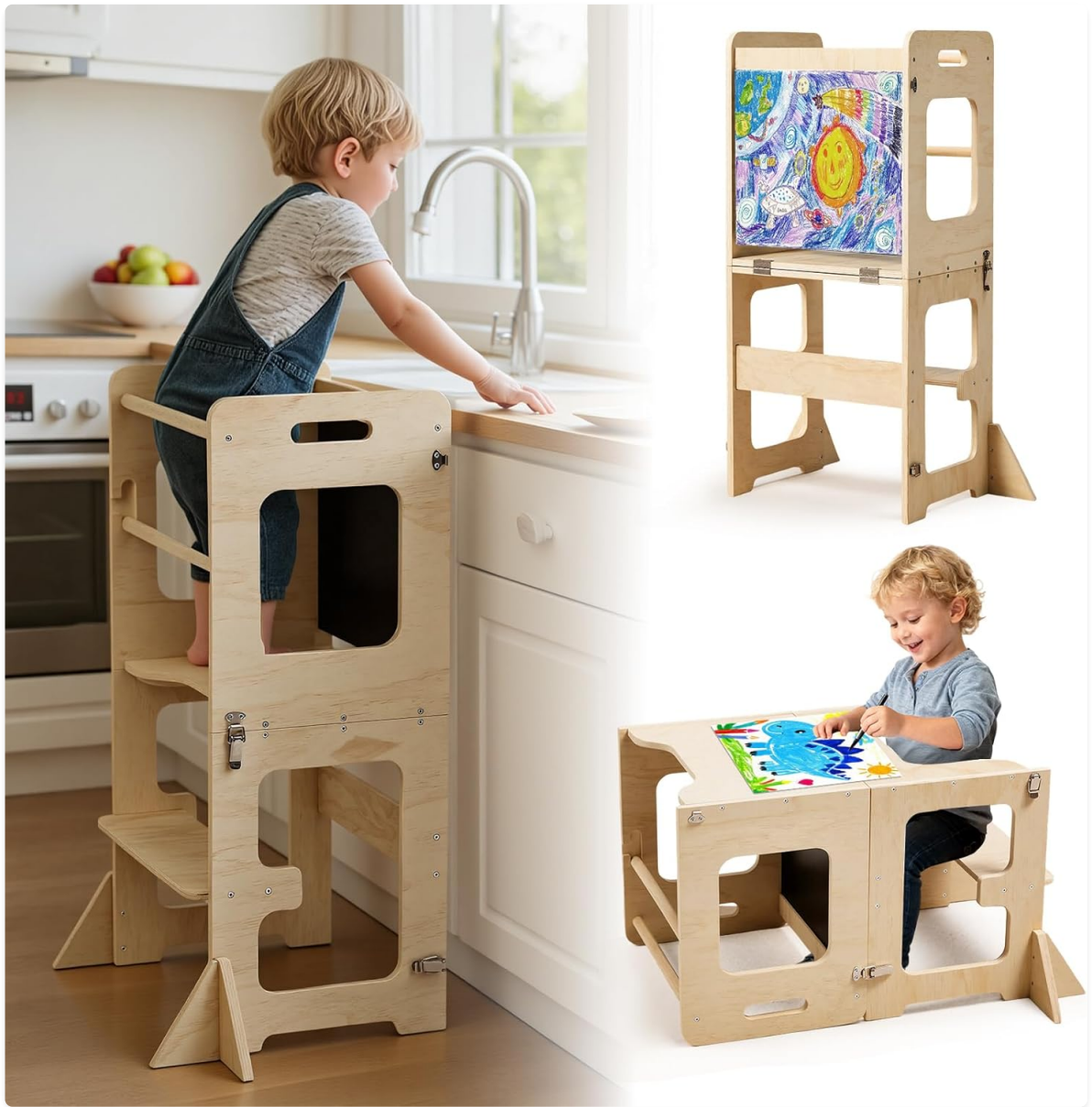
Image 1: The labebe Toddler Standing Tower in its upright position, positioned next to a kitchen counter, allowing a child to safely reach the countertop.