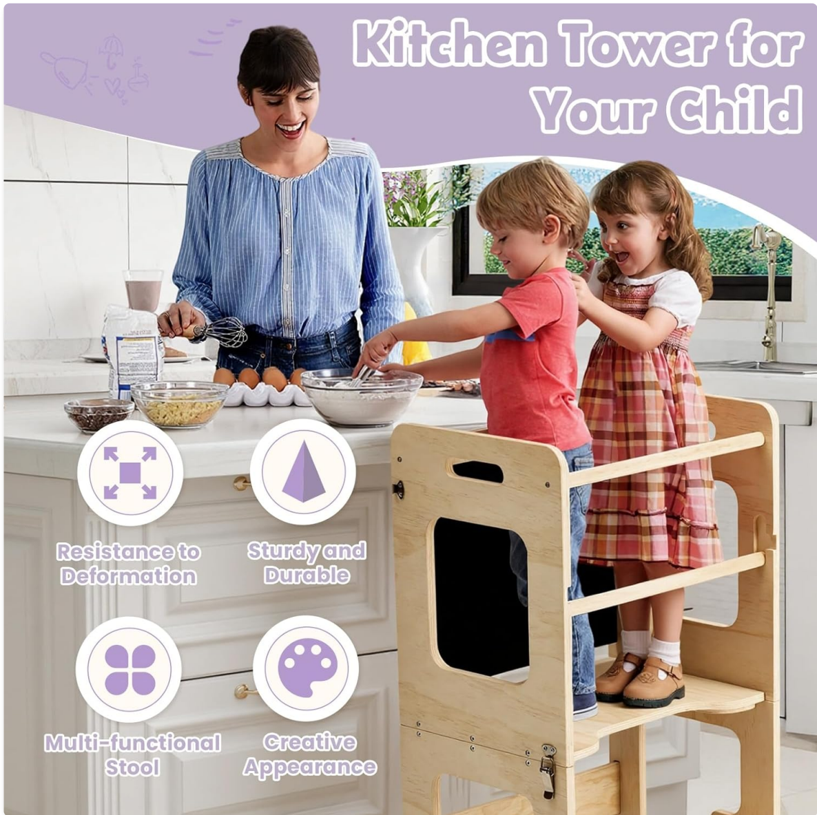
Image 7: A child actively participating in kitchen tasks using the standing tower and another child drawing on the integrated blackboard.