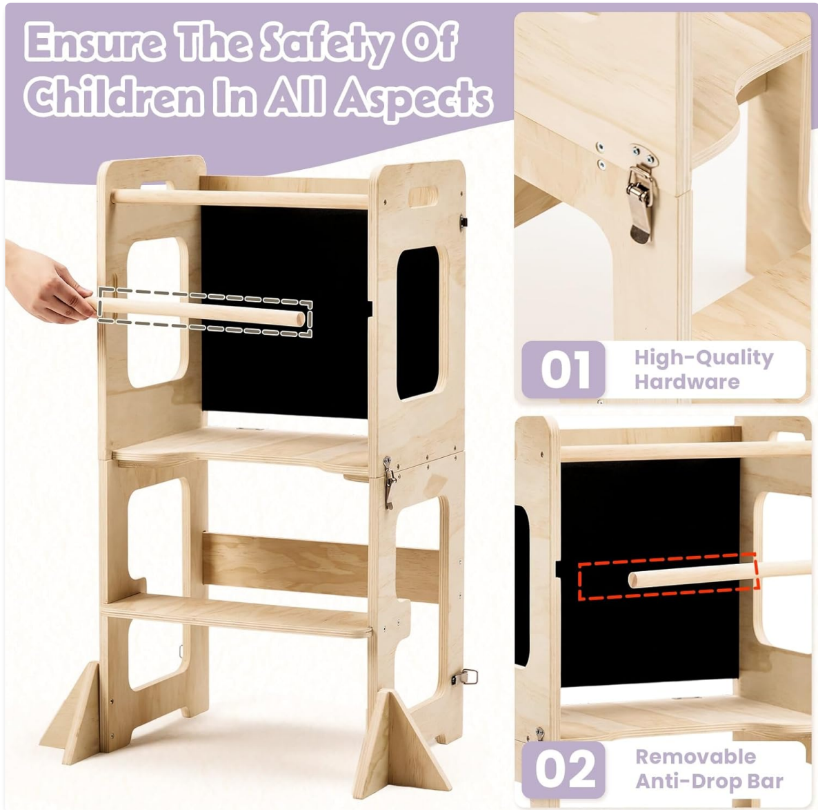
Image 4: A close-up view of the high-quality hardware and the removable anti-drop bar, crucial for child safety in the standing tower mode.