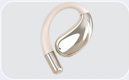
Ergonomic Ear Hooks