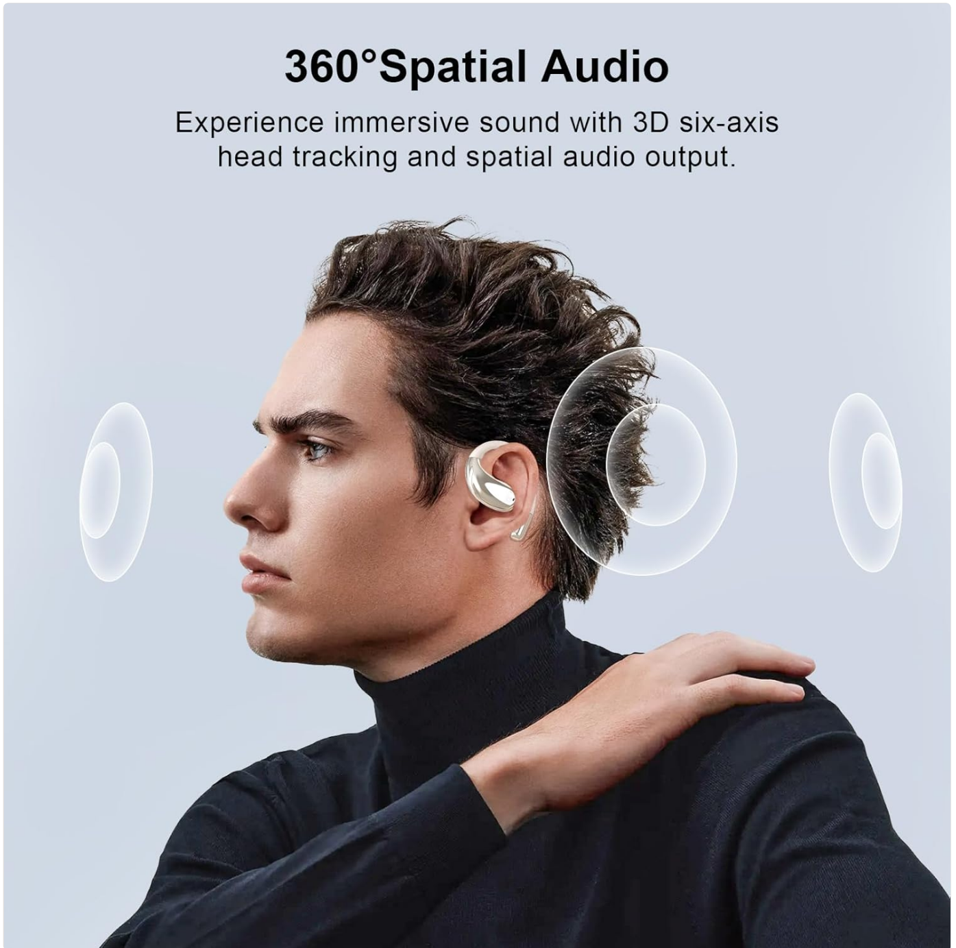
Image: A person wearing the Psadhi J500 Plus earbuds, demonstrating the open-ear clip design and how they sit on the ear.

Experience immersive sound with 3D six-axis head tracking and spatial audio output.