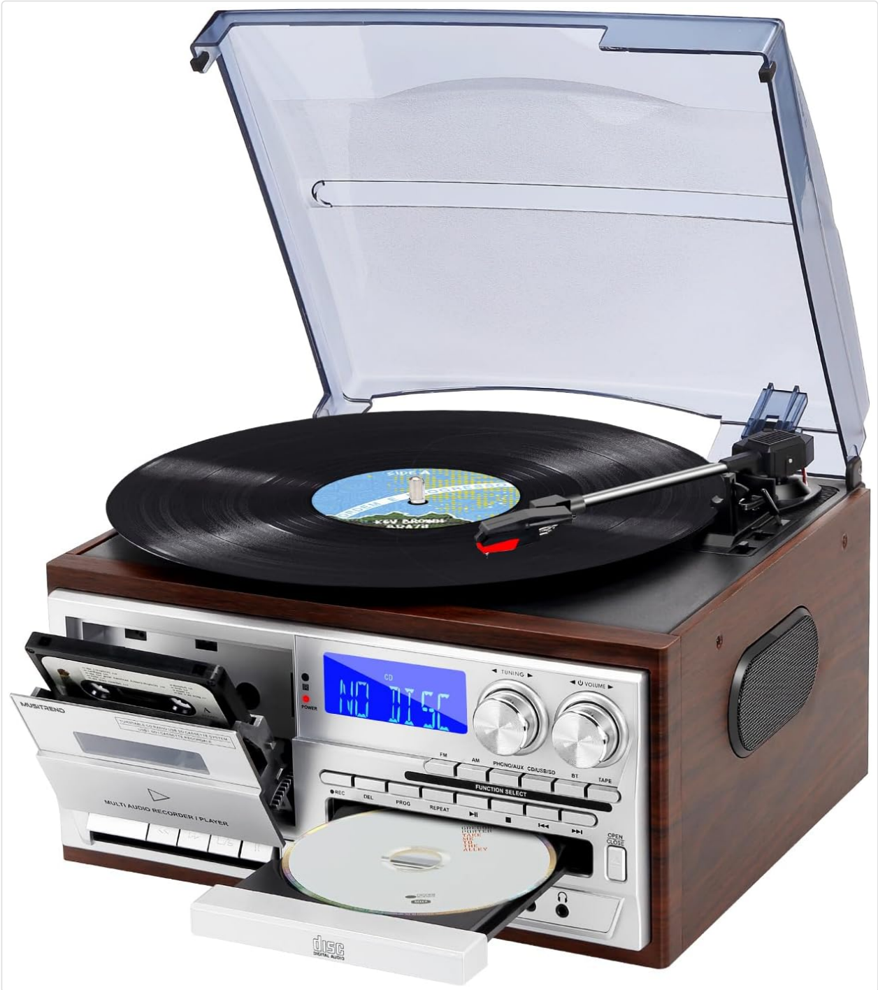
Figure 3.1: Front view of the MUSITREND T408 Record Player.

The MUSITREND T408 is a comprehensive audio system designed for various media playback. It features a classic wooden finish with a silver-toned control panel.