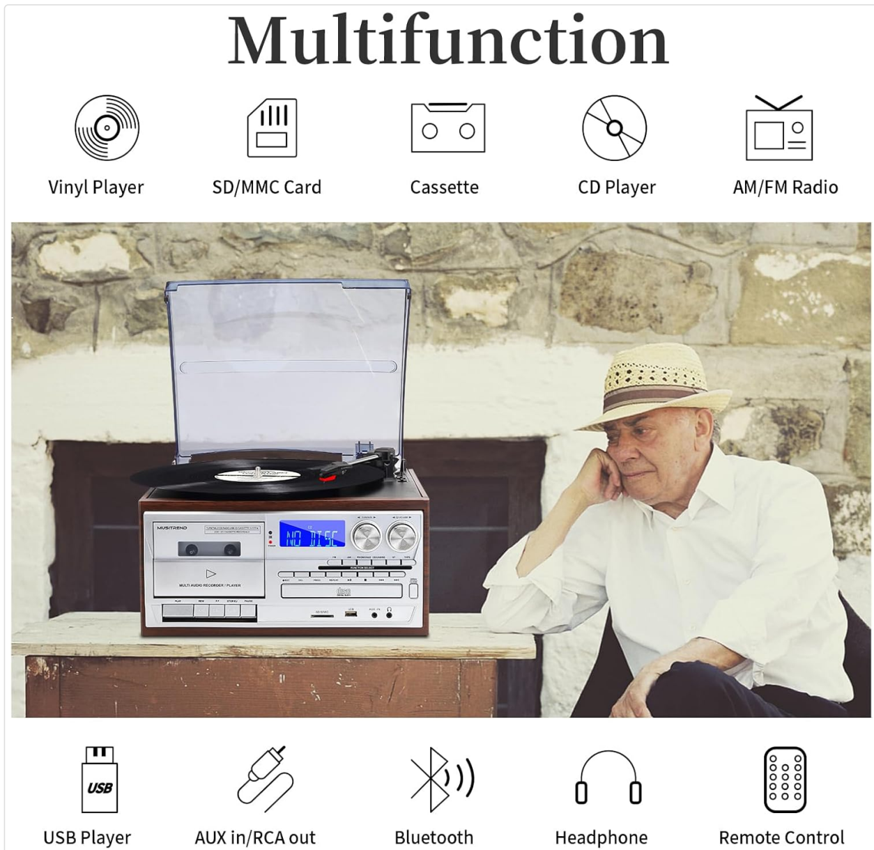
Figure 3.2: Overview of the MUSITREND T408's multiple functions.