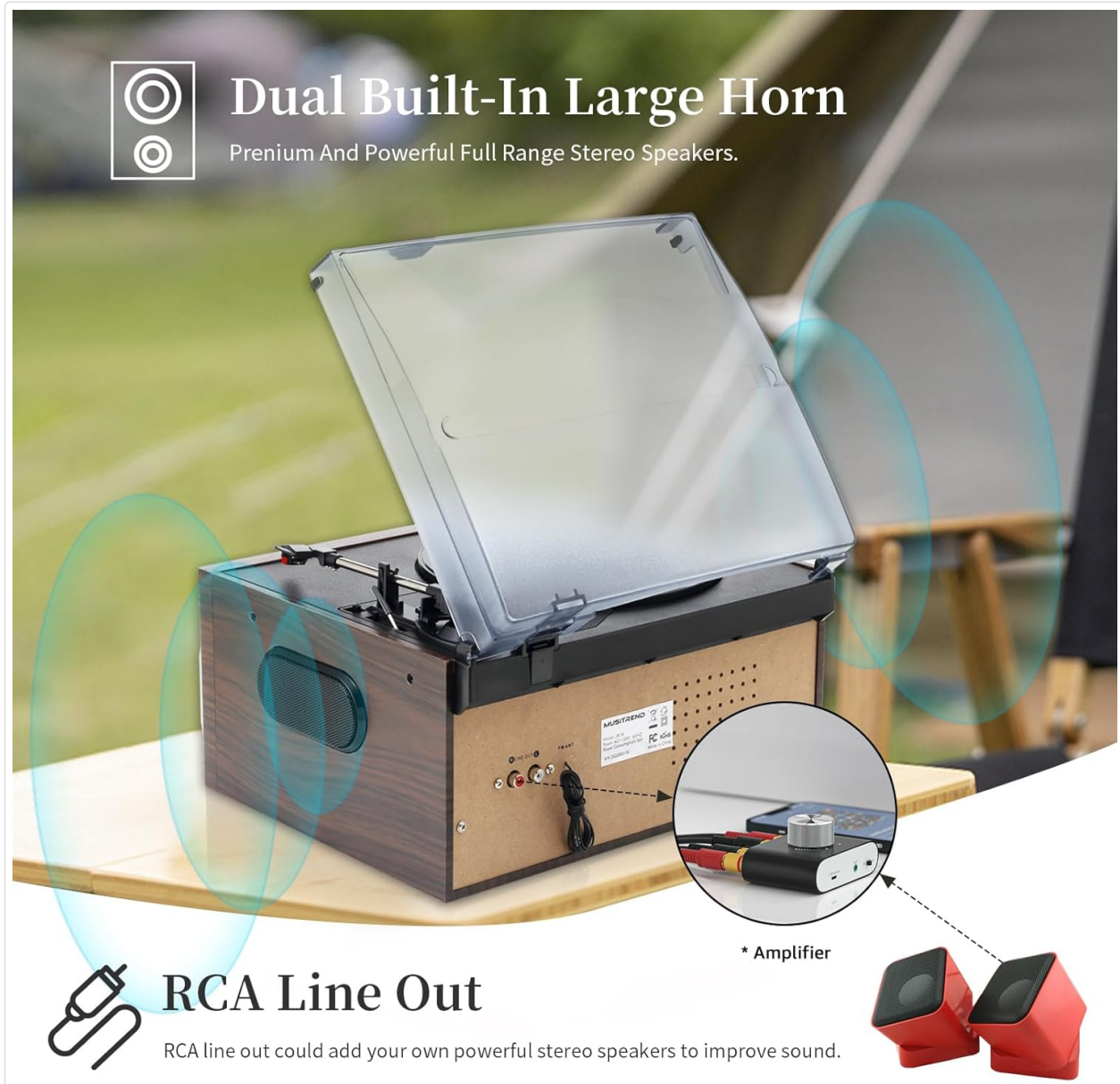
Figure 4.1: RCA Line Out connection points on the rear panel.