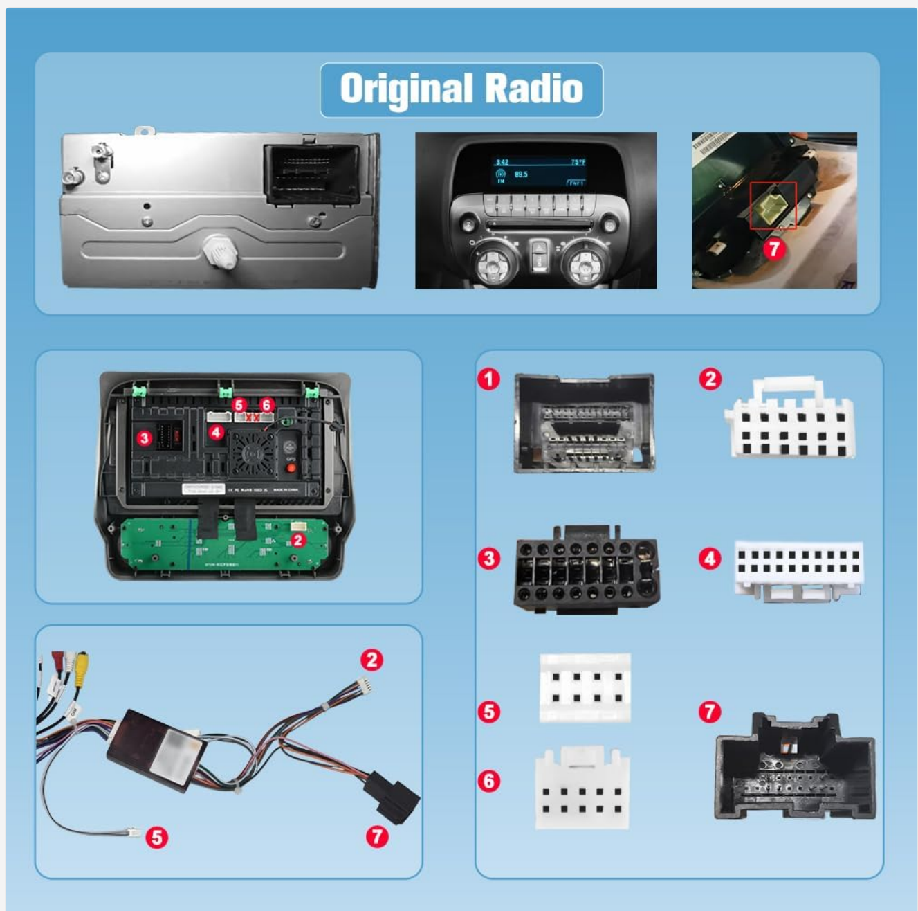
Figure 3.1: Before and after installation of the Junsun Car Stereo in a Chevrolet Camaro.