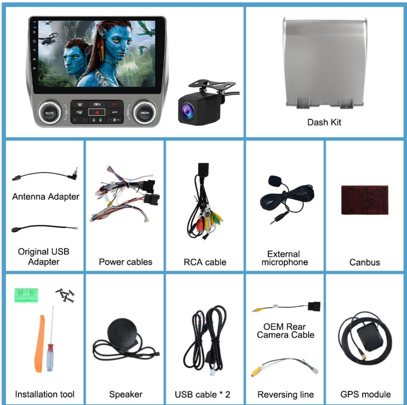
Figure 2.1: All components included in the Junsun Car Stereo package.