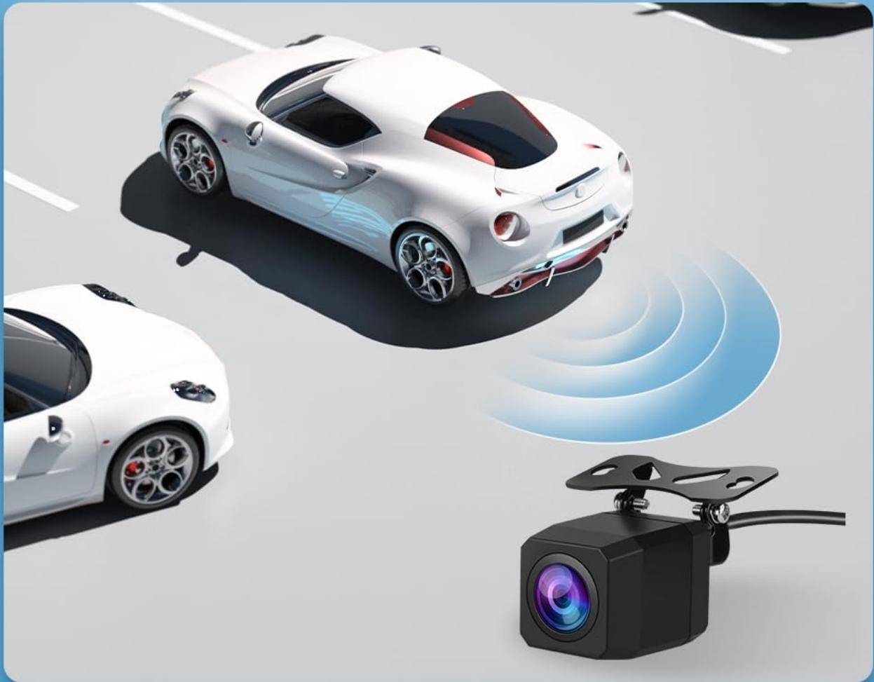
Figure 4.4: Backup camera view for parking assistance.

provide a rear view and parking assistance when the reverse gear engaged.