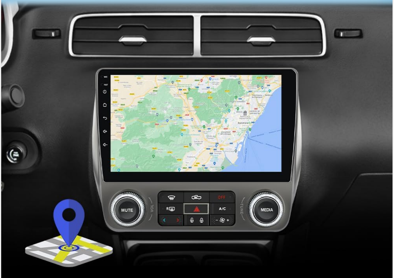
Figure 4.2: GPS Navigation display.

Built in offline North American map. Also support online map, when you connect WiFi you can use the GPS navigation anywhere. By WiFi you can download or delete apps in APP Store, as the same as phone.