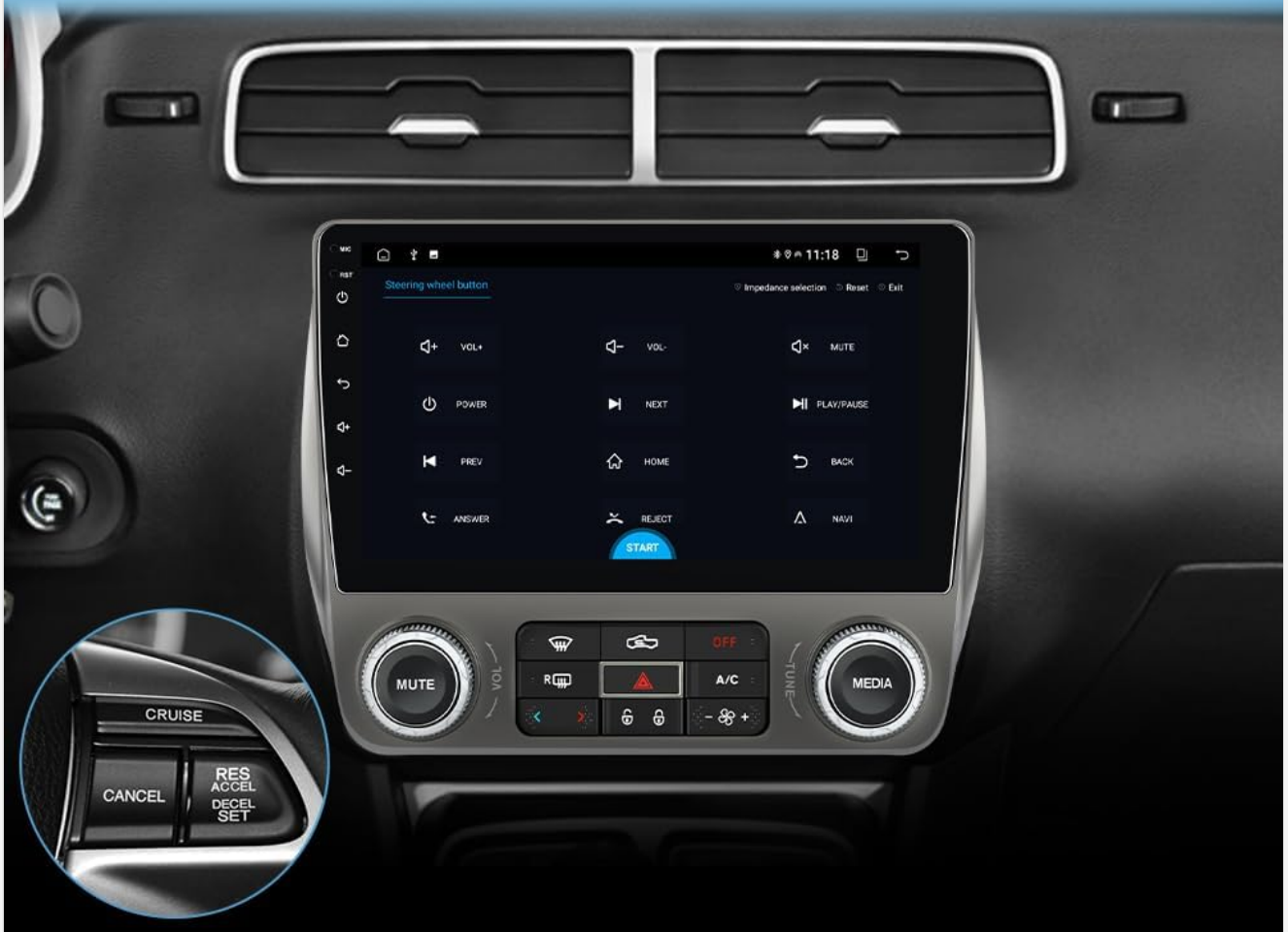
Figure 4.3: Steering Wheel Control interface.

You can adjusting the volume with the steering wheel control. Quickly switch songs and channels with your SWC Function, keep your attention and eyes on the road.