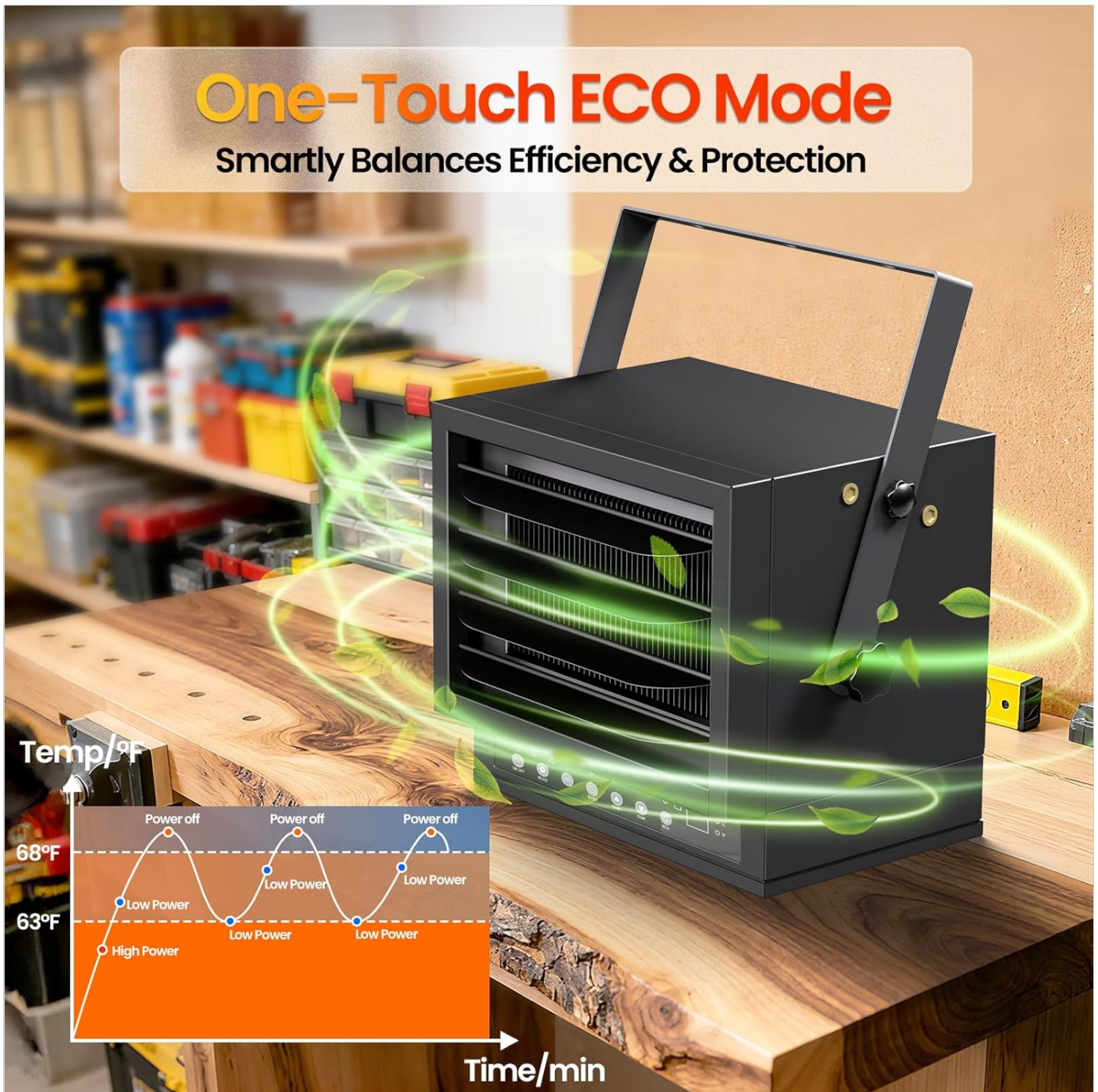
Image: A visual representation of how the ECO mode intelligently manages power consumption to optimize energy efficiency.