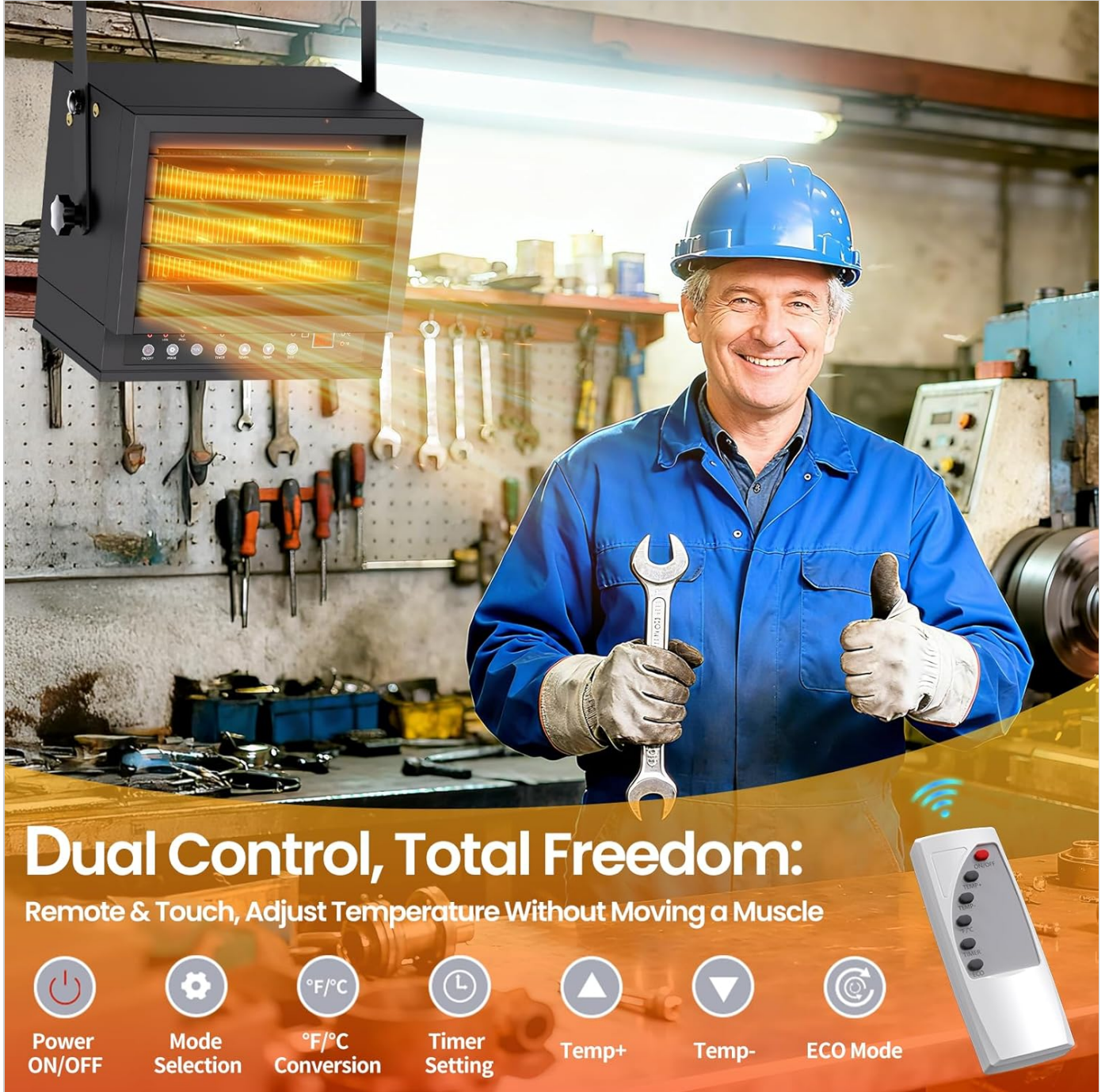
Image: The heater's control panel and remote, showing buttons for Power, Mode, Temperature, Timer, and ECO mode.