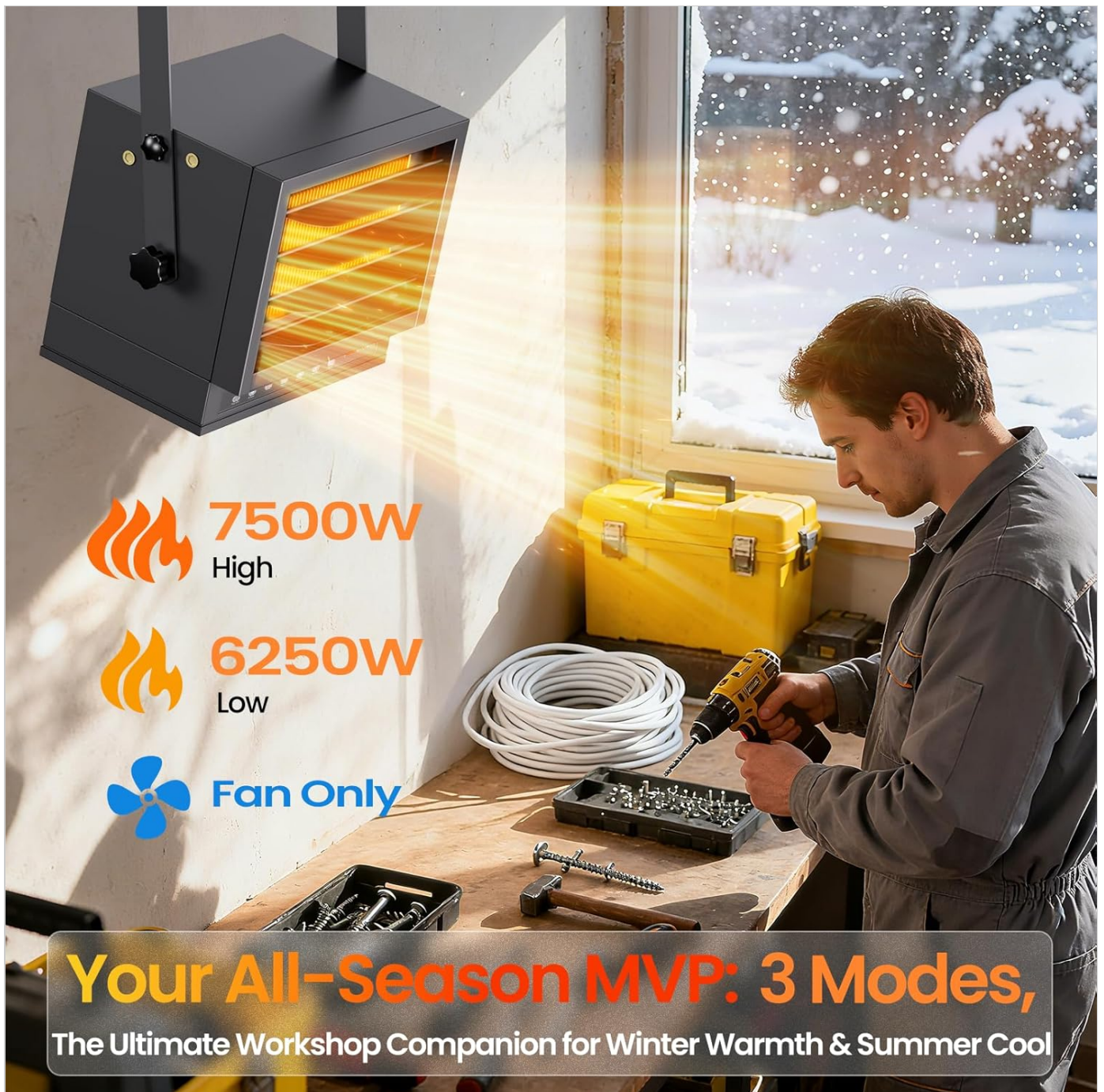
Image: Illustration of the heater's three operating modes: 7500W (High), 6250W (Low), and Fan Only.