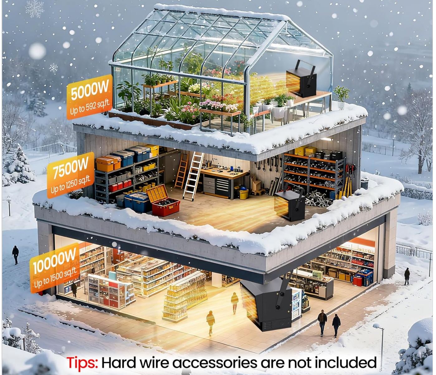
Image: The Riseon 7500W Electric Garage Heater, showcasing its robust design and adjustable mounting bracket.