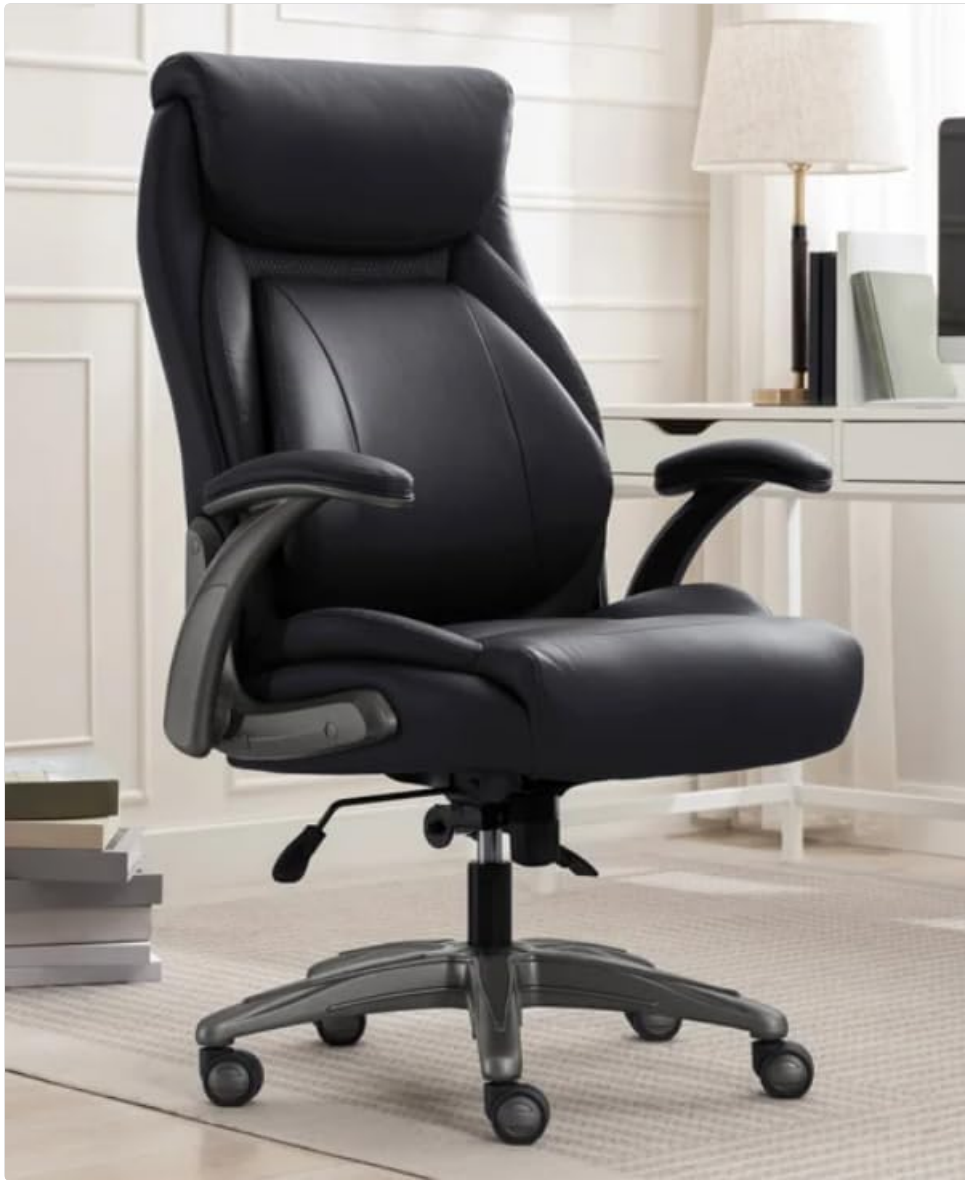
Image 1.1: The L.a.Z.-Boy Air Lumbar Manager Office Chair in an office setting.