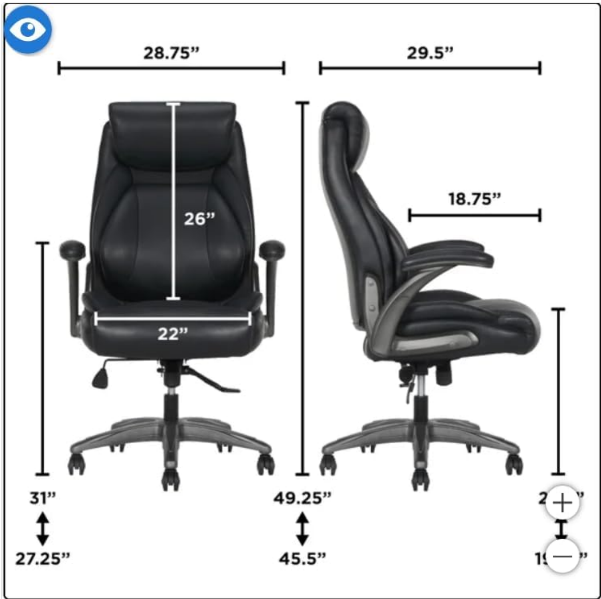
Image 4.1: Diagram illustrating the chair's dimensions for reference during assembly and placement.