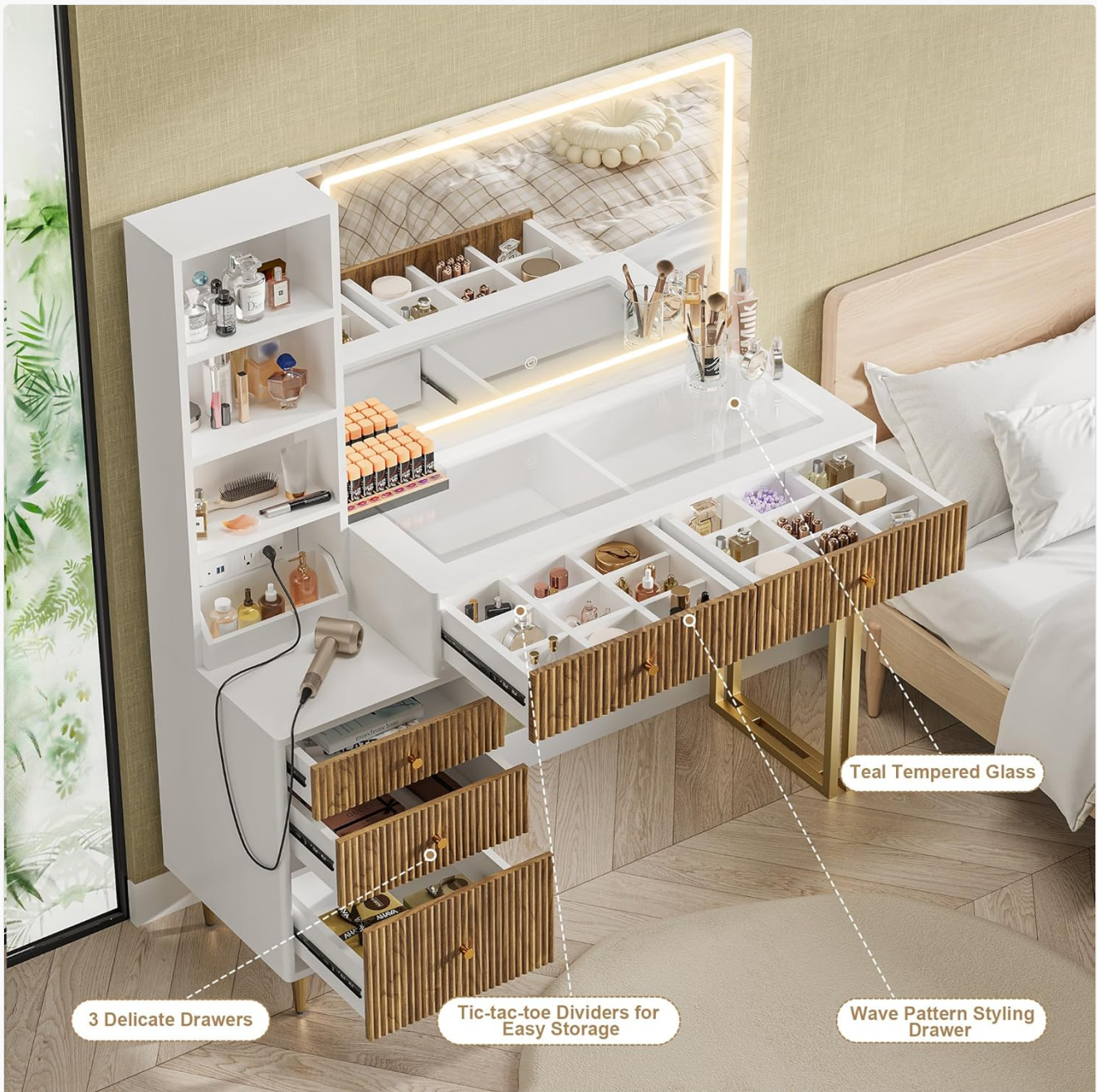
Figure 2: Detailed view of the vanity's storage, including the transparent top drawers with tic-tac-toe dividers for organizing small items and a movable small drawer for flexible storage.