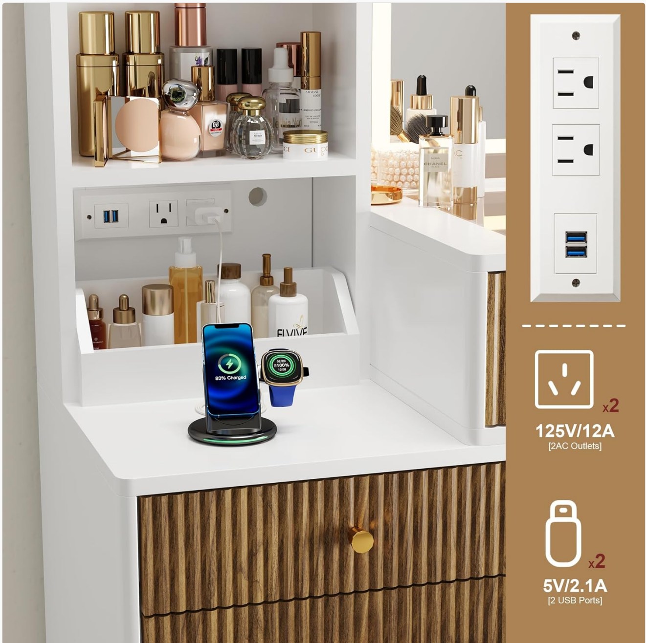
Figure 4: A close-up view of the integrated charging station, highlighting the two 125V/12A AC outlets and two 5V/2.1A USB ports for convenient device charging.