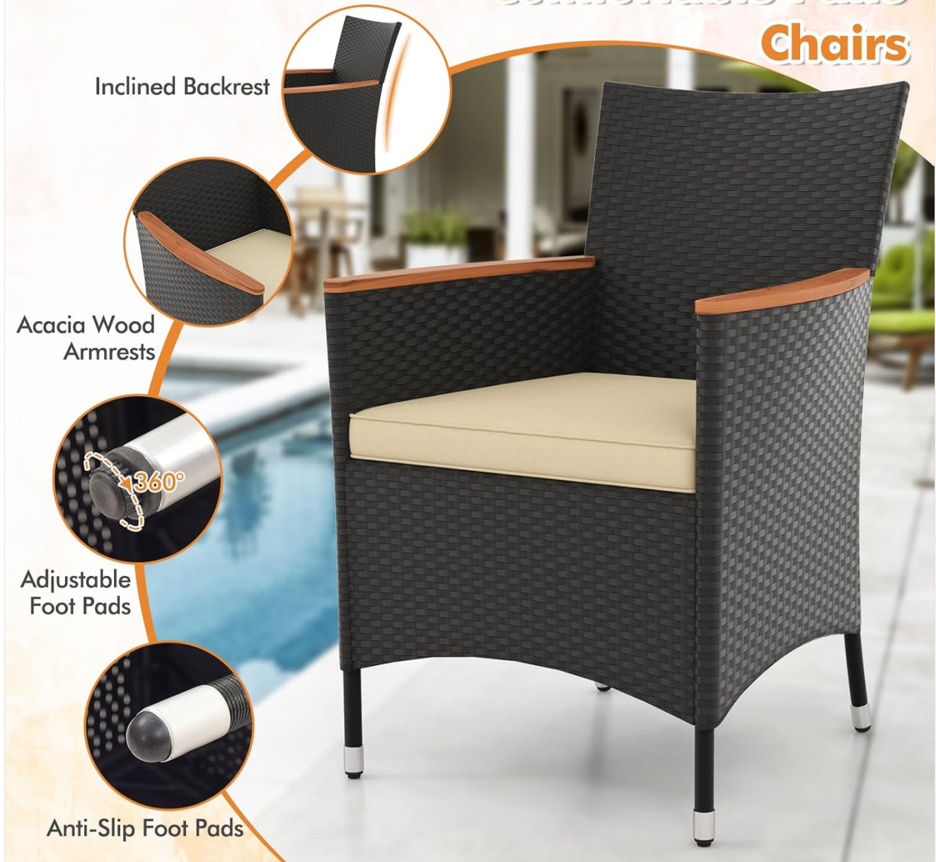
Image: Comfortable patio chairs. This image illustrates the design features of the chairs, including an inclined backrest for comfort, acacia wood armrests, 360-degree adjustable foot pads for stability on uneven ground, and anti-slip foot pads.

No official seller assembly videos are available for this specific product model. Please refer to the detailed instructions provided in the included User Guide.