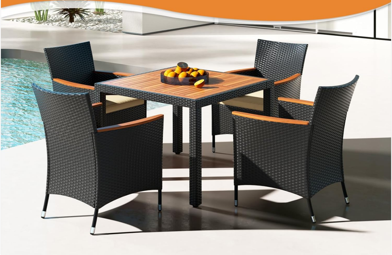
Image: Selected materials for outdoor use. This image highlights the premium PE rattan, which is long-lasting and anti-fading, and the sprayed metal construction, which is reinforced and rustproof, ensuring durability for outdoor environments.