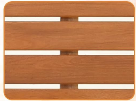
Slatted Acacia Wood Top Ensure no more standing water