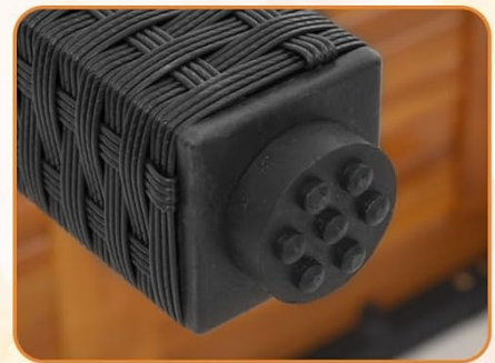
Anti-Slip Foot Pads Provide exceptional stability

Image: Practical outdoor table features. This image shows the slatted acacia wood top designed to prevent standing water, the 1.97-inch umbrella hole for sun shade, and anti-slip foot pads for stability.