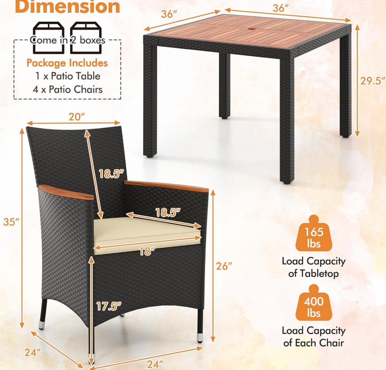
Image: Package contents and dimensions. The package includes one patio table and four patio chairs. The table measures 36"L x 36"W x 29.5"H. Each chair measures 24"L x 24"W x 35"H, with a seat size of 18.5"L x 18"W and a seat height of 17.5".