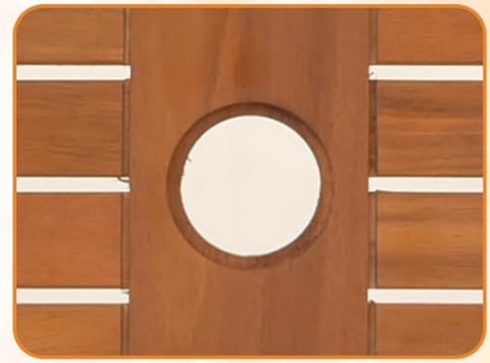
1.97" Umbrella Hole Hold your own parasol for a large sun shade